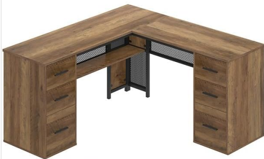
SHELF ON THE LEFT SIDE