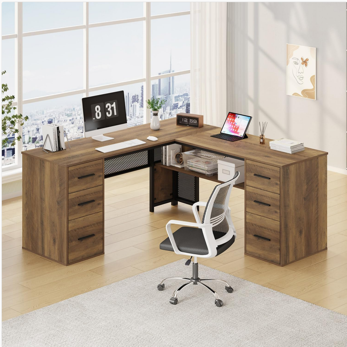
Image 1: Fully assembled HSH L-Shaped Home Office Desk in Rustic Oak.