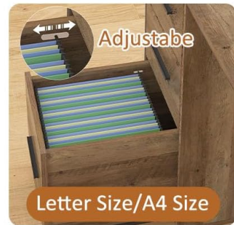
Image 3: Close-up view of the desk's drawers, highlighting the file cabinet functionality for letter/A4/legal size files.