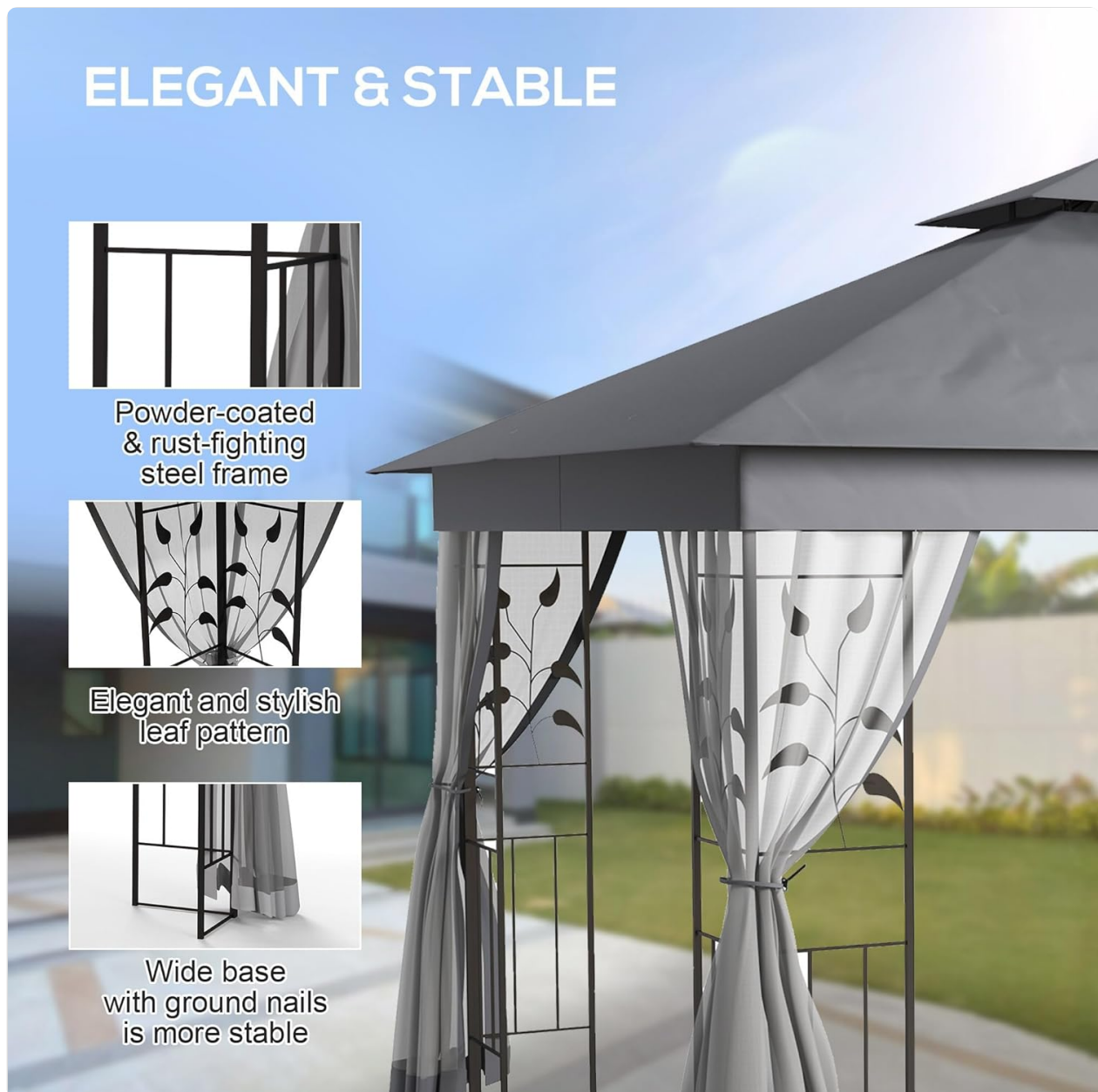
Figure 2: The powder-coated steel frame with elegant tree motifs provides stability and aesthetic appeal.