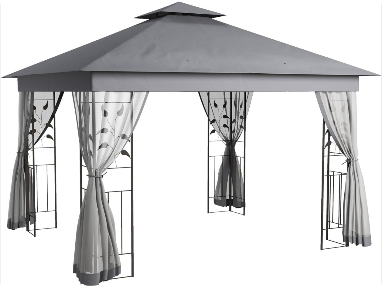
Figure 1: Outsunny 10' x 11.5' Metal Patio Gazebo in a typical outdoor setting.