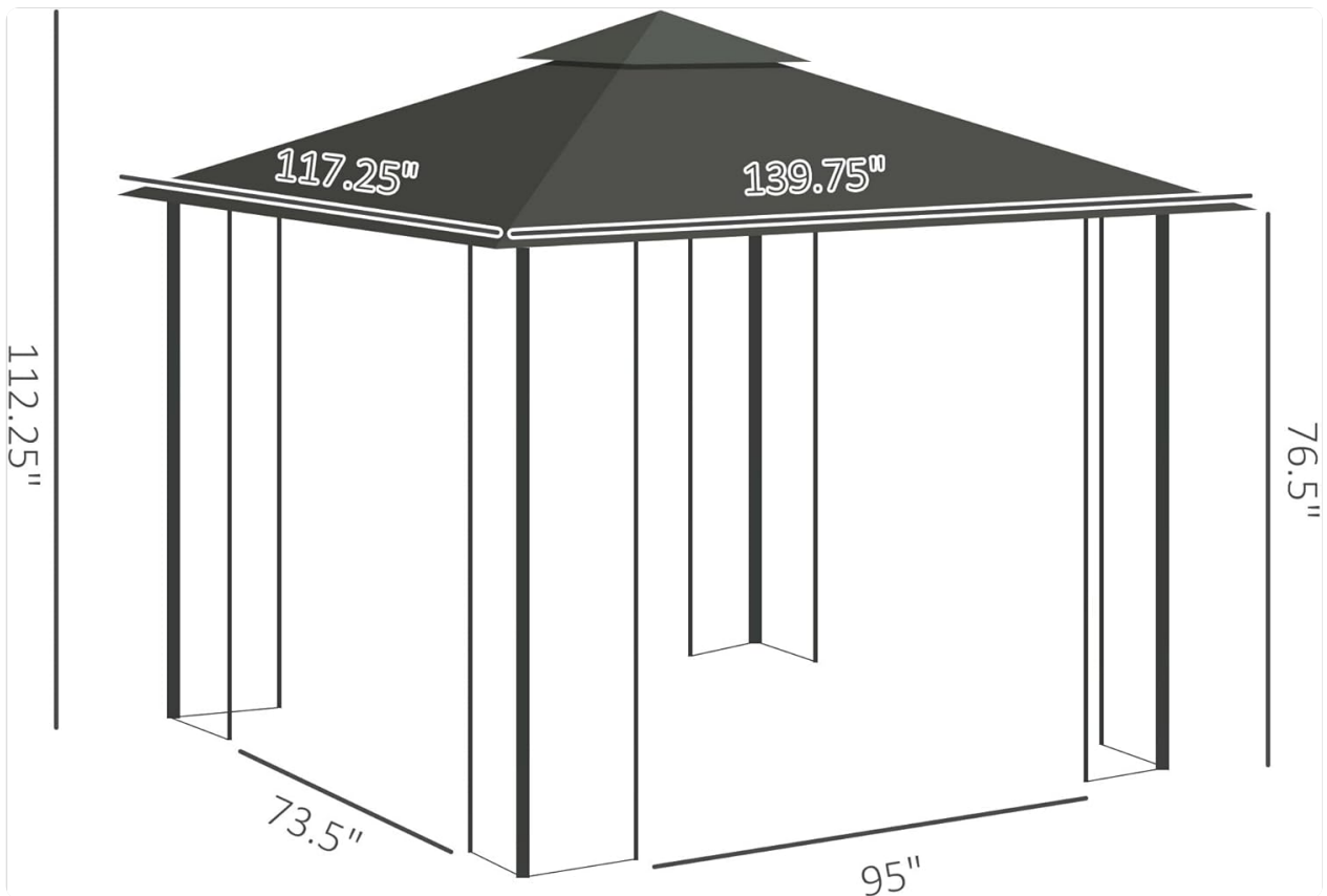
Figure 5: Key dimensions of the gazebo for planning your outdoor space.