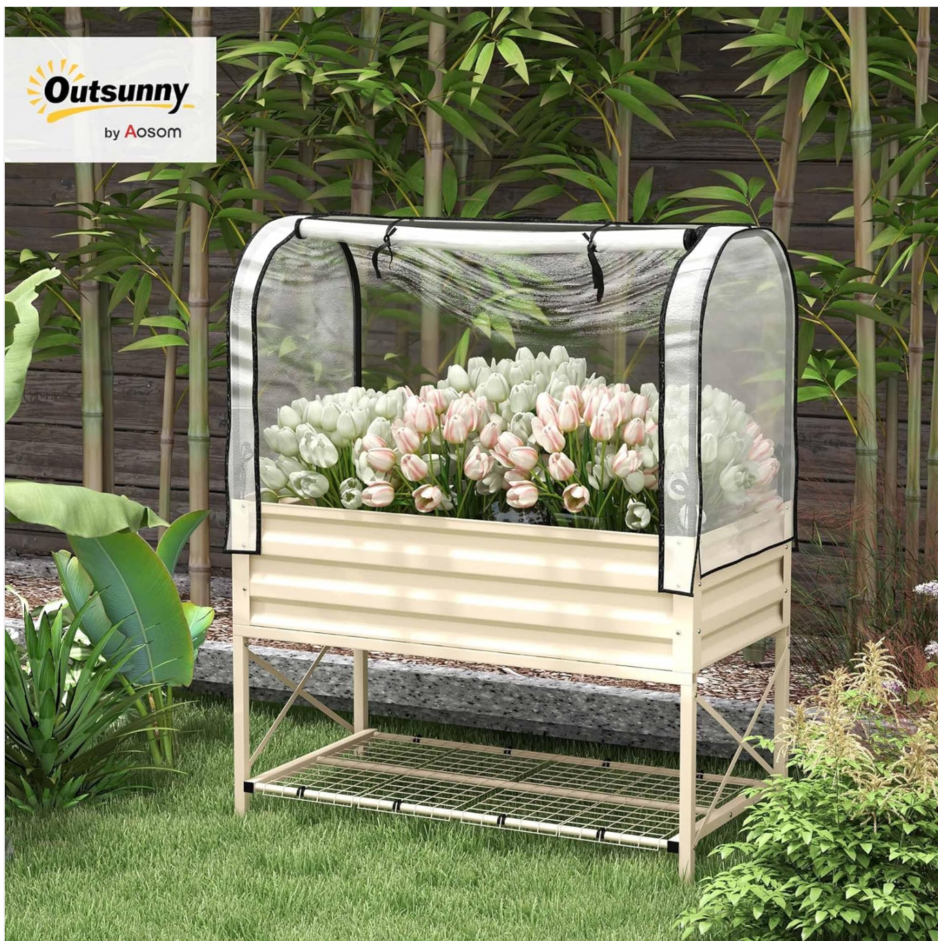
Image: The Outsunny Raised Garden Bed with Cover and Storage Shelf, showcasing its design and functionality in a garden setting.