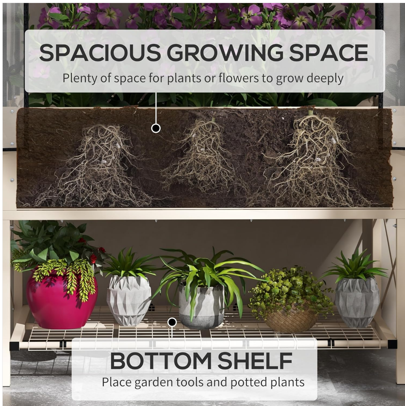
Image: Illustration showing the spacious growing area for plant roots and the functional bottom shelf for storing garden tools and potted plants.