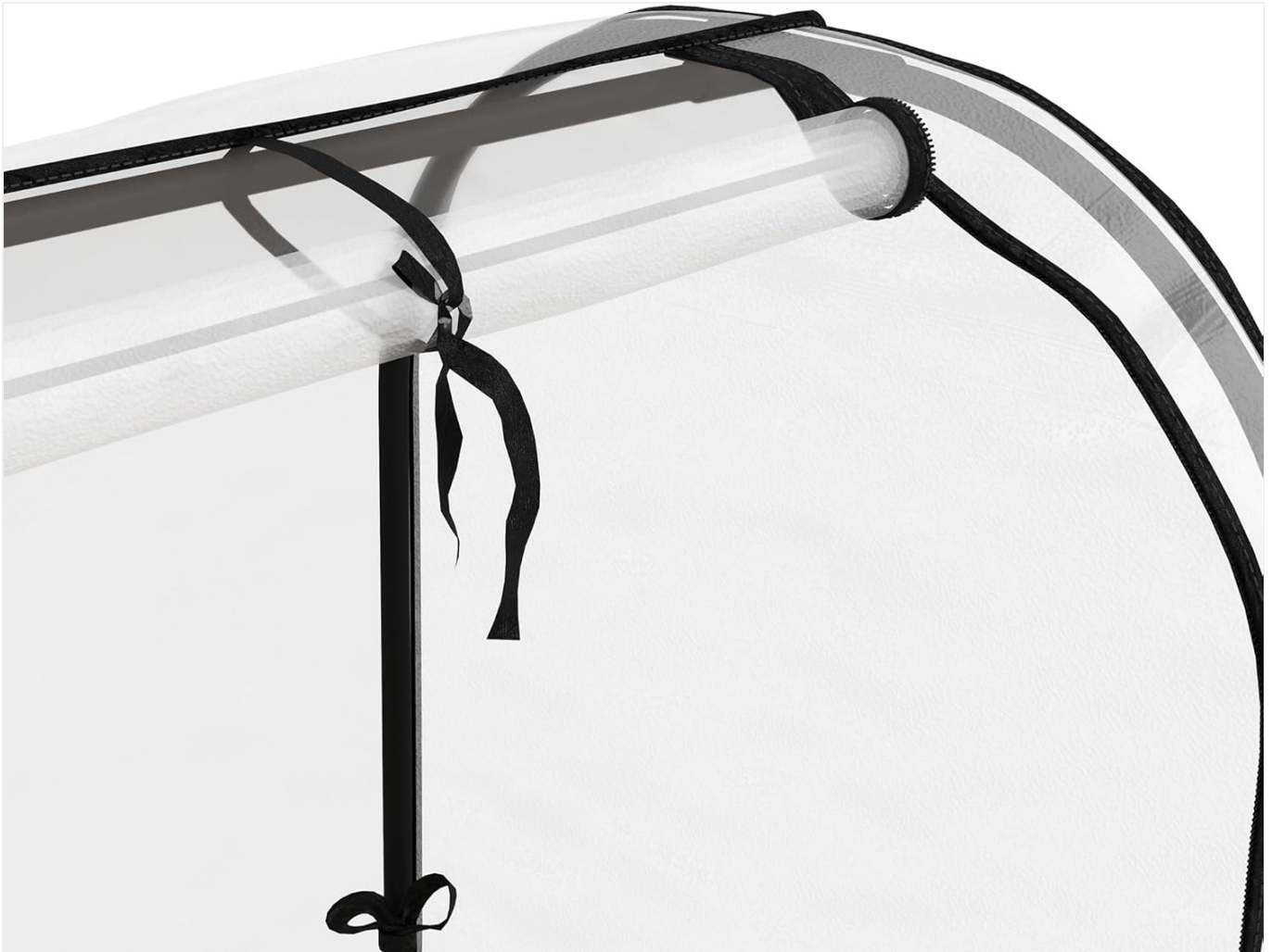
Image: Detail of how the greenhouse cover attaches to the frame, showing the securing ties.