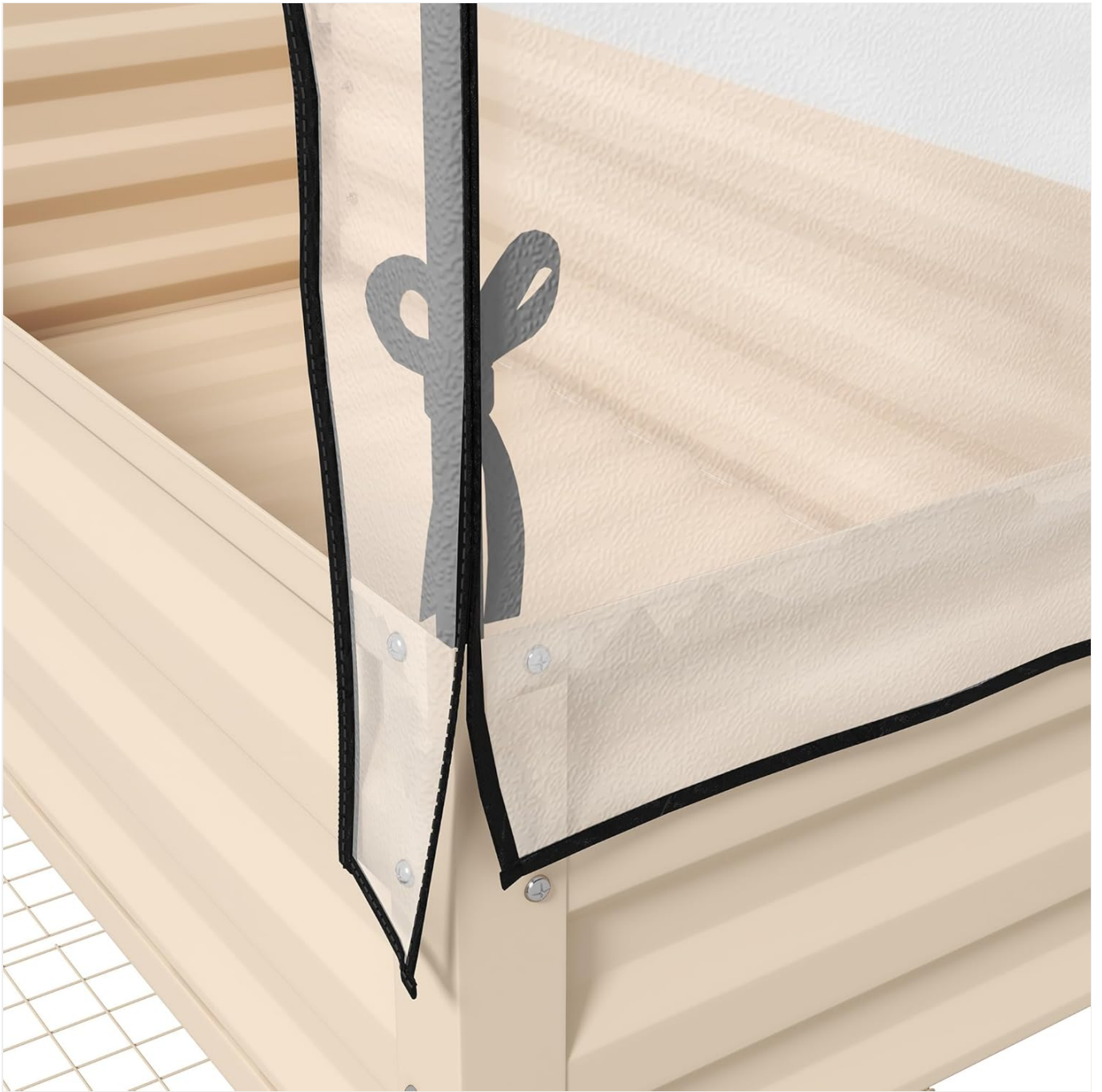
Image: Close-up of the roll-up door on the greenhouse cover, showing how it can be opened and secured for ventilation and access.