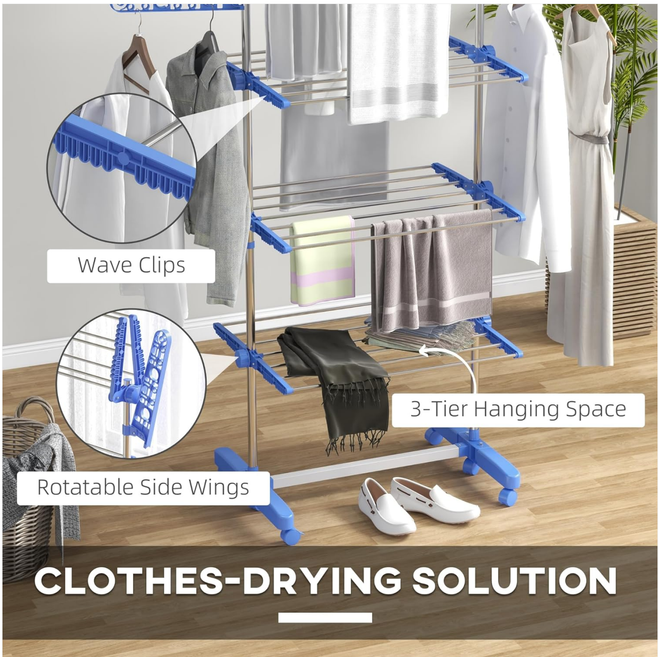
Image: A detailed view of the drying rack's wave clips and rotatable side wings, demonstrating their use for hanging various items.