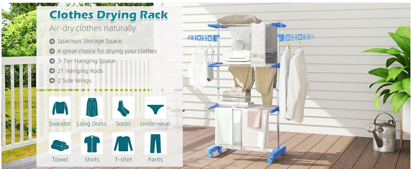
Image: The HOMCOM 3-Tier Foldable Clothes Drying Rack shown in an outdoor setting, fully extended and laden with various clothing items.

The HOMCOM 3-Tier Foldable Clothes Drying Rack is a versatile and space-saving solution for air-drying laundry. Constructed from rust-proof stainless steel, it features a robust design suitable for both indoor and outdoor use. Its adjustable tiers and rotatable side wings provide ample hanging capacity for various items, from delicate garments to large blankets. Equipped with universal casters, including two with brakes, the rack offers easy mobility and secure placement.