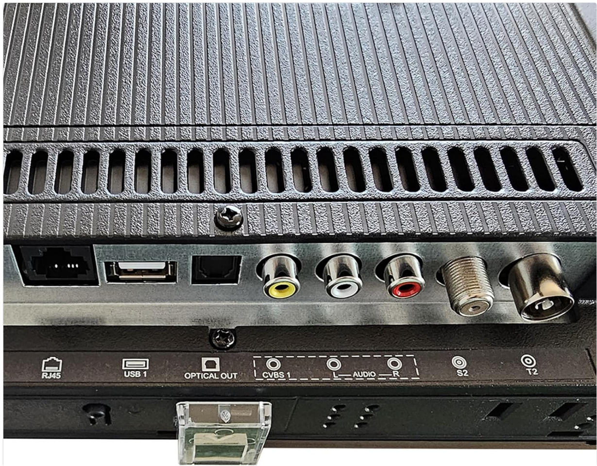
Image 5.3: Close-up of the RJ45, USB 1, Optical Out, CVBS 1, Audio L/R, S2, and T2 antenna input ports.