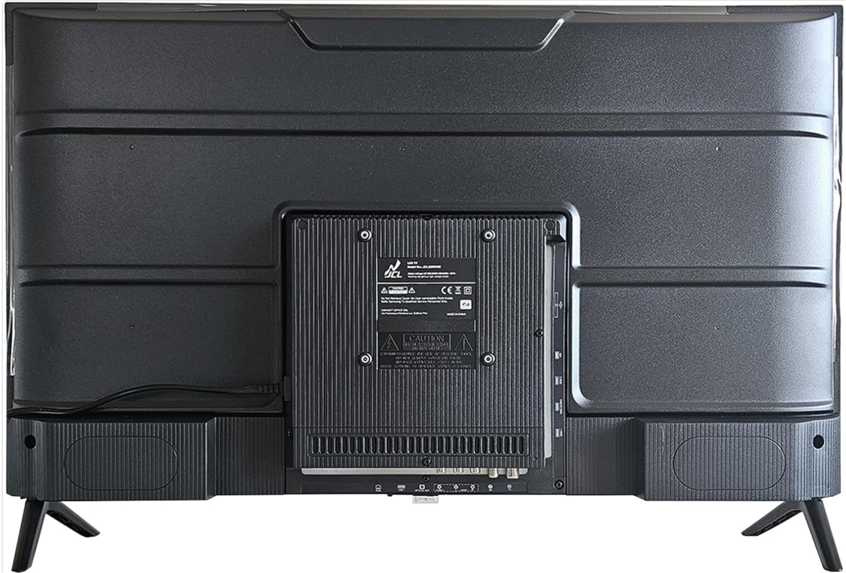
Image 5.1: Rear view of the JCL JCL32RWHD Smart TV, illustrating the layout of its various connection ports.