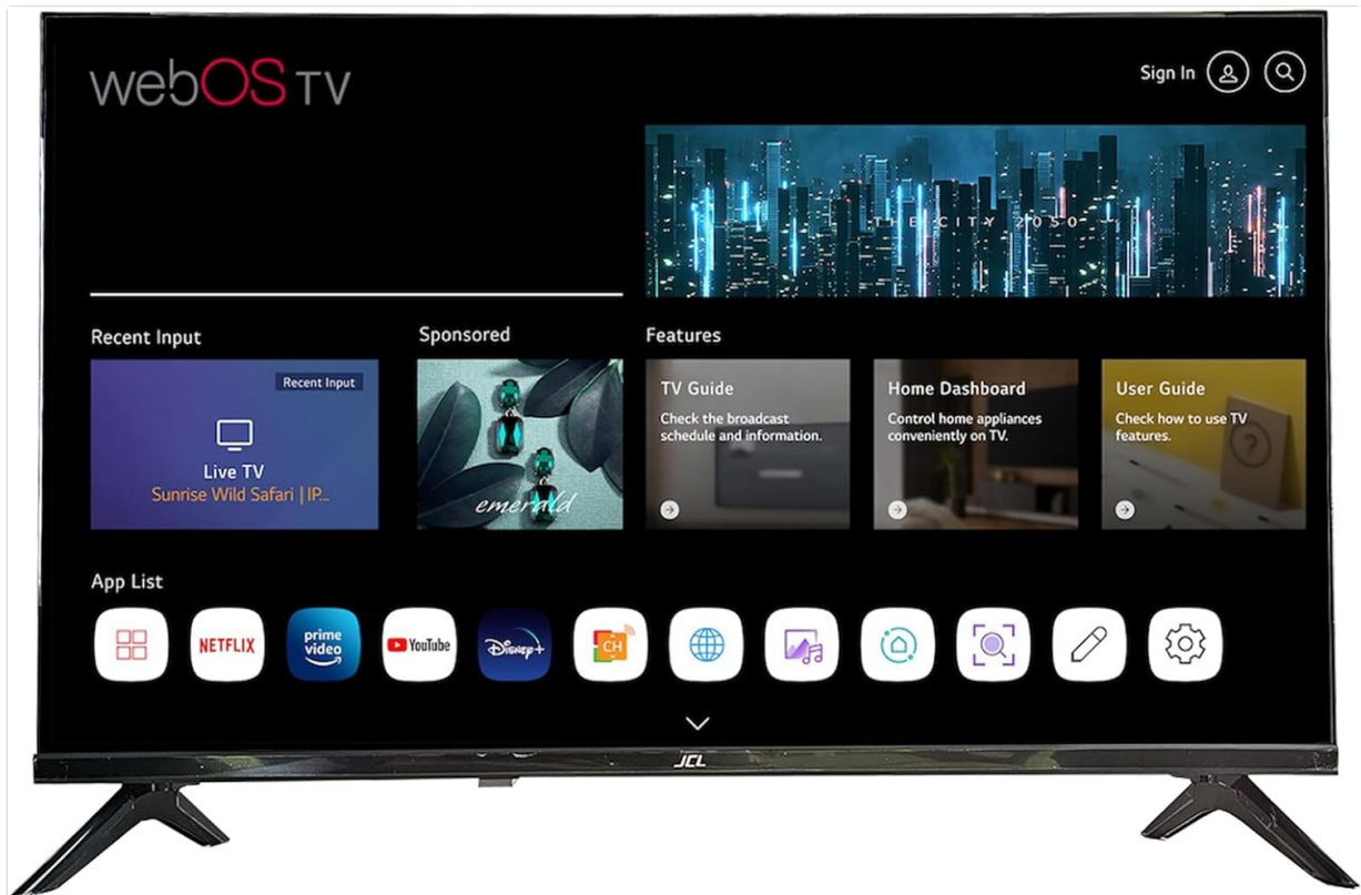
Image 1.1: Front view of the JCL JCL32RWHD Smart TV, showcasing its webOS TV interface with various apps and features.

The JCL JCL32RWHD features a 32-inch HD Ready 720p display, integrated webOS TV 8.1 for smart functionality, and a versatile DVB +T/T2/C/S/S2 tuner for various broadcast standards. Connectivity options include Wi-Fi, Ethernet, multiple HDMI ports, and USB ports.