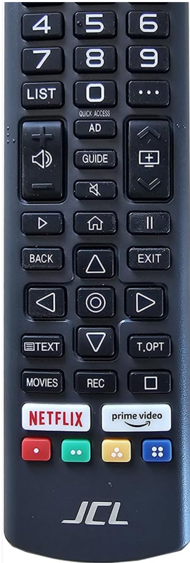
Image 6.1: The JCL Smart TV remote control, featuring dedicated buttons for power, input selection, volume, channel control, navigation, and quick access to streaming services like Netflix and Prime Video.