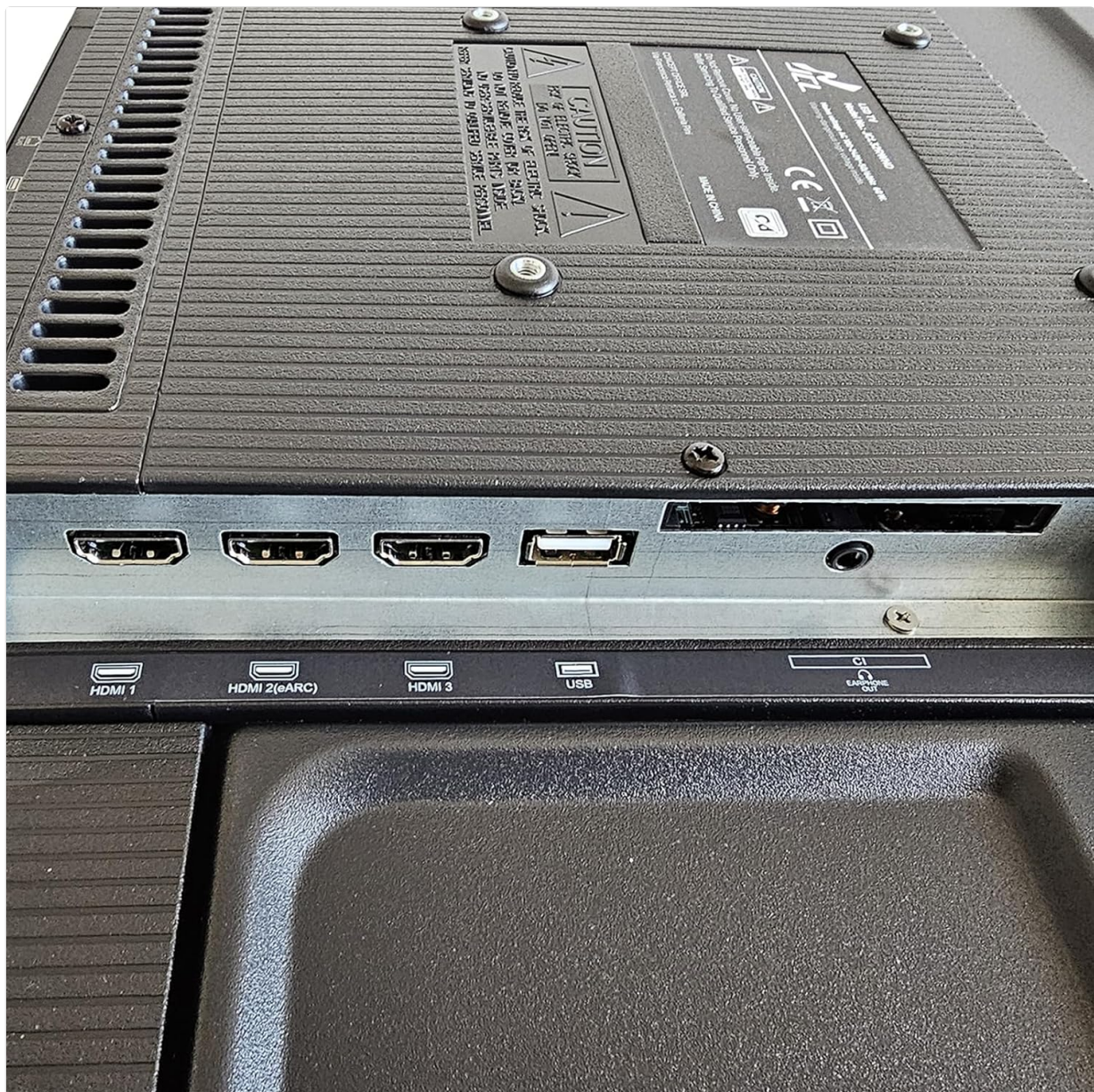
Image 5.2: Detailed view of the HDMI 1, HDMI 2 (ARC), HDMI 3, and USB ports located on the rear of the television.