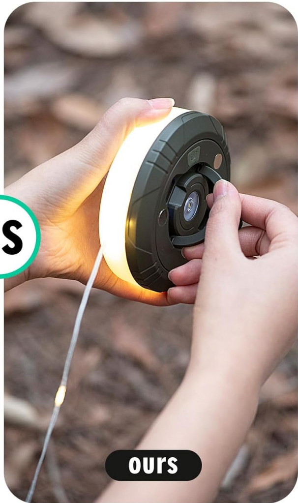
Image: The quick roll-up mechanism for retracting the string lights.