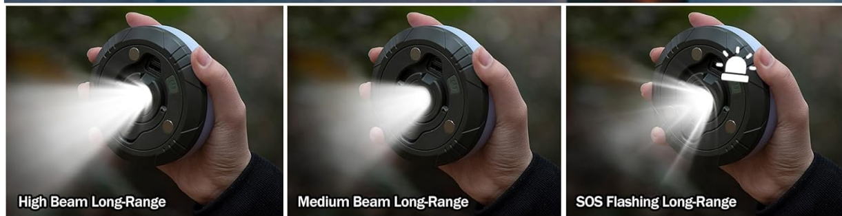
Image: Visual representation of the 8 available lighting modes.