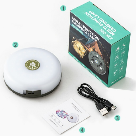
Image: The Sutaig Camping String Lights package contents, including the main unit, charging cable, and user manual.