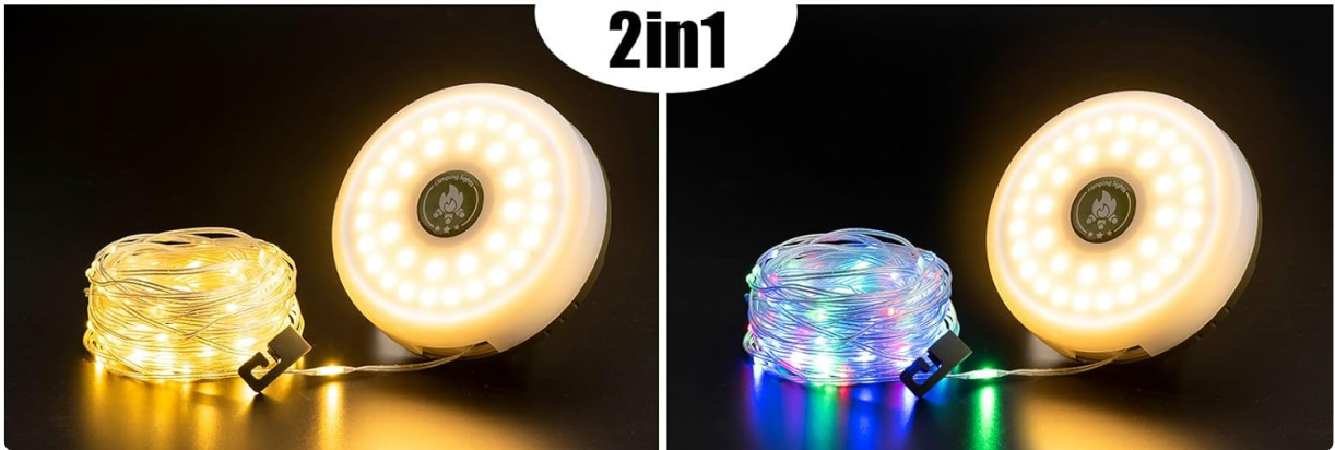
Image: The Sutaig Camping String Lights demonstrating its dual functionality as a lantern and string lights.