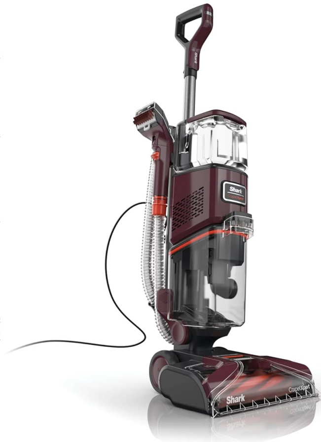
Figure 8.1: Front View of Shark EX150 CarpetXpert