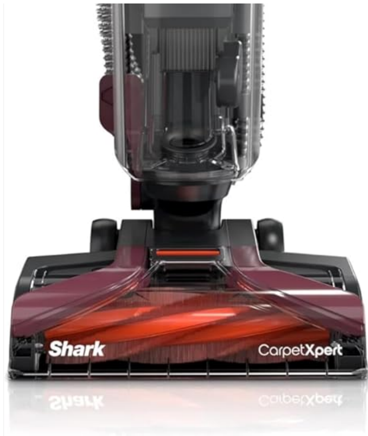
Figure 3.1: Included Components