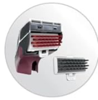
3.5" Reversible Bristle Tool