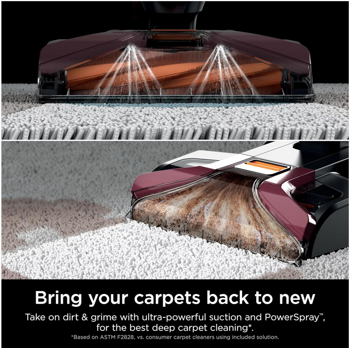
Figure 5.1: Carpet Deep Cleaning Action