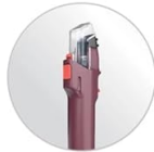
Integrated Crevice Tool