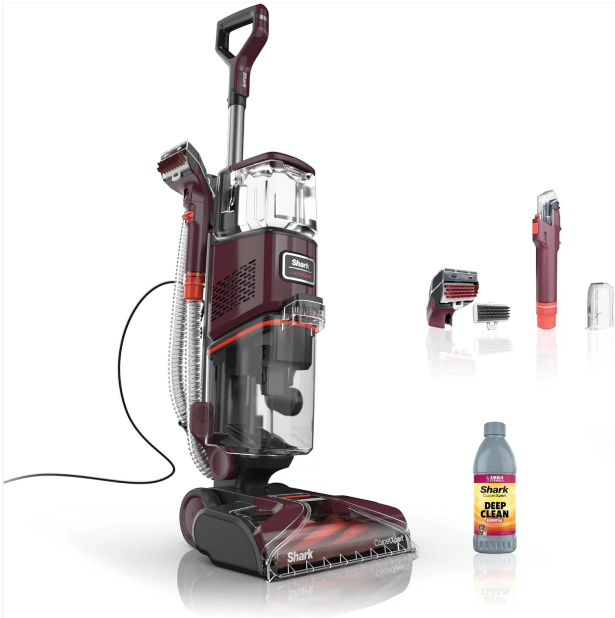
Figure 1.1: Shark EX150 CarpetXpert Cleaner and Included Accessories