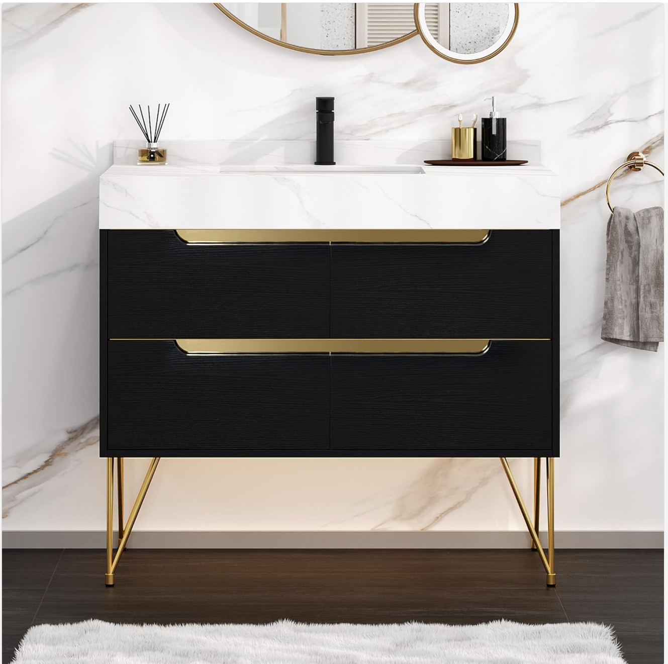
Front view of the DWVO 36-inch bathroom vanity, showcasing the black cabinet, white sintered stone countertop, integrated sink, and gold-finished metal legs.