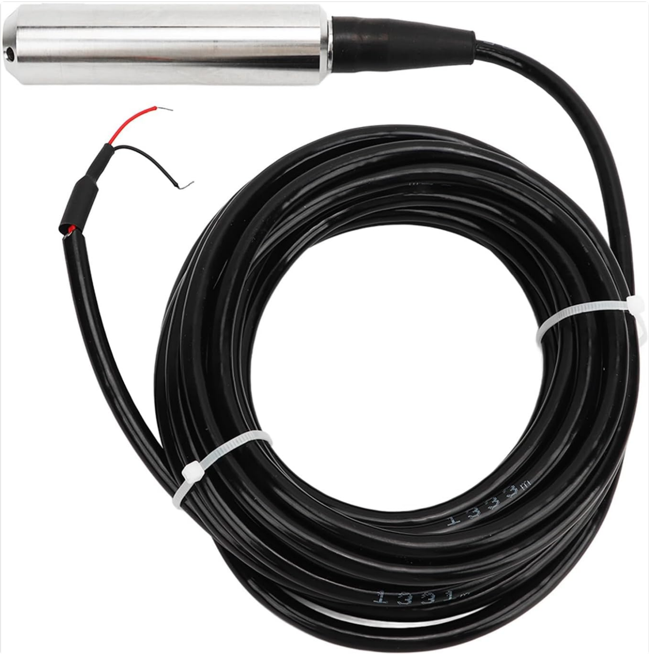
Image 1.1: The Garosa Level Transmitter with its integrated cable, designed for precise liquid level measurement.