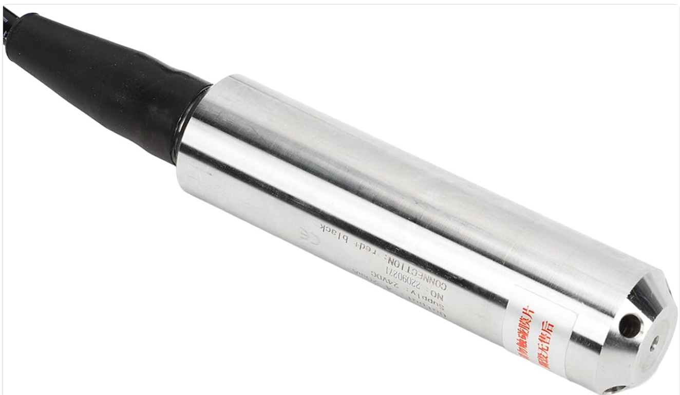
Image 2.1: A close-up view of the transmitter body, highlighting its durable stainless steel construction and product labeling.