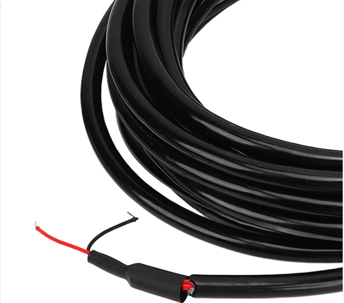
Image 3.1: The bare wire ends of the transmitter cable, indicating the red (positive) and black (negative) connections for power and signal.

5. Power On: Once all connections are secure, apply 24VDC power to the transmitter.