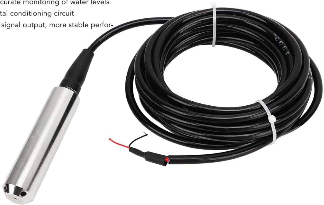
Image 4.1: Examples of typical applications for the level transmitter, including large water bodies and confined wells.

4-20mA signal output, more stable performance