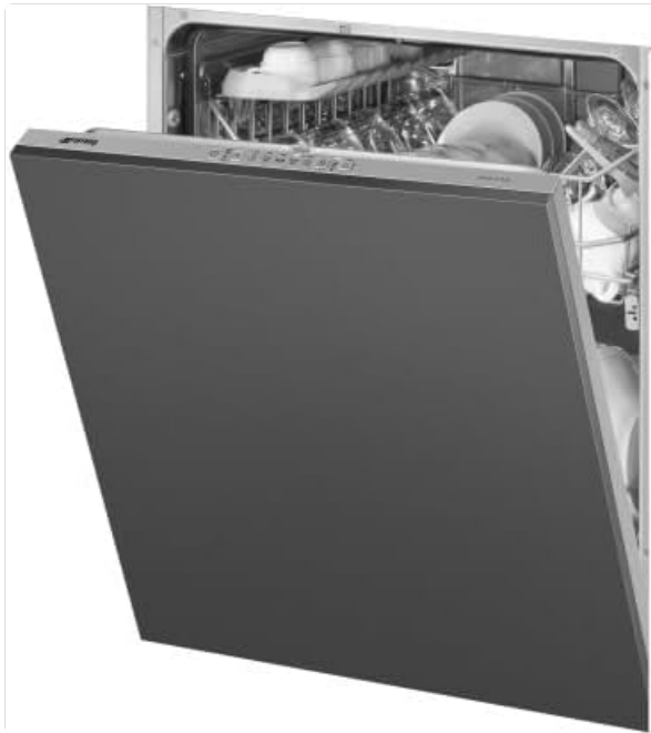
Figure 1: Side view of the dishwasher, illustrating its integrated design and potential connection areas.