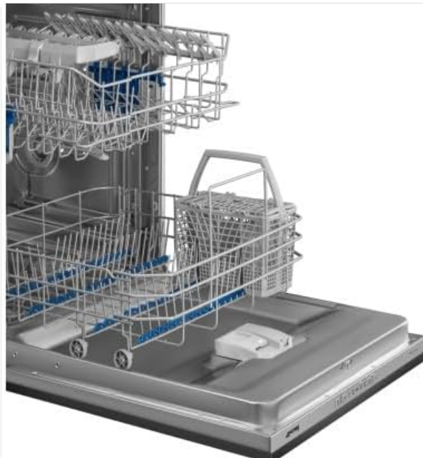
Figure 5: Detailed view of the baskets and cutlery holder, important for regular cleaning.

Wipe down the interior and door seal regularly with a damp cloth. The dishwasher features a natural condensation drying system with Dry Assist+ (automatic door opening at the end of the cycle) and plastic steam protection to minimize moisture buildup.