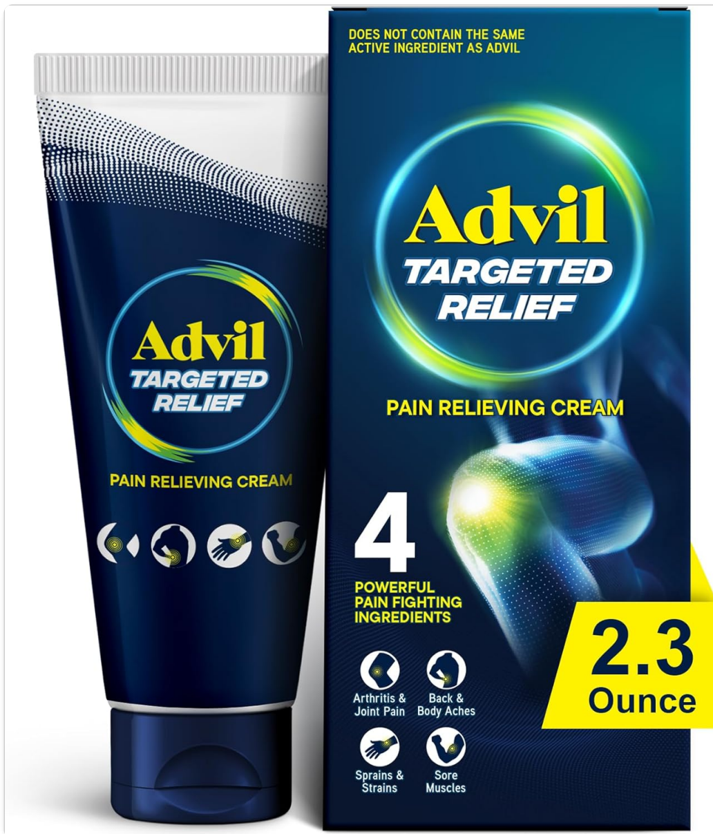
Image: Advil Targeted Relief Pain Relieving Cream tube and packaging.