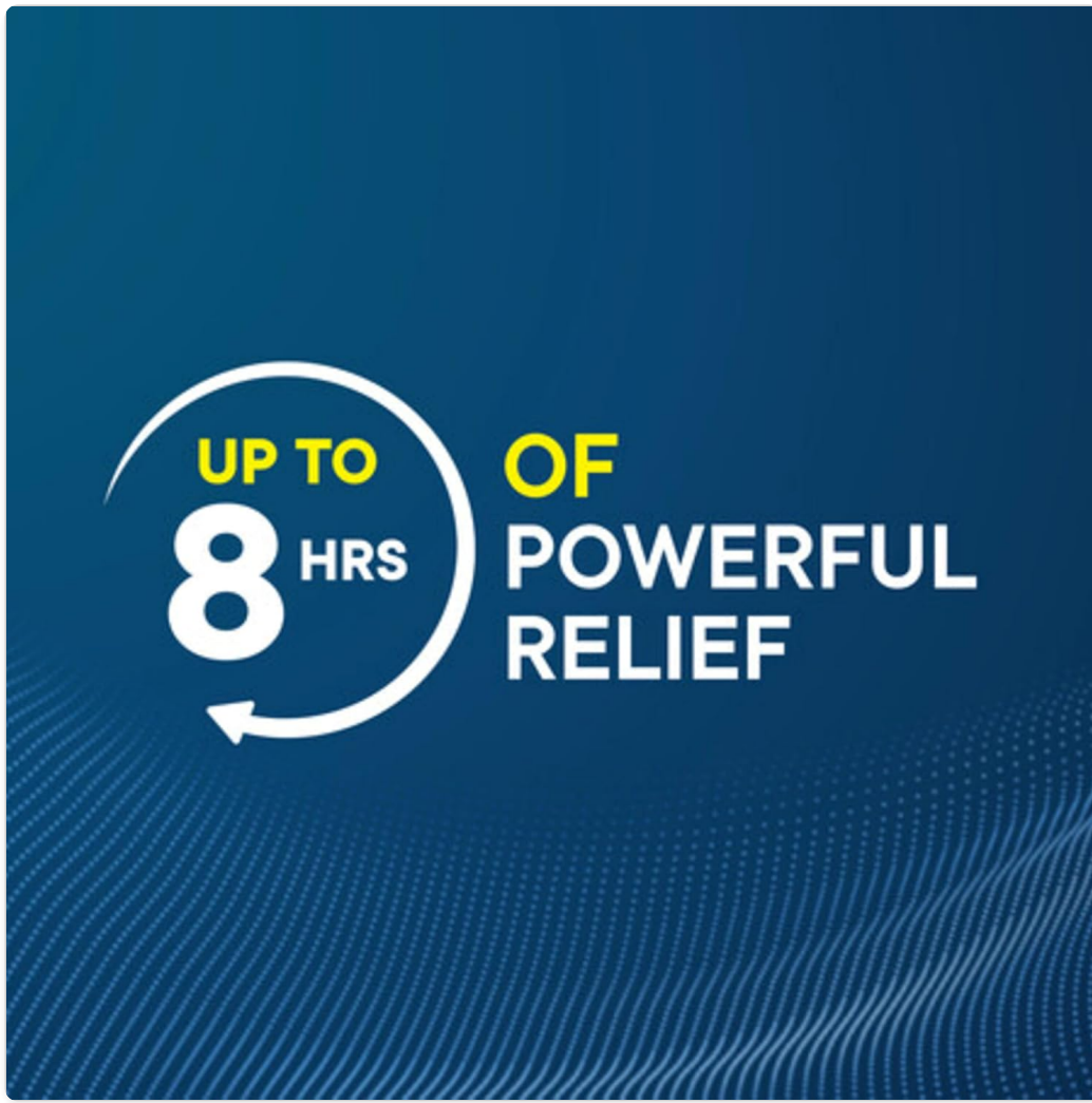
Image: Graphic highlighting up to 8 hours of powerful pain relief.