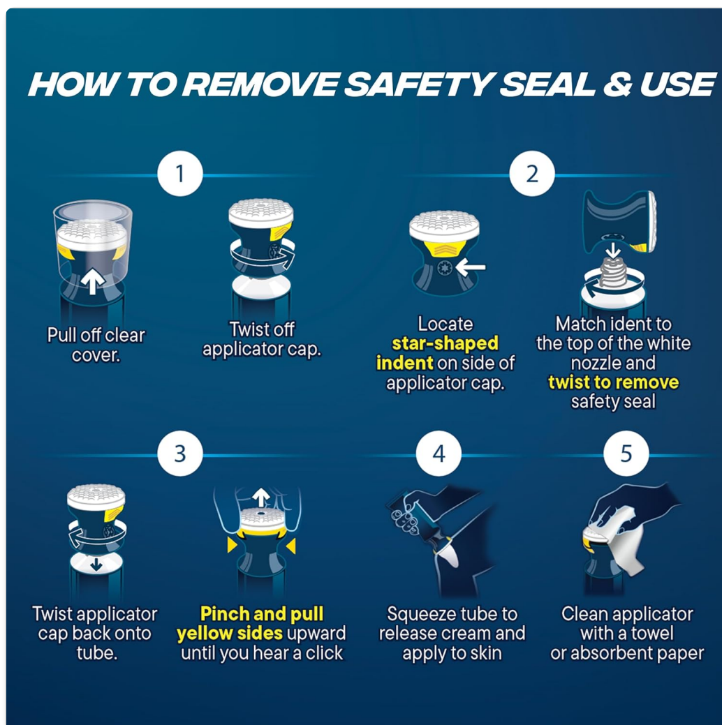
Image: Step-by-step guide on how to remove the safety seal and apply the cream.