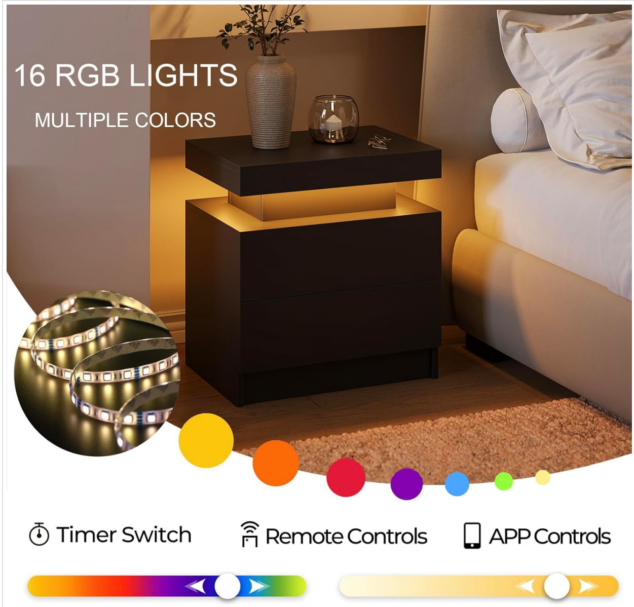
Image: The LED nightstand showcasing its multi-color capabilities, with the remote control and app control icons indicating various customization options.