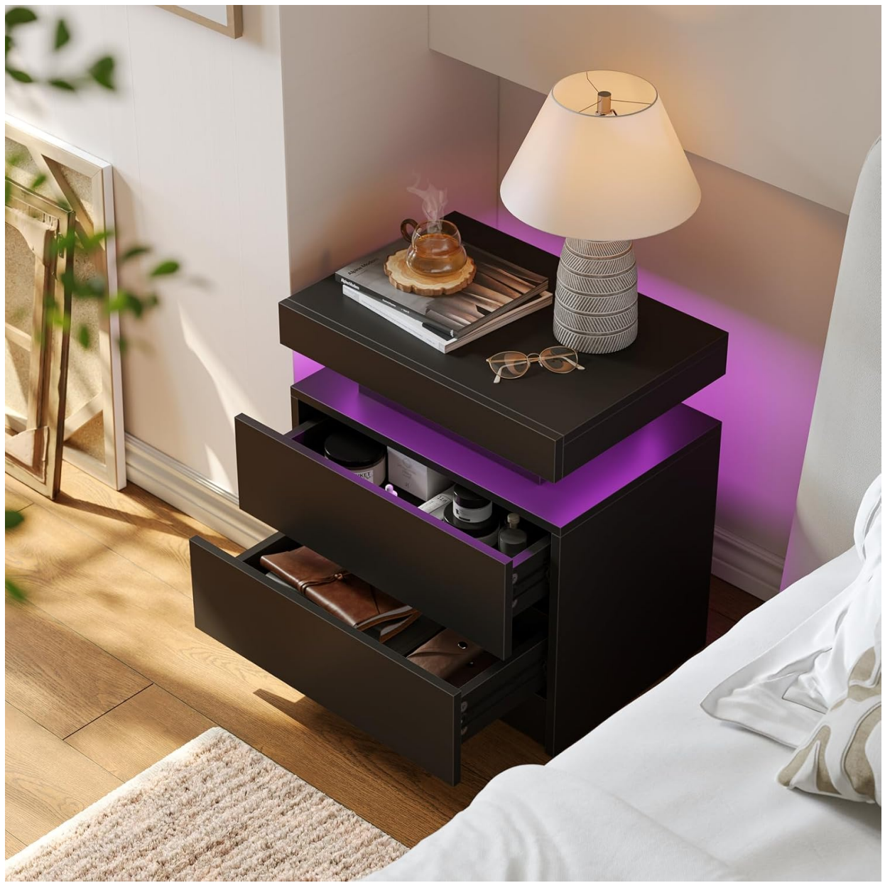
Image: A top-down view of the nightstand with its two drawers fully extended, demonstrating the generous storage capacity and the illuminated interior from the LED lights.