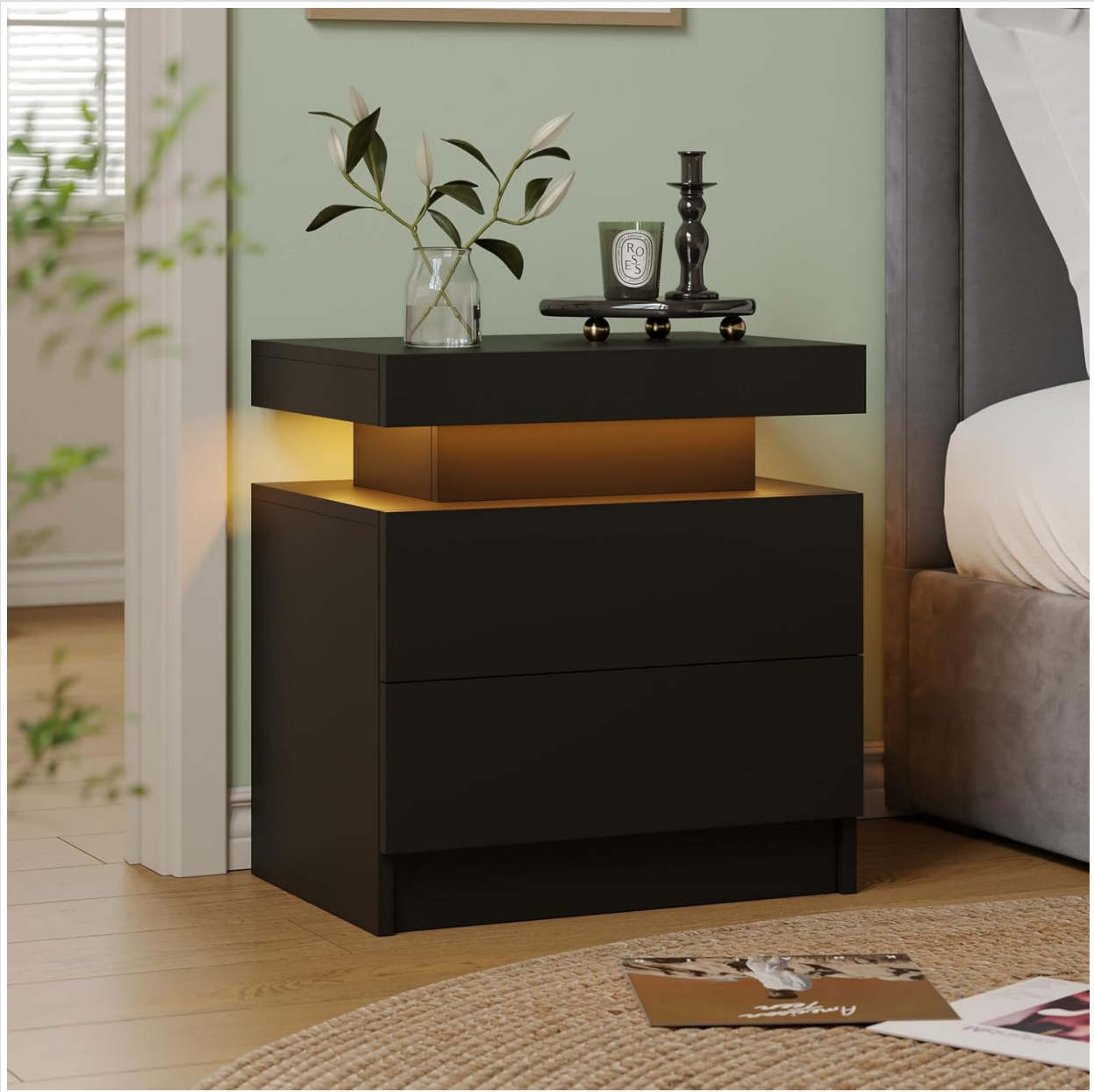
Image: The Modern 2-Drawer Nightstand in Deep Black, showcasing its sleek design and integrated LED lighting, placed beside a bed.