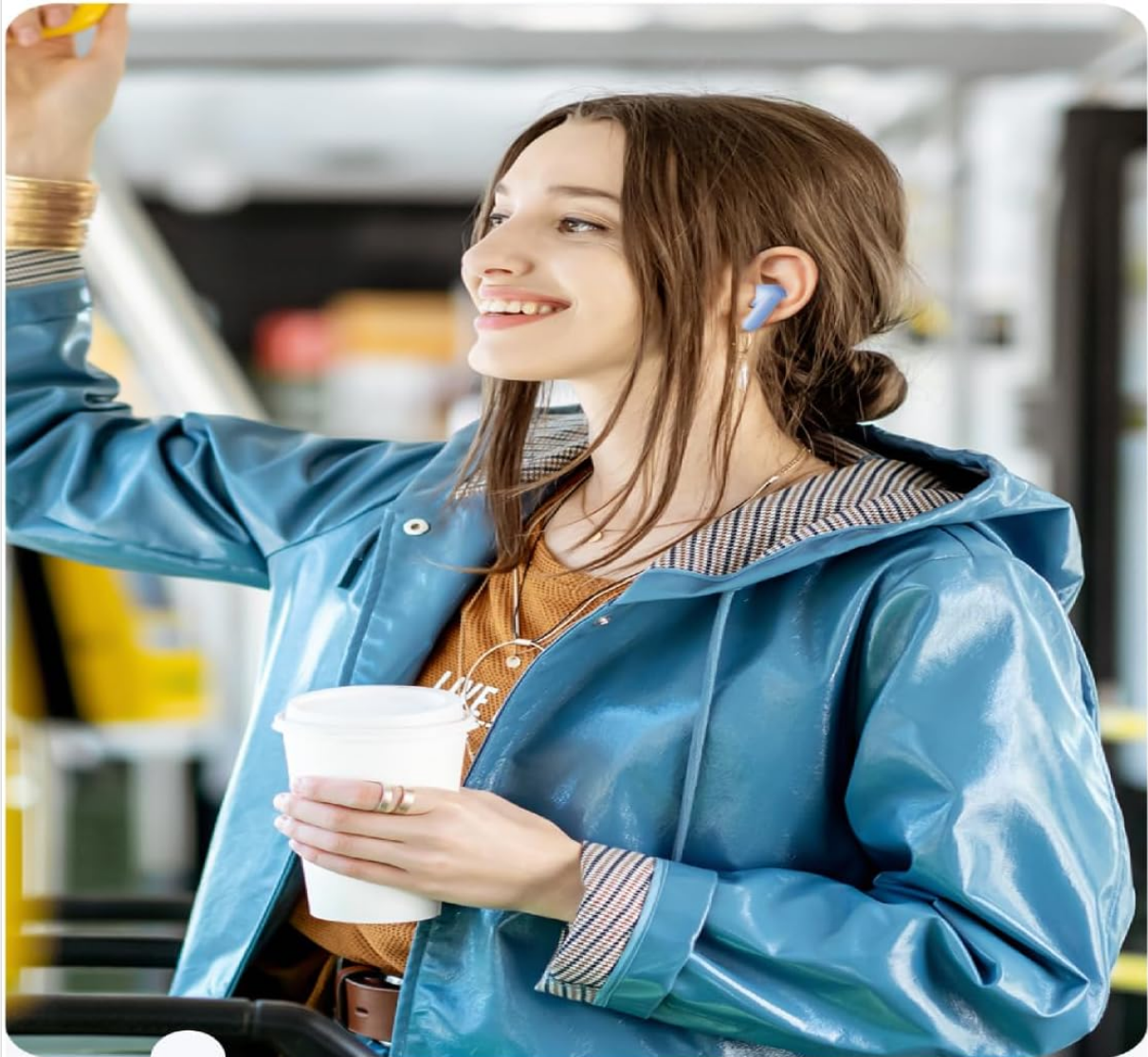
Image 3.3: A user making a call in a public setting, highlighting the effectiveness of ENC for clear voice communication.

Pick up voice and reduce ambient noise accurately through new ENC algorithm