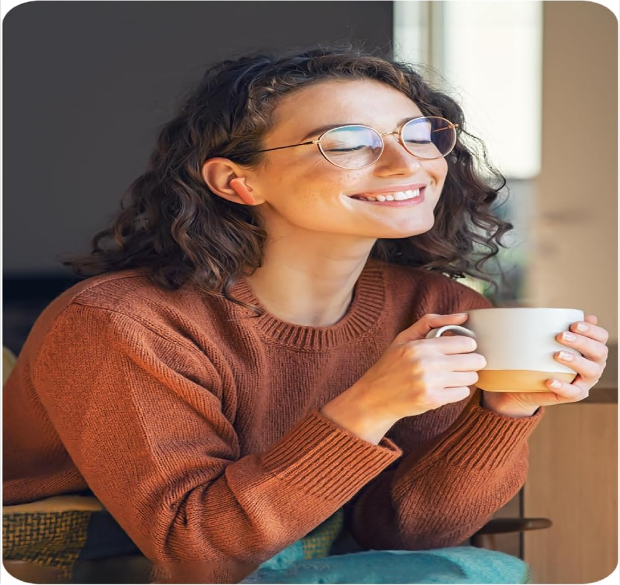
Image 3.1: A user enjoying music with the AWEI T85 earbuds, illustrating the immersive sound experience.

More clear treble, fuller middle, and deeper bass with rich music details restore immersive live experiences