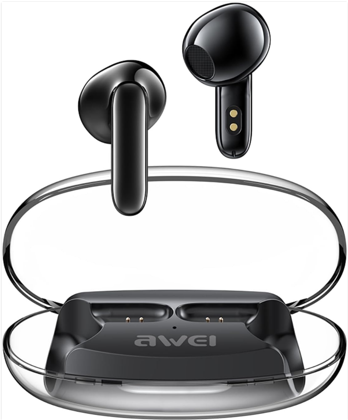
Image 1.1: AWEI T85 Wireless Earbuds shown with their transparent charging case.