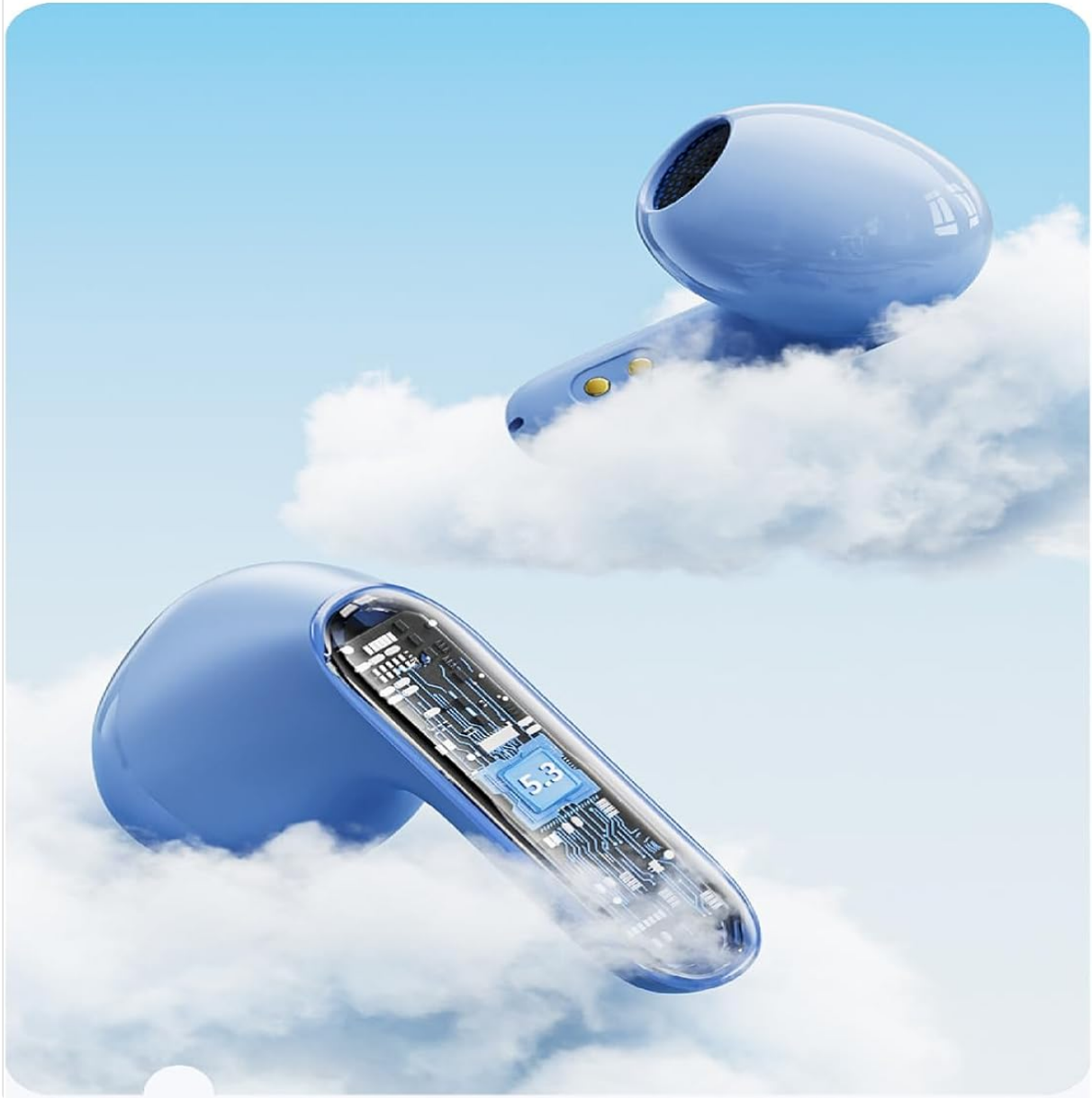
Image 2.1: Illustration of AWEI T85 earbuds highlighting Bluetooth 5.3 connectivity.

Anti-electromagnetic interference, no jam or disconnection, high-speed transmission, low power consumption