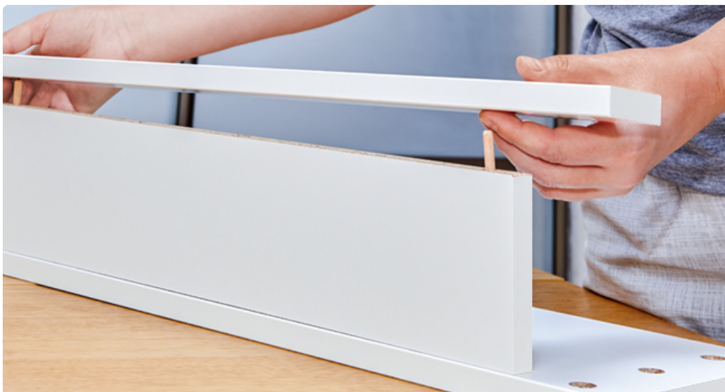
Image: A close-up of hands assembling a furniture panel, demonstrating the use of wooden dowels for alignment during construction.