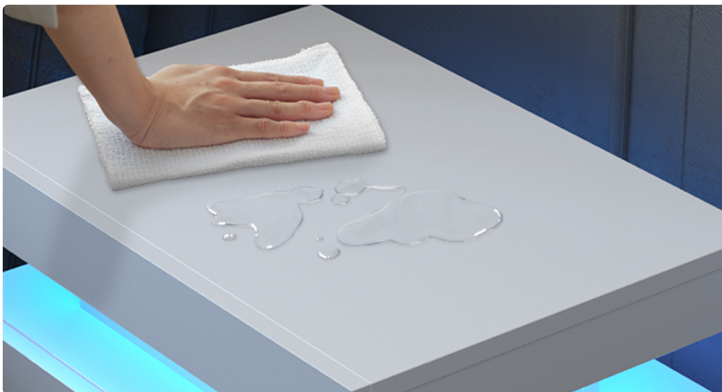
Image: A hand demonstrating the ease of cleaning the nightstand's waterproof surface by wiping away spilled water.