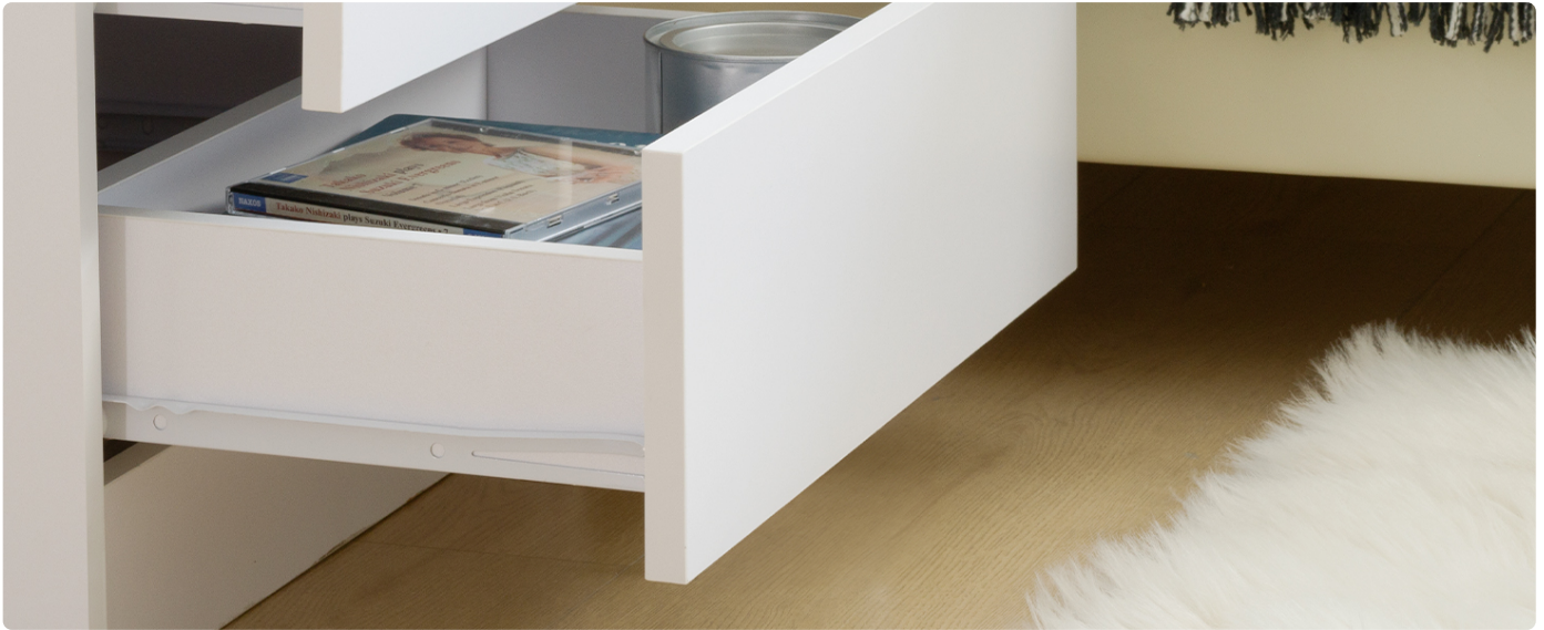
Image: A detailed view of the nightstand's drawer, demonstrating its smooth operation and capacity for storing items.