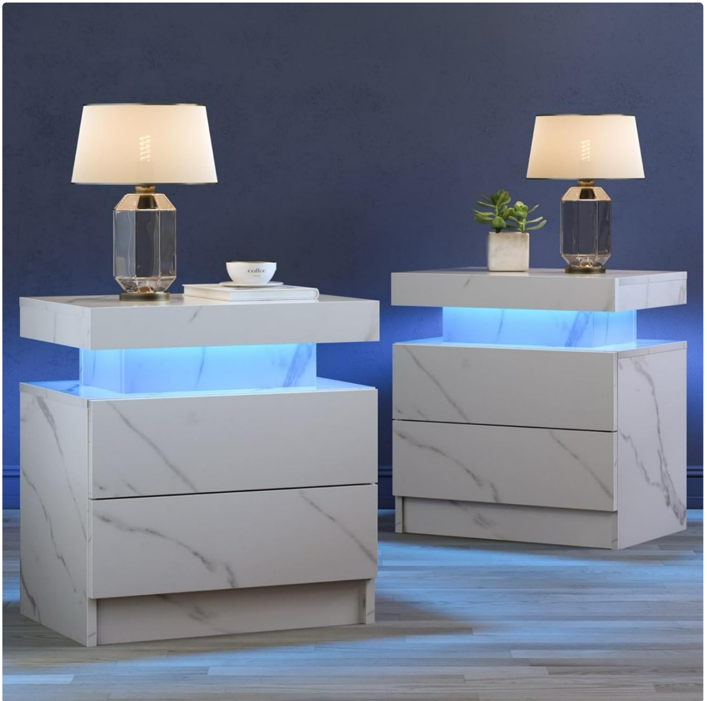
Image: A pair of Cubehom LED Nightstands, showcasing their modern design and integrated blue LED lighting, positioned beside a bed.