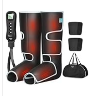
Figure 1: Overview of ALLJOY Leg Massager features.

The ALLJOY Leg Massager combines air compression, heat, and vibration functions to provide a comprehensive massage experience. Key features include: