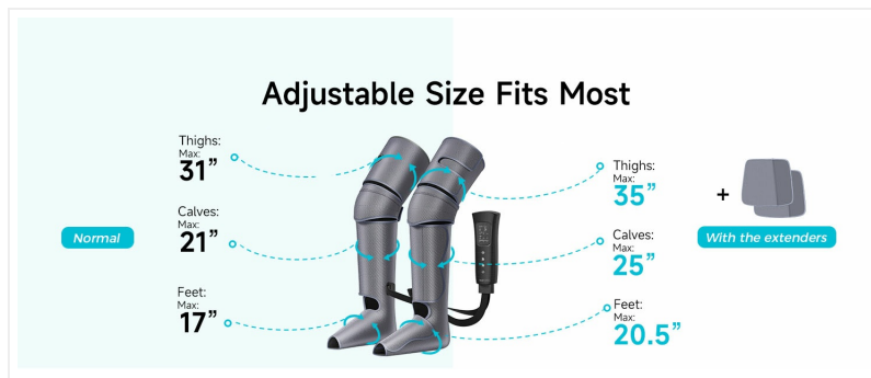
Figure 2: Adjustable sizing with and without extension wraps.