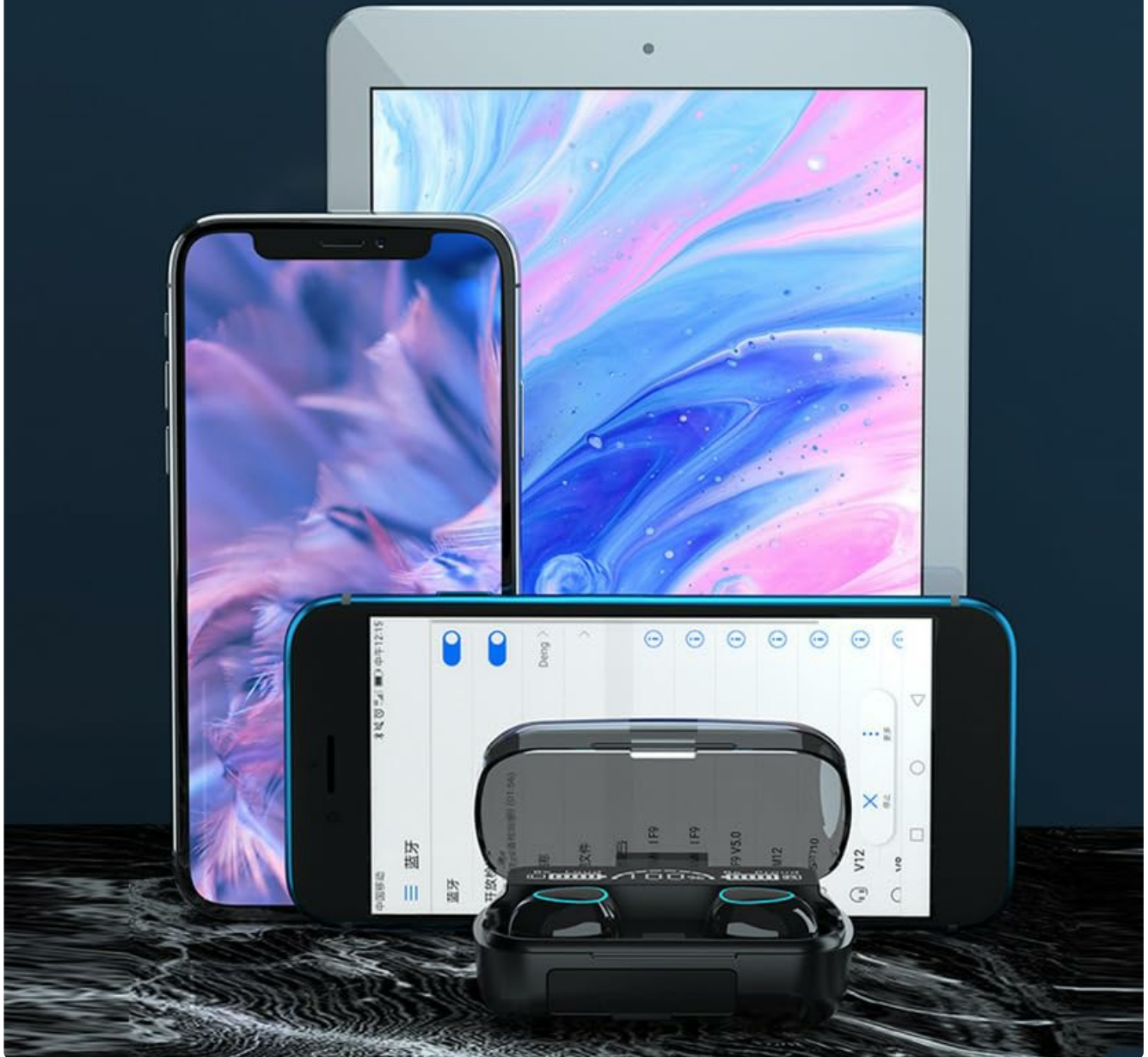
Image: The M10 earbuds and their charging case displayed alongside various mobile devices, including Android and iOS smartphones and a tablet, demonstrating broad compatibility.