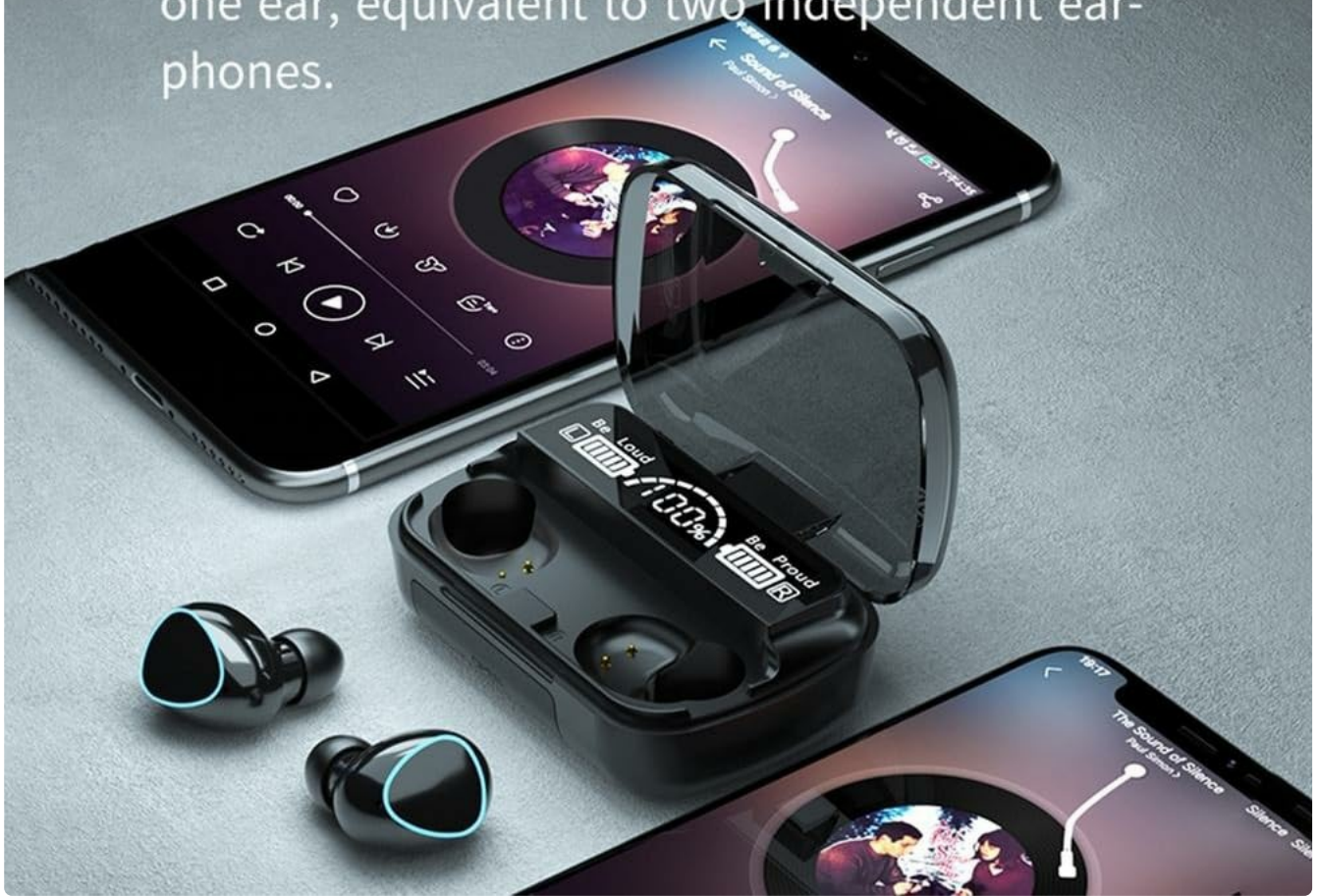
Image: Two smartphones are shown with the M10 earbuds and charging case, illustrating the capability for the earbuds to connect to multiple devices or be used as two independent earphones.

Two earphones can be connected to a mobile phone at the same time, sharing a music with friends and lovers, or can be connected with one ear, equivalent to two independent earphones.