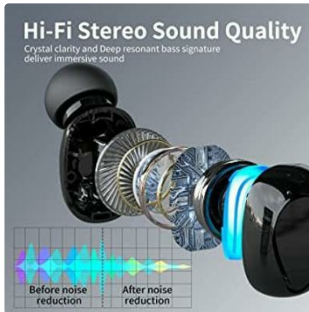
Image: An exploded view diagram of an earbud, showcasing its internal components. Below the diagram, a graph illustrates the effect of noise reduction technology, comparing sound levels before and after processing.