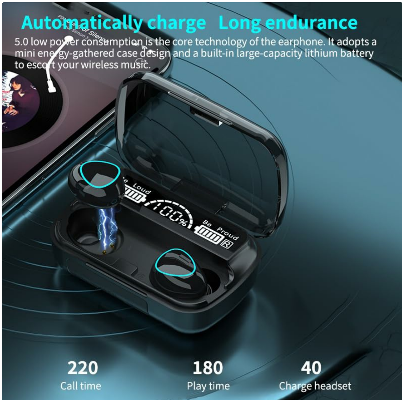
Image: Earbuds in their charging case, showing the digital display indicating battery levels and charging status. The display also shows estimated call and play times.

the USB charging cable to the charging port on the case and plug the other end into a compatible USB power source (e.g., wall adapter, computer USB port). The digital display on the case will indicate the charging status and battery level.