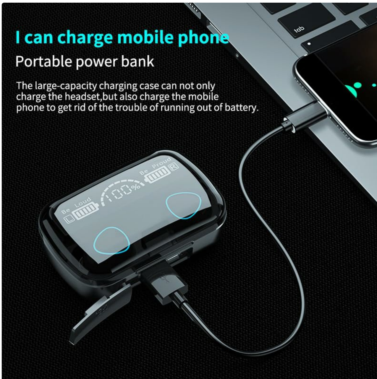
Image: The M10 earbud charging case connected via a USB cable to a smartphone, demonstrating its functionality as a portable power bank to charge external devices.

The large-capacity charging case can not only charge the headset, but also charge the mobile phone to get rid of the trouble of running out of battery.