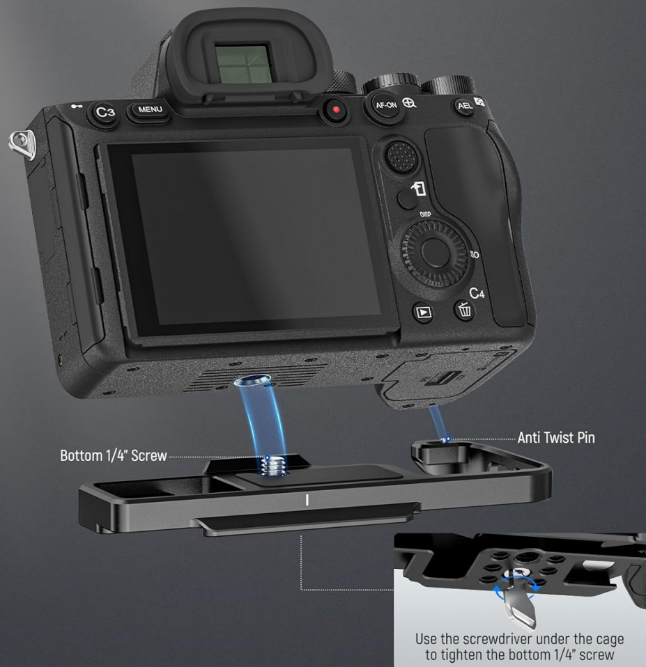
Figure 2: Easy installation of the baseplate to the camera, secured by a 1/4" screw and anti-twist pin.

Secured by the 1/4" screw and raised edge for great stability.