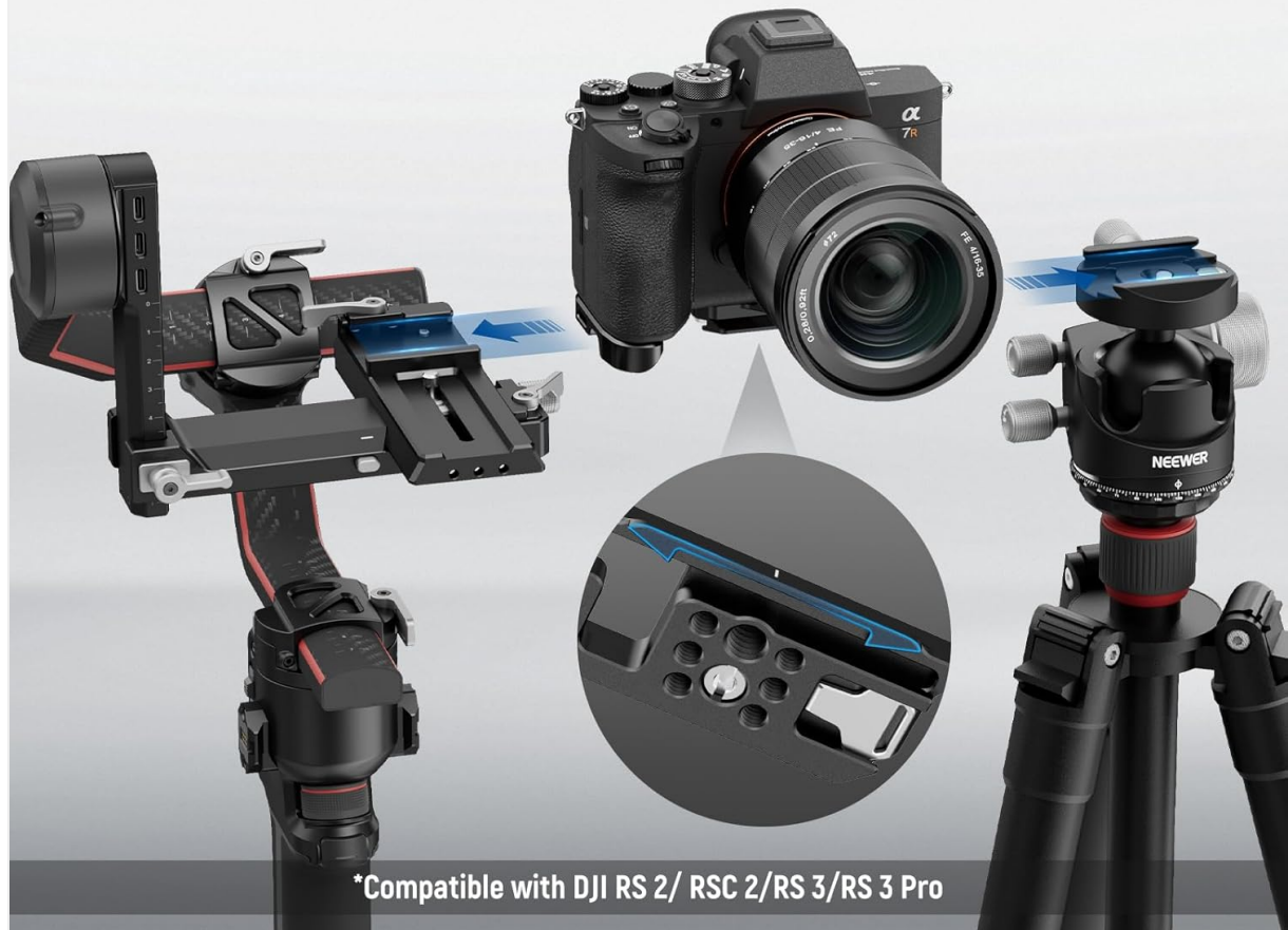
Figure 5: Seamless device switching using the Arca-type quick release plate.