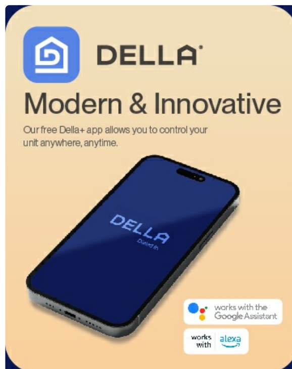
Figure 6.1: DELLA+ App for remote control and smart features.

Control your air conditioner from anywhere using the DELLA+ application on your iOS or Android smartphone. The app allows you to adjust all settings, set schedules, and utilize GEO Location features.