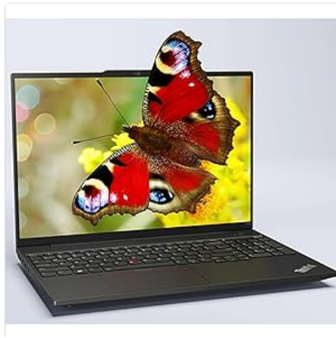
Figure 4: Display Quality Example