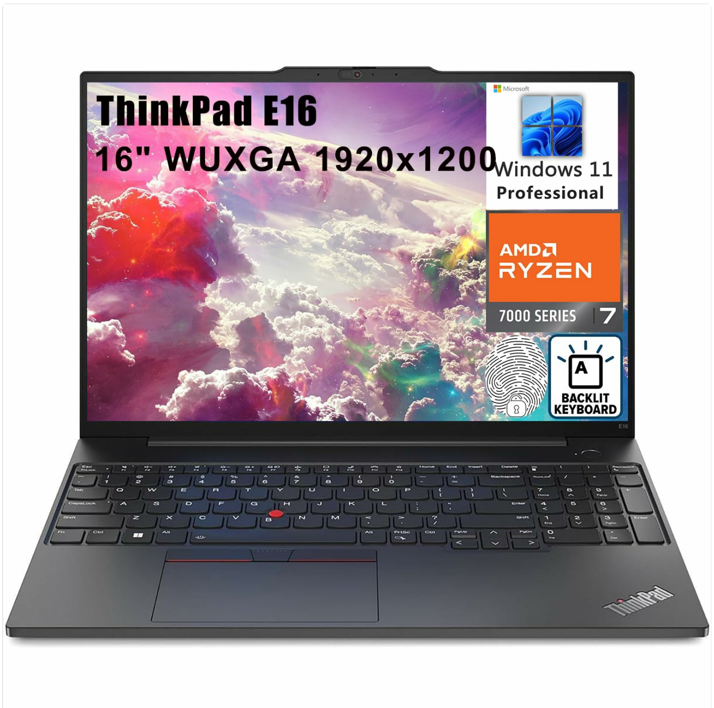
Figure 1: Lenovo ThinkPad E16 Laptop