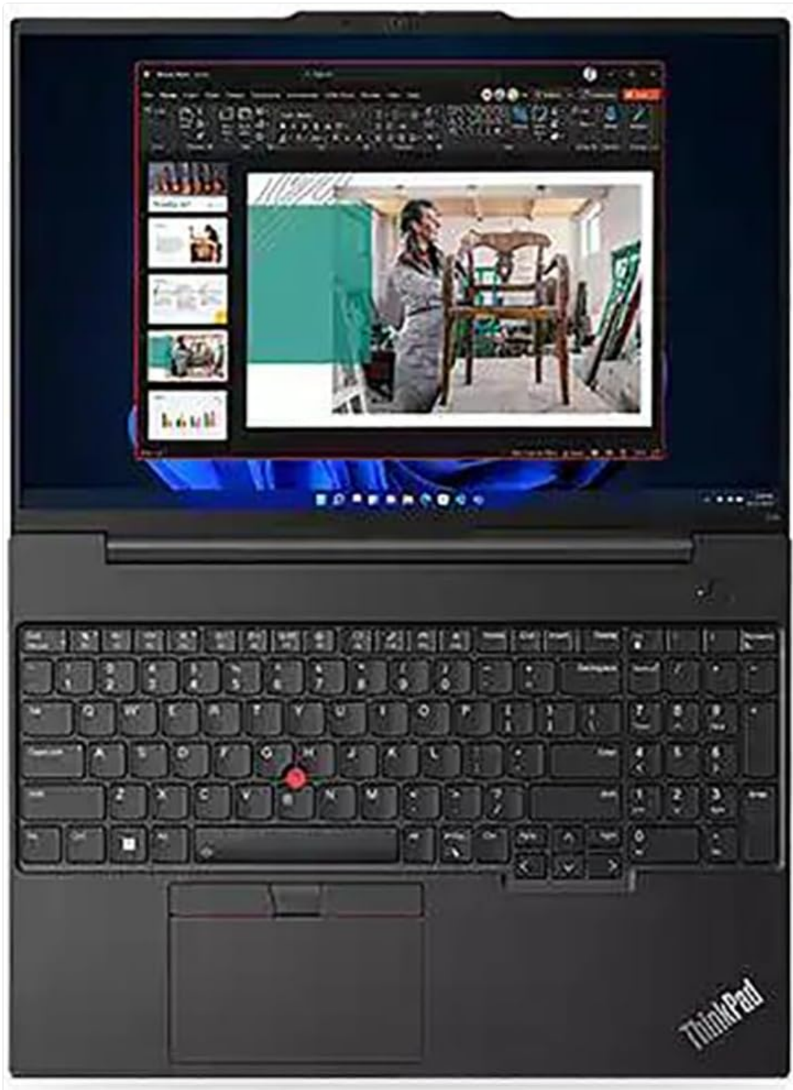
Figure 3: Keyboard and Touchpad Layout