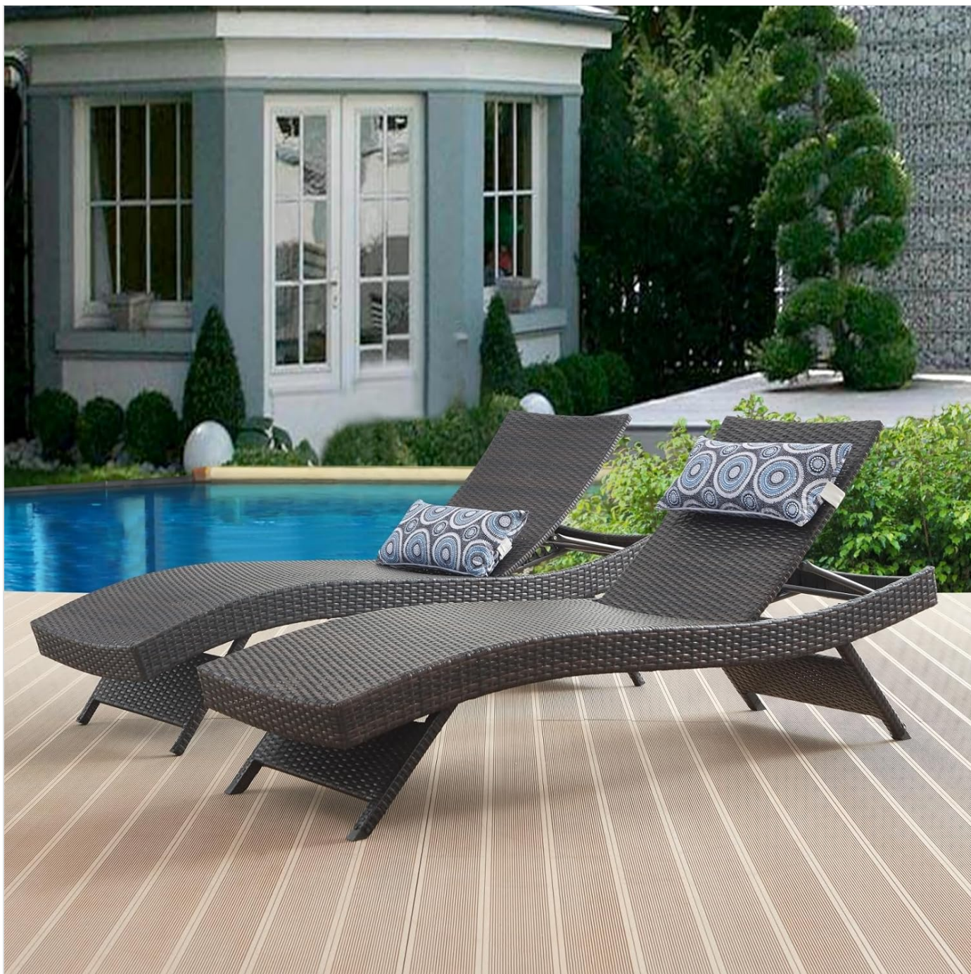
Figure 1: Summax Reclining Chaise Lounge Chair Set in a poolside setting.