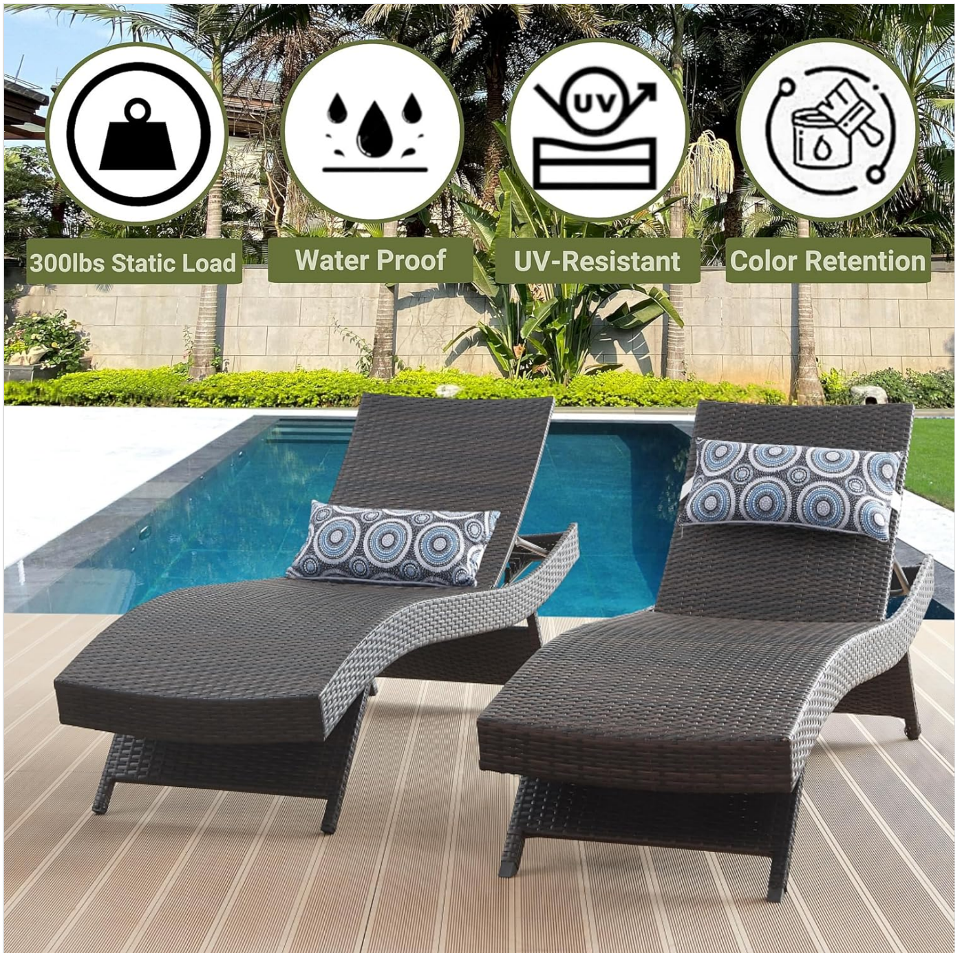
Figure 3: Durability features of the chaise lounge chairs.