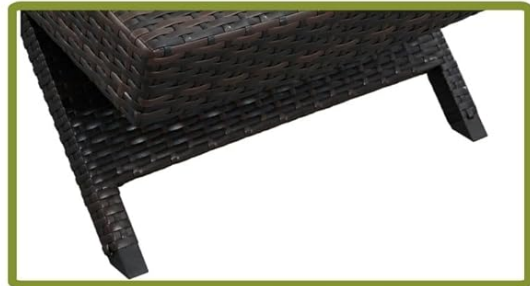
Non Slip Stable Legs