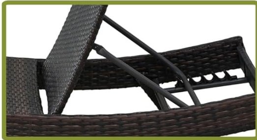
Sturdy Support Rob