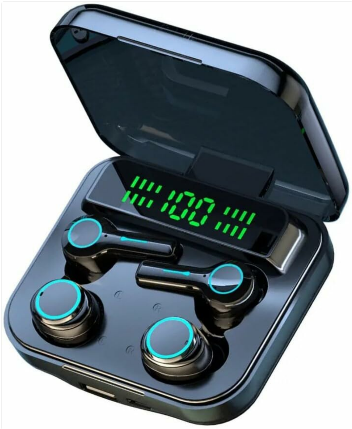
Image: Generic M21 Bluetooth Earbuds securely placed within their charging case, displaying their compact design and readiness for use.