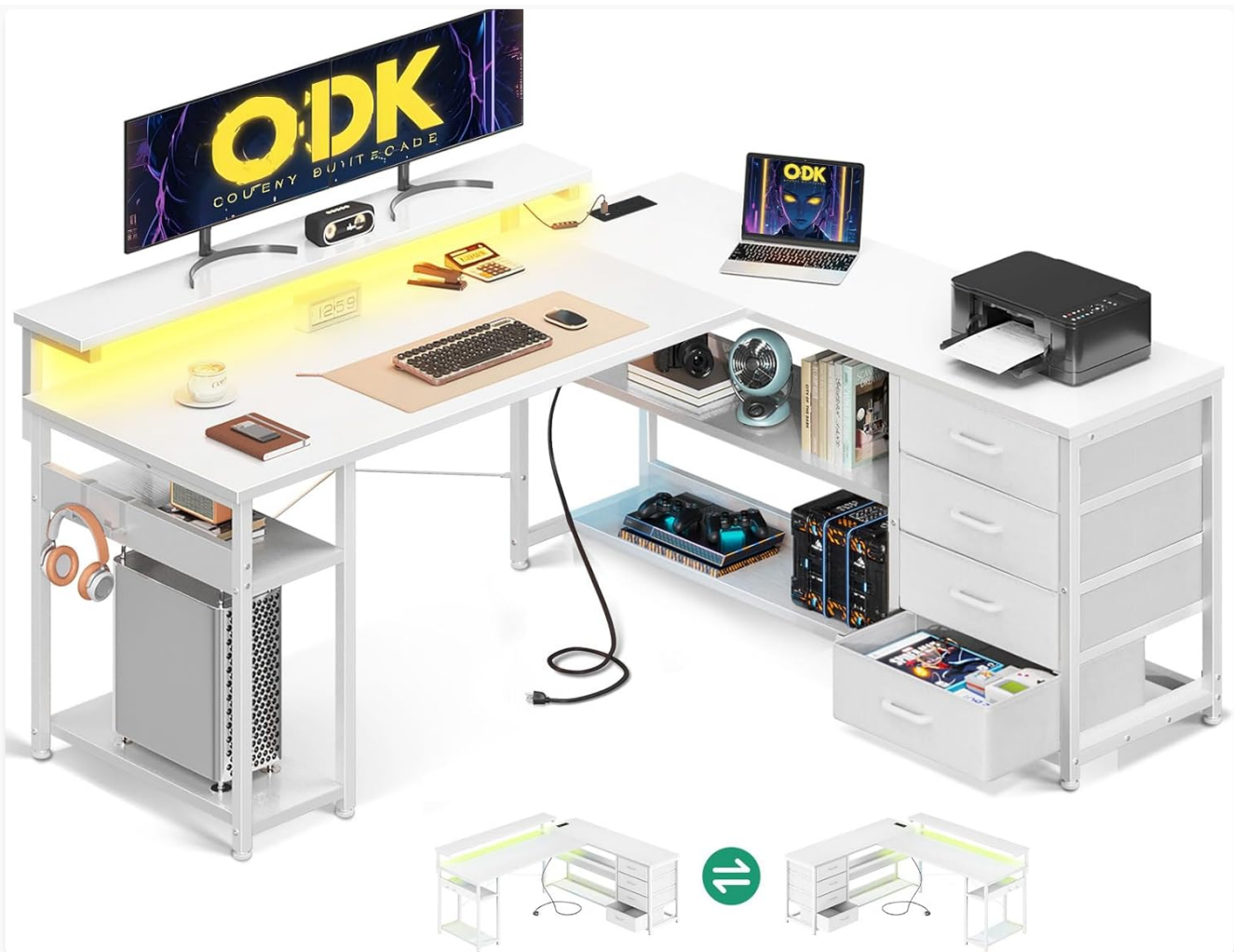
Figure 1.1: The ODK L-Shaped Desk, showcasing its monitor shelf, integrated power strip, and storage drawers.