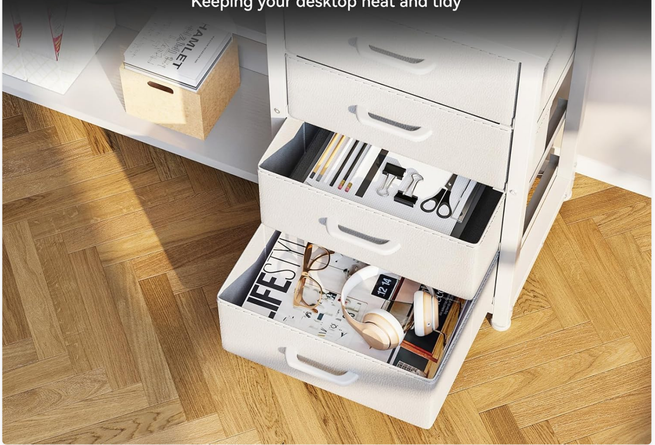
Figure 2.1: Detail of the four fabric storage drawers, designed to keep your desktop neat and tidy.