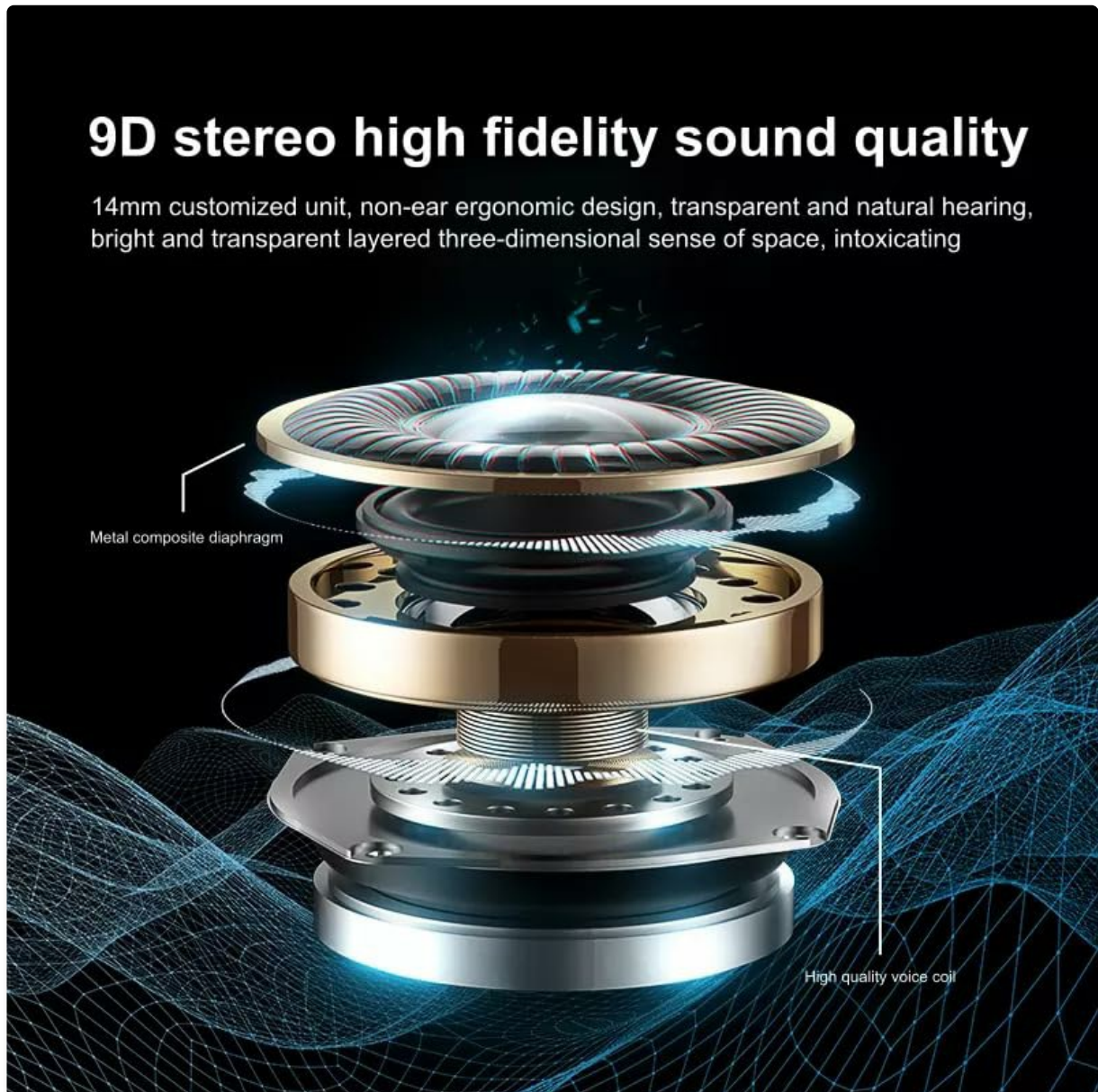
Figure 4.2: 9D Stereo High Fidelity Sound Quality. This diagram illustrates the internal components responsible for sound quality, including a 14mm customized unit, metal composite diaphragm, and high-quality voice coil, emphasizing transparent and natural hearing.

The earbuds feature 9D stereo high-fidelity sound quality, utilizing a 14mm customized unit and a metal composite diaphragm for rich, clear audio.