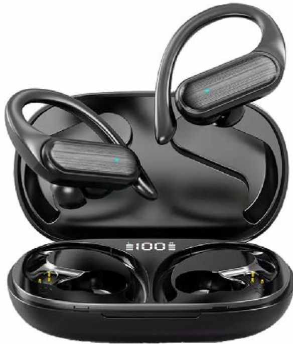
Figure 3.1: Mini Magnetic Suction Charging Bin. This image illustrates the charging capabilities, showing the earbuds in the case with a digital display indicating 100% charge, and text highlighting 150 hours extra music playing, 30 minutes fast charging time, and 40 full charges.