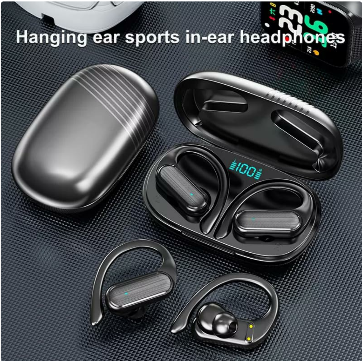
Figure 5.3: Hanging Ear Sports In-Ear Headphones. This image showcases the design of the earbuds with ear hooks, indicating their suitability for sports and active lifestyles.