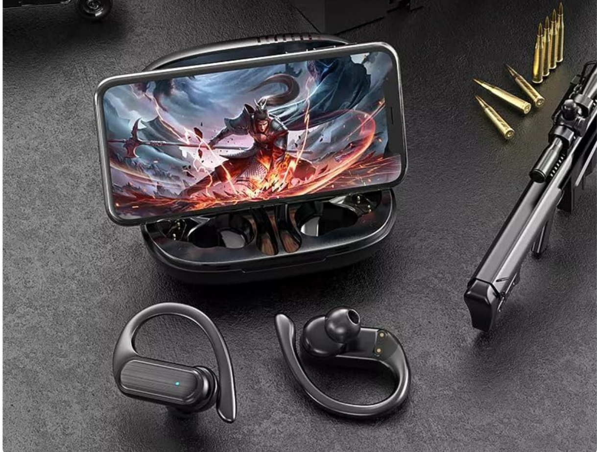
Figure 4.3: Dual-channel Low Latency for Mobile Gaming. This image shows the earbuds and case with a smartphone displaying a game, highlighting the low-latency experience for synchronized audio and video.

The low-latency experience is equipped with an intelligent new generation of BT 5.3 chip, which is synchronized with audio and video and is barrier-free for voice dialogue