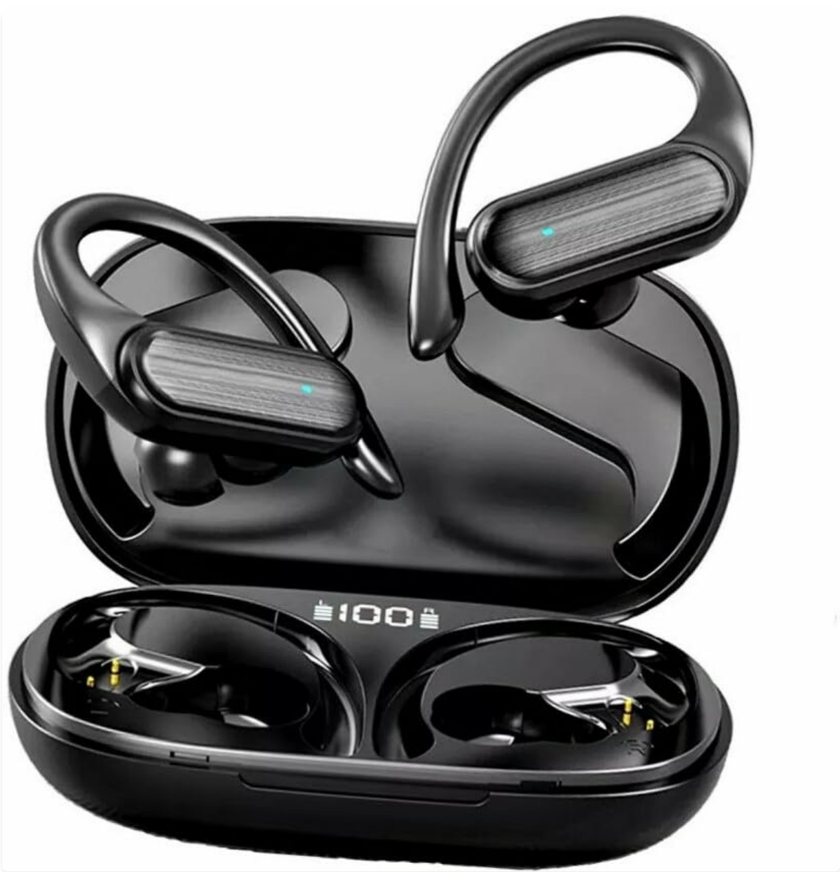
Figure 2.1: Buds A520 TWS Earbuds and Charging Case. The image shows the two earbuds resting in their open charging case, displaying their sleek black design and the digital battery indicator on the case.