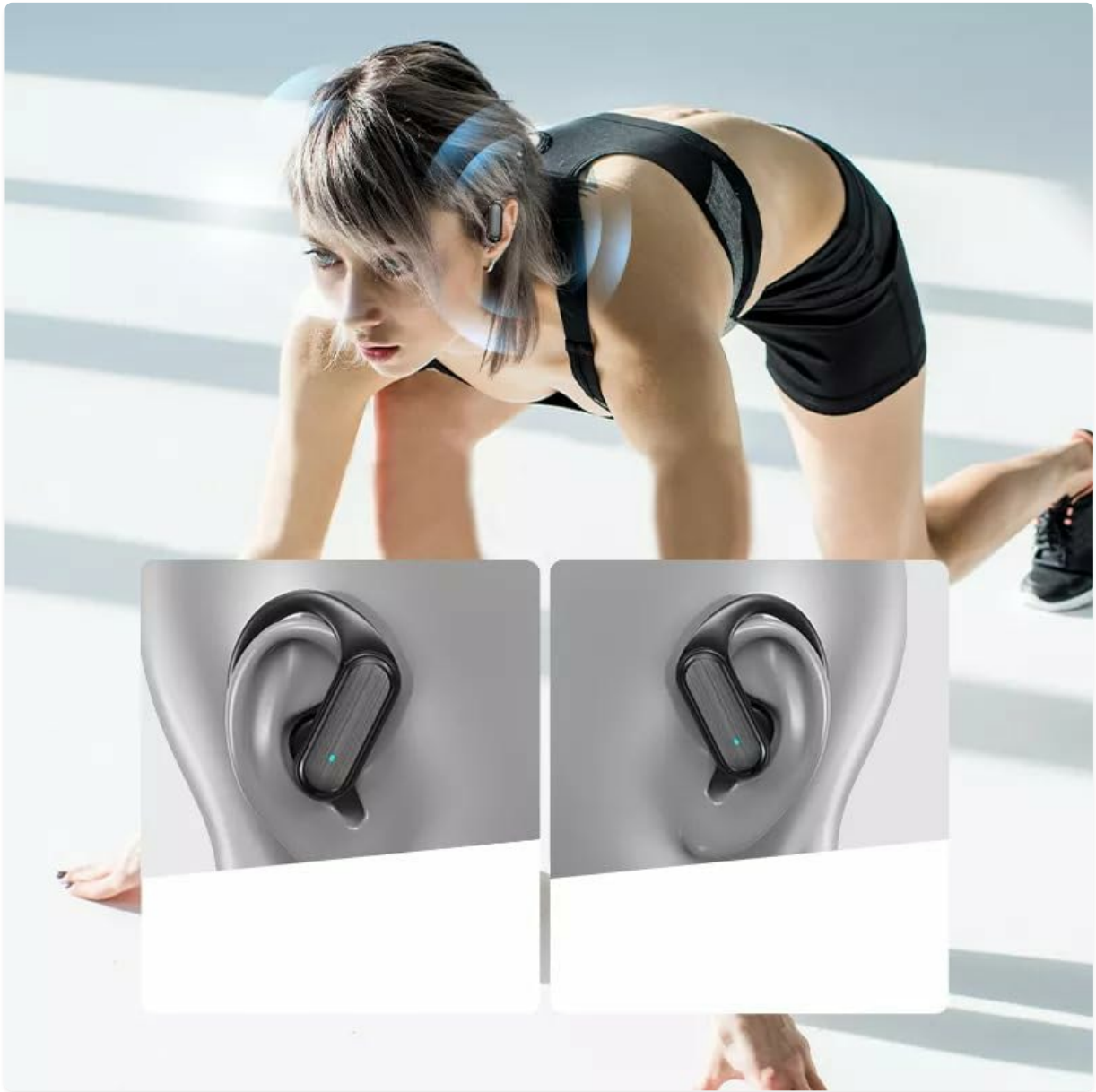
Figure 5.1: Secure and Comfortable Fit. This image shows the earbuds securely fitted on a person's ear during physical activity, demonstrating their stability and ergonomic design.