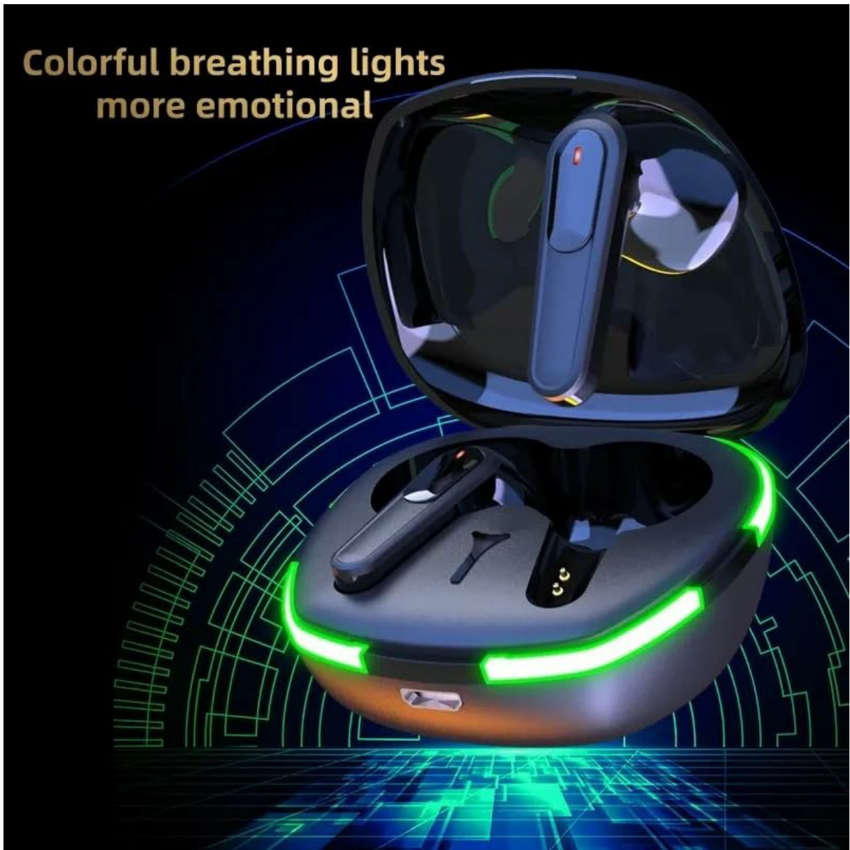
Image: The earbuds in their charging case, highlighting the colorful breathing LED lights that add to the aesthetic appeal and indicate status.

Colorful breathing lights more emotional