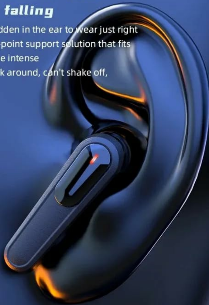
Image: A close-up of an earbud positioned in an ear, demonstrating its ergonomic design for a comfortable and secure fit, suitable for various activities.

Small body, hidden in the ear to wear just right With the three-point support solution that fits the cochlea, the intense Sports can walk around, can't shake off, face calmly