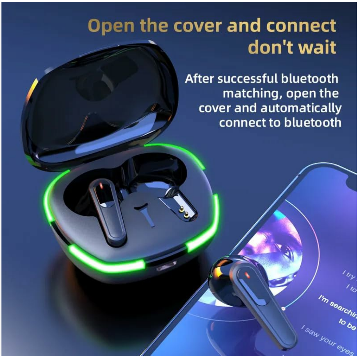
Image: The earbuds and charging case, illustrating the automatic connection feature when the case lid is opened. An earbud is shown near a smartphone displaying a music app.

After successful bluetooth matching, open the cover and automatically connect to bluetooth