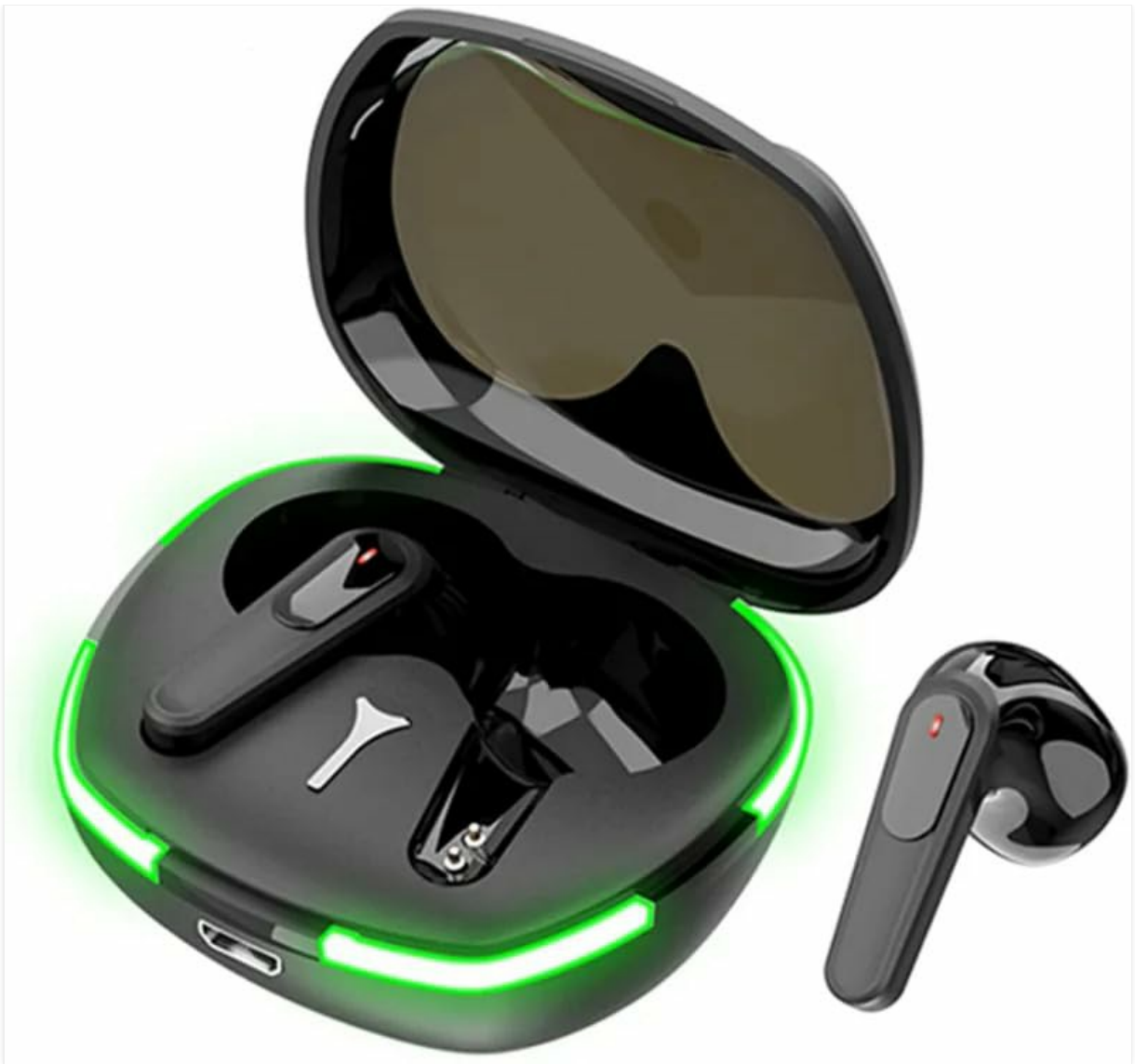
Image: The Pro 60 TWS Earbuds, showcasing their sleek design within the open charging case, illuminated by vibrant green LED lights. One earbud is shown outside the case.