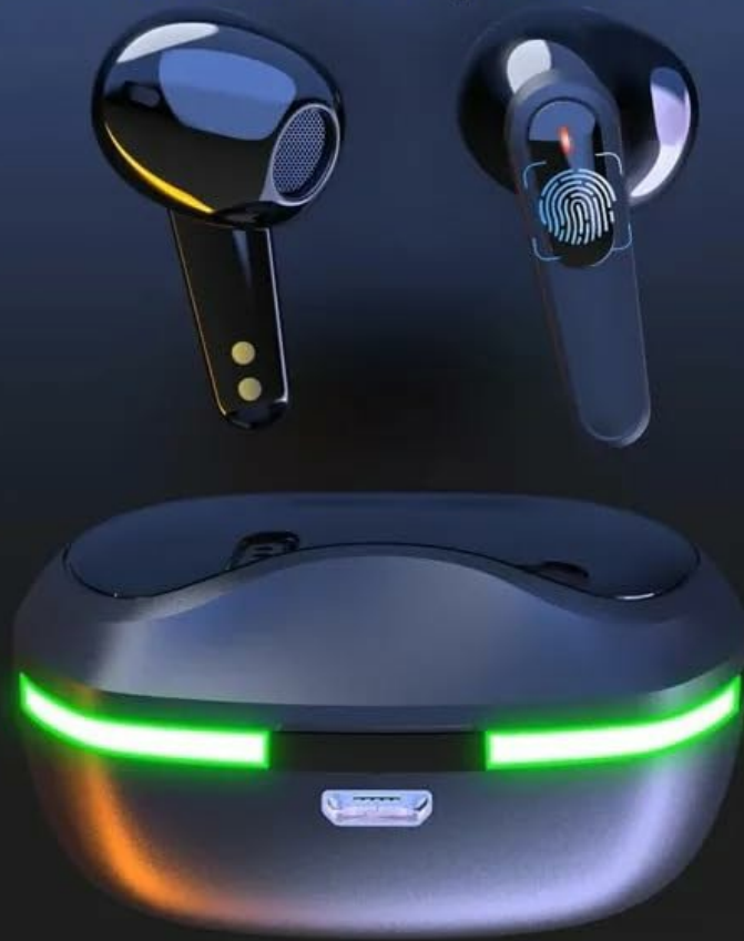
Image: The earbuds and charging case, illustrating the touch-sensitive control area on the earbuds for easy and intuitive operation without physical buttons.

Say goodbye to insensitivity, adopt touch design More convenient operation