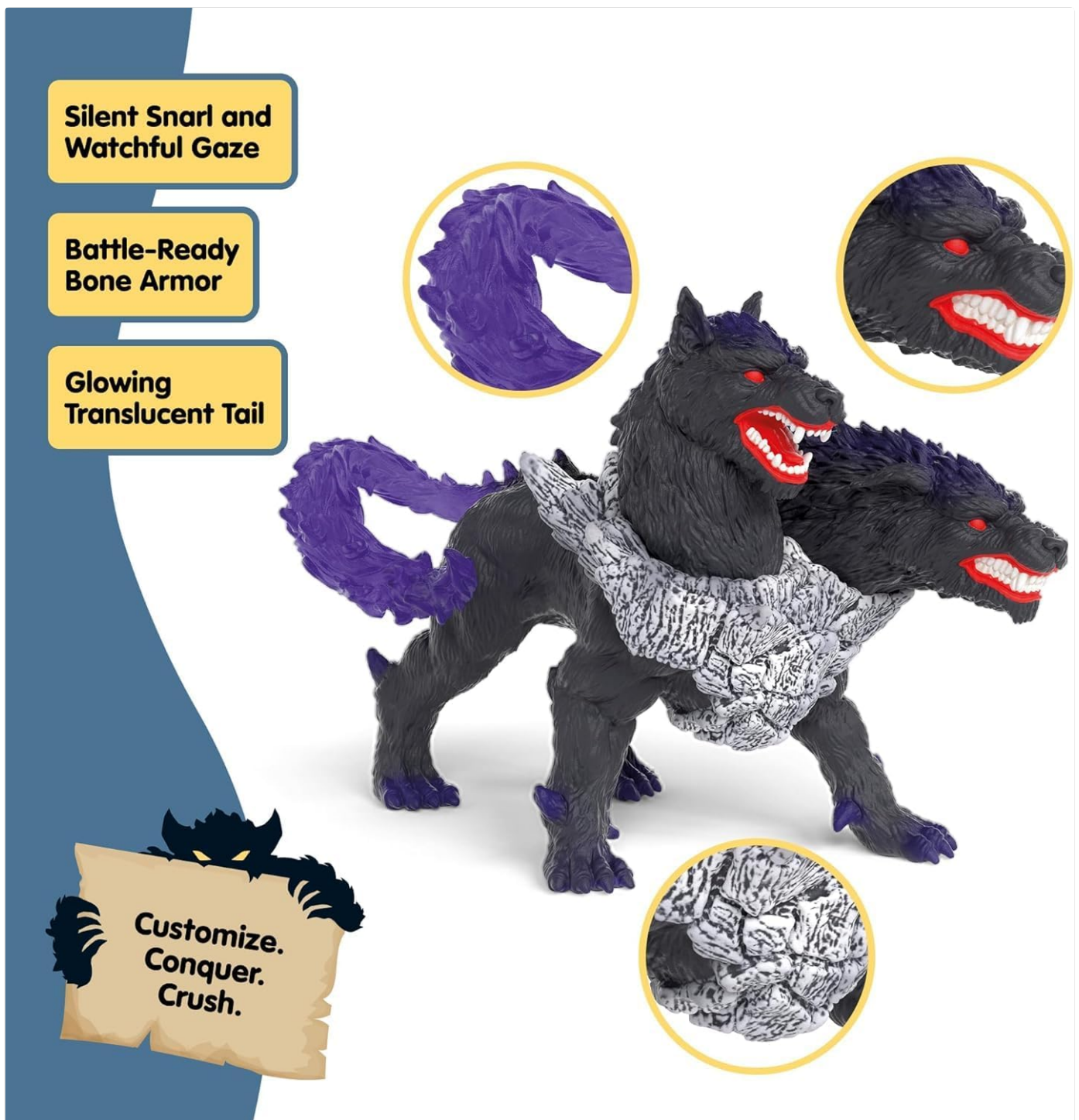
Figure 7: The Shadow Hound figure.