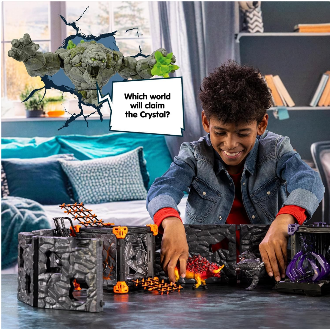
Figure 2: An example of the assembled BattleCave Arena in use.