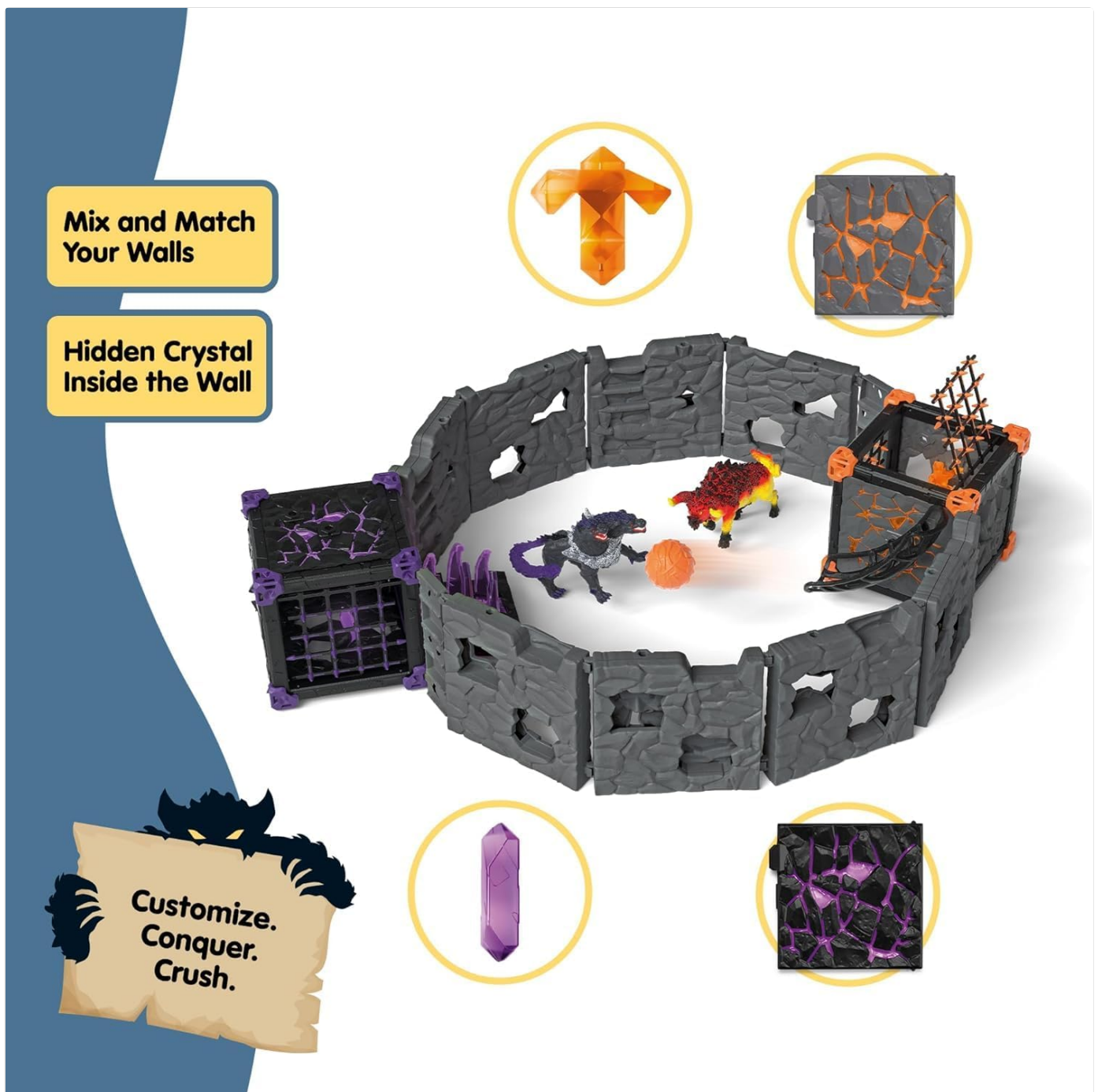
Figure 3: Customizable features of the BattleCave Arena.

Your browser does not support the video tag.