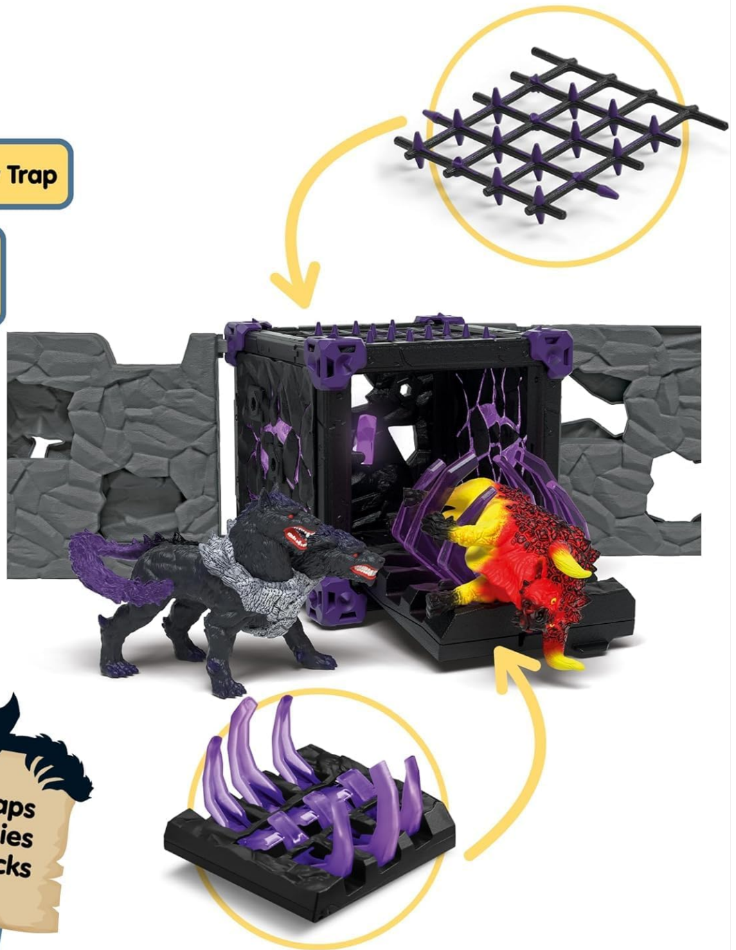
Figure 5: Detail of the Snapping Claw Trap.

Sneaky traps stop enemies in their tracks