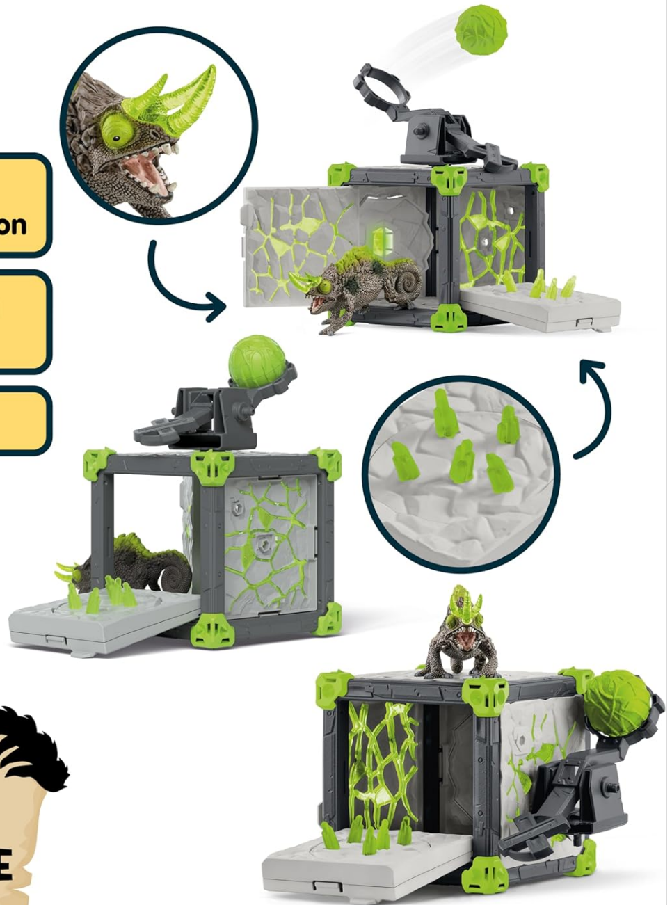
Image: Visual guide illustrating the assembly of the Stone Battle Cave, including the placement of the catapult, floor traps, and the chameleon figure.