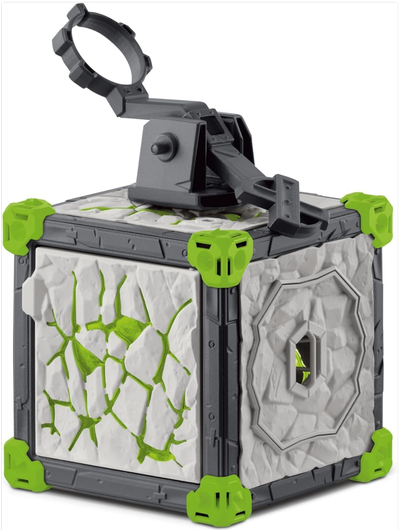
Image: A detailed view of the assembled Battle Cave, highlighting the catapult mechanism on top.