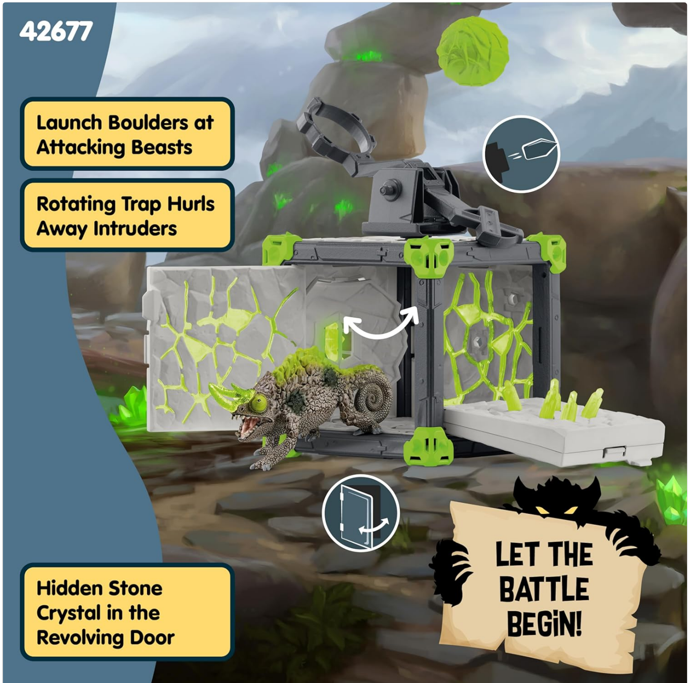
Image: A visual representation of the Battle Cave's interactive features, including boulder launching, rotating trap, and the hidden stone crystal in the revolving door.

The Stone Chameleon figurine is highly detailed and can be positioned in various action poses. Its massive watchful eyes and sharp claws make it a formidable defender of the cave.