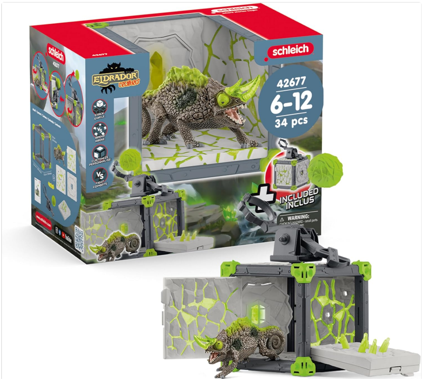
Image: The complete Schleich Eldrador Stone Battle Cave with Chameleon Playset, showing the main cave structure, the chameleon figure, and the catapult.