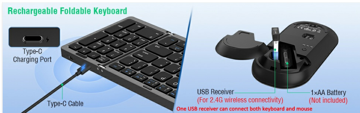
Image 4.1: Visual guide for connecting the Type-C charging cable to the keyboard and installing the AA battery in the mouse.