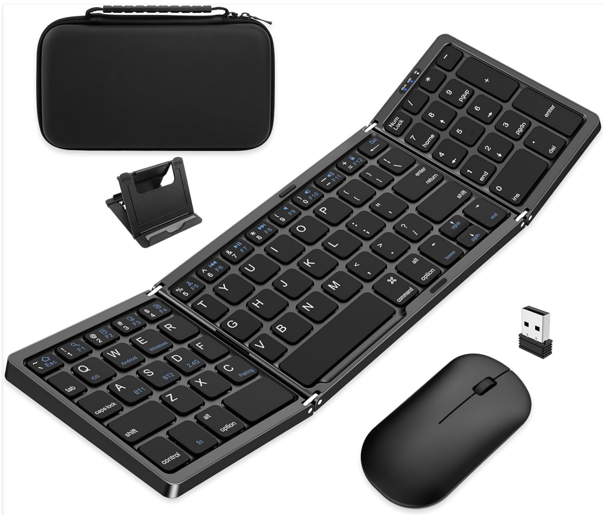
Image 1.1: The EDJO Folding Wireless Keyboard and Mouse Combo, showcasing its compact design and included accessories.