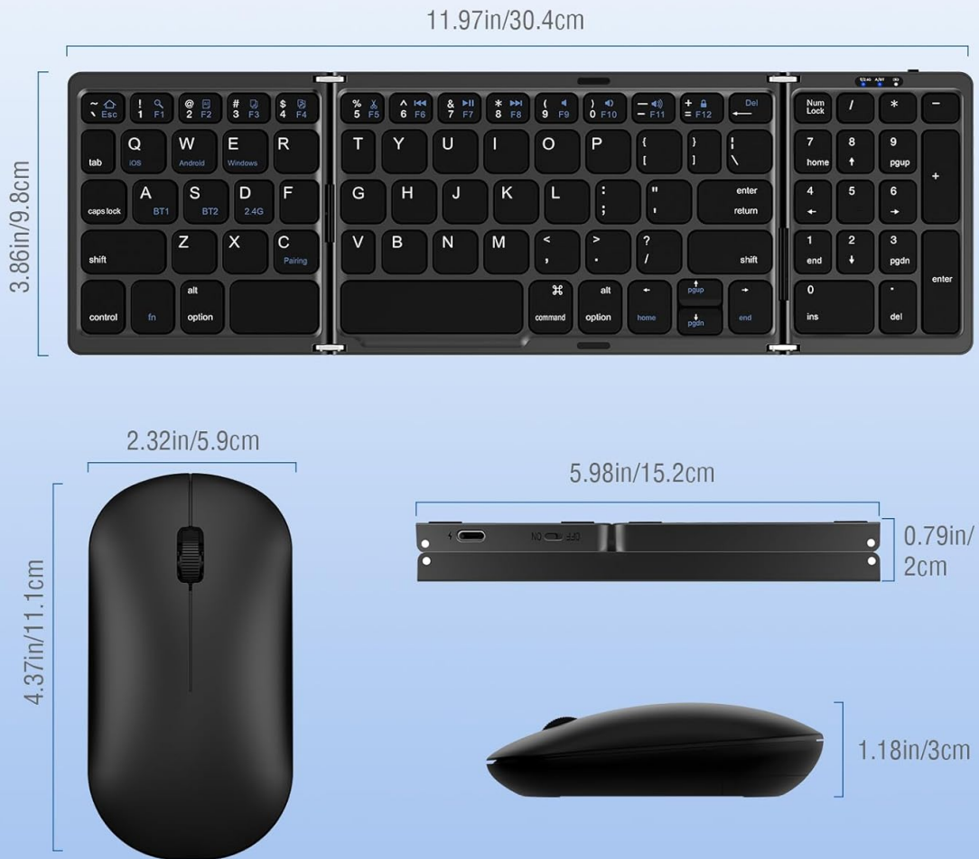
Image 6.1: Detailed dimensions of the EDJO Folding Wireless Keyboard and Mouse.