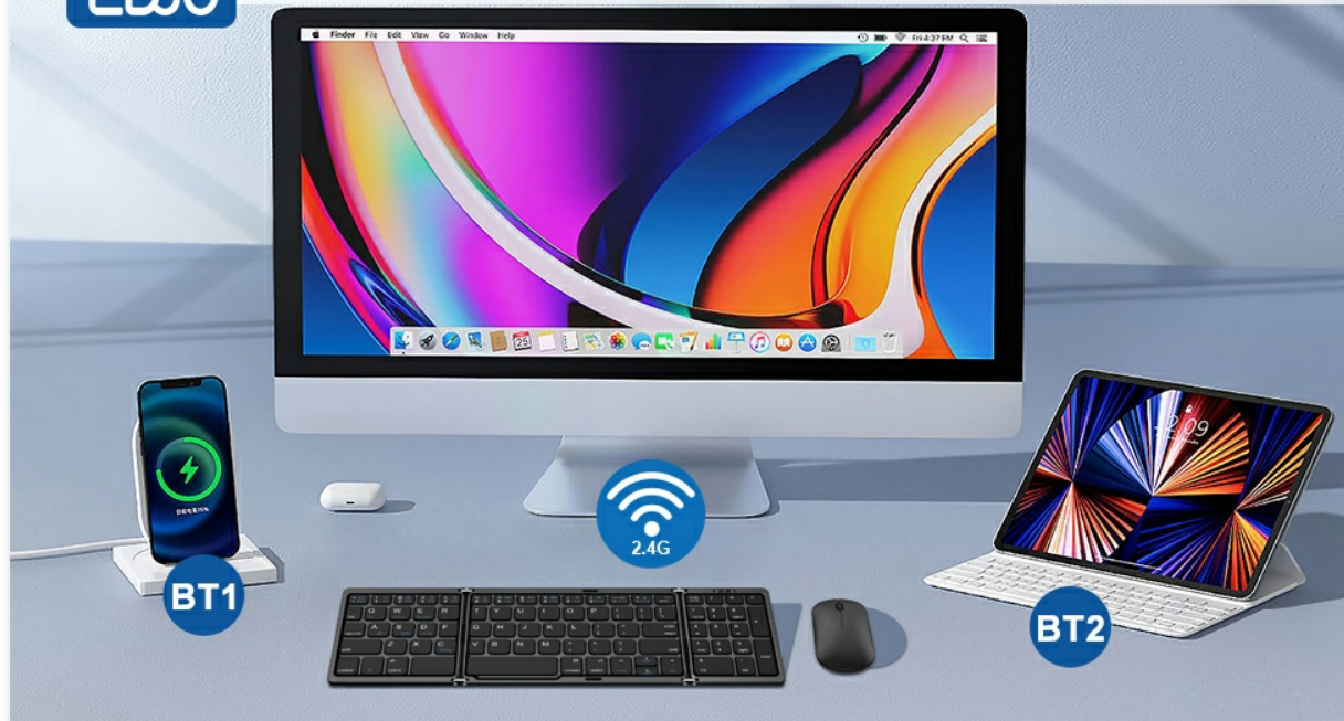
Image 4.3: Illustrated steps for establishing a Bluetooth connection with the keyboard and mouse to a mobile device.