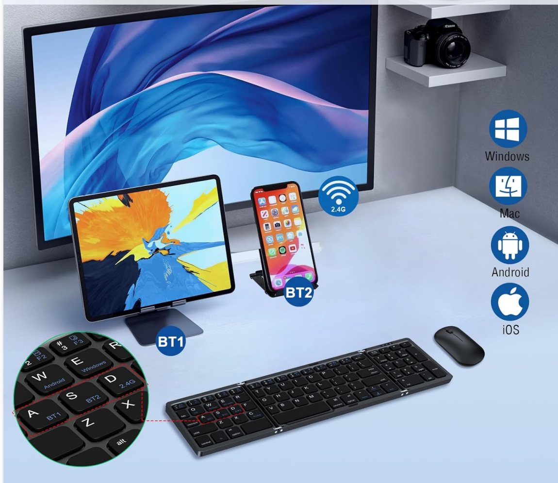
Image 3.3: Illustration of the keyboard and mouse connected to a monitor, tablet, and smartphone, highlighting multi-device compatibility.

Supports sync up to 3 devices connectivity and switch easily!