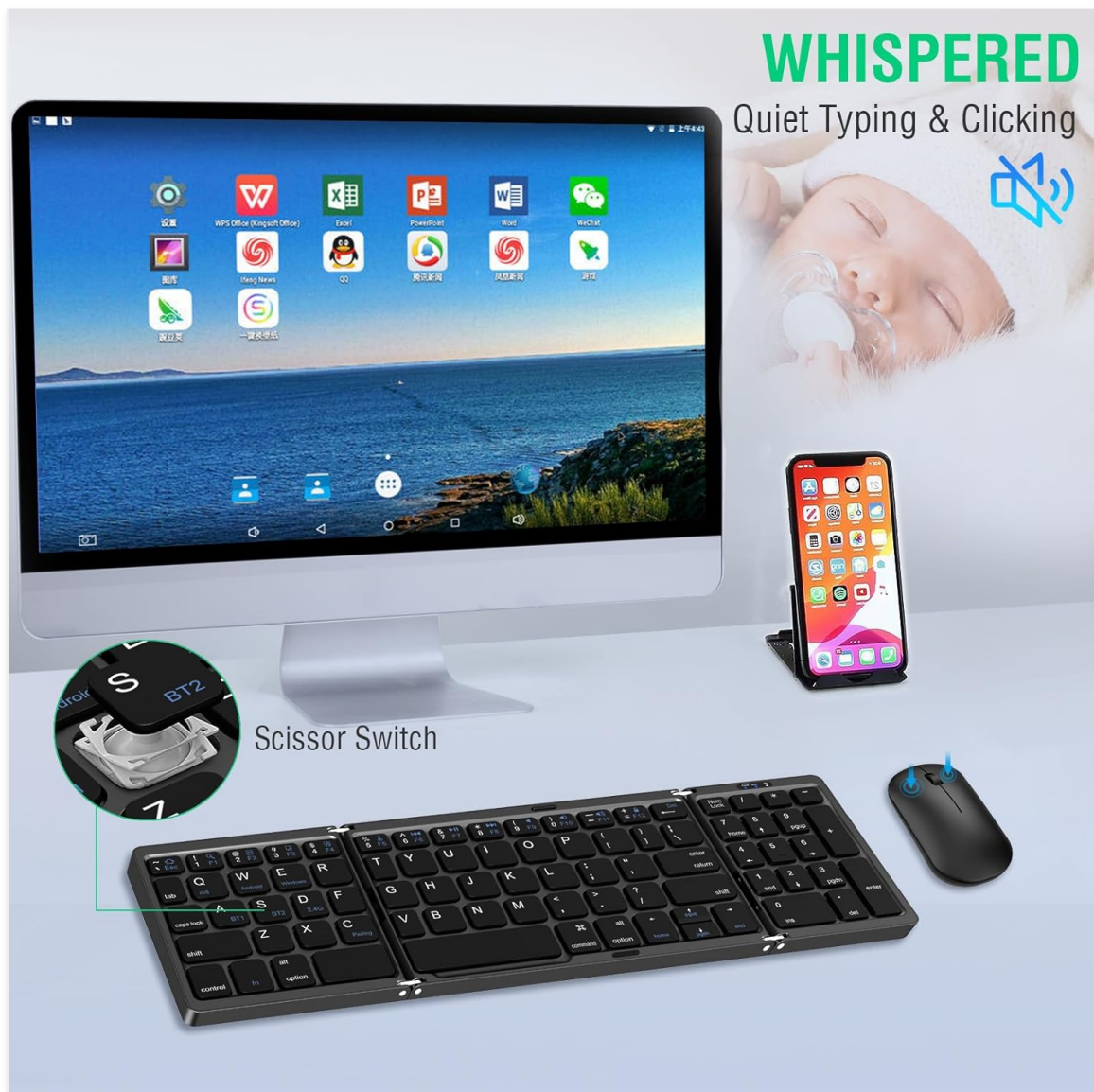
Image 3.1: Close-up of the keyboard highlighting the scissor-switch mechanism for quiet operation.