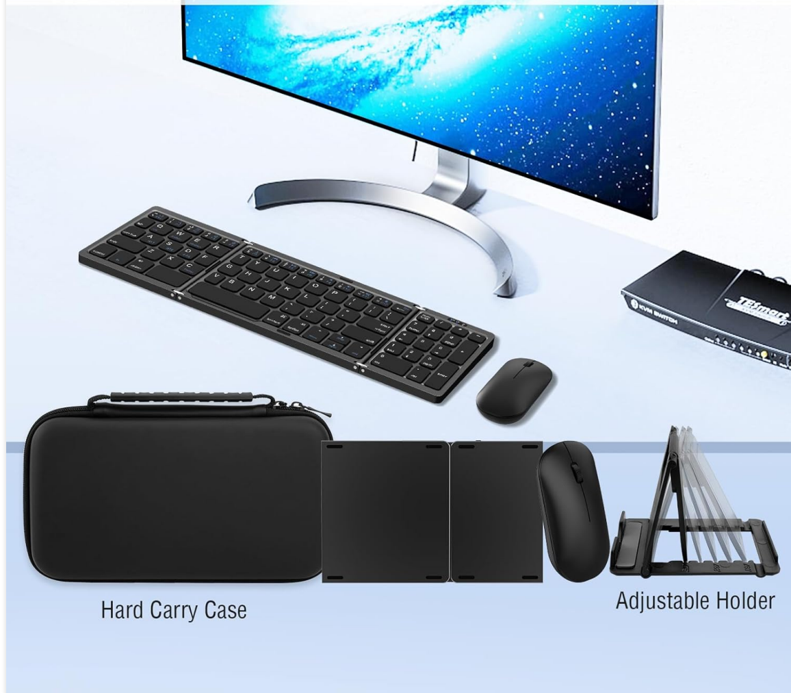
Hard Carry Case

The ideal choice for travel and business trips!