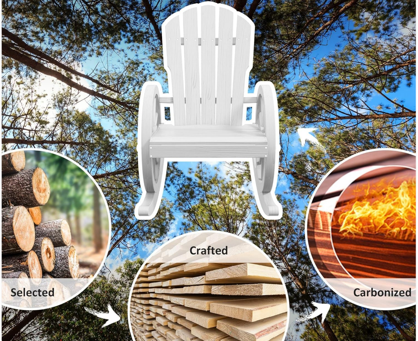
Image: Illustration demonstrating the selection, crafting, and carbonization process of the 100% natural fir wood used in the chair's construction.

High Temperature Carbonization · 100% Natural Fir Wood 100%