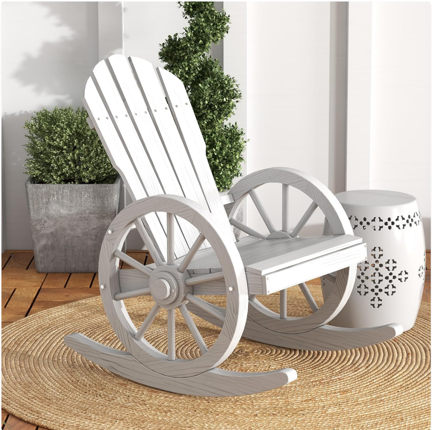
Image: The rocking chair positioned on a wooden patio, surrounded by potted plants, demonstrating its suitability for outdoor spaces.