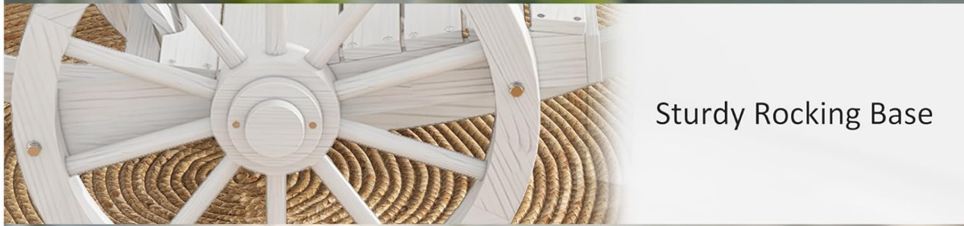
Sturdy Rocking Base