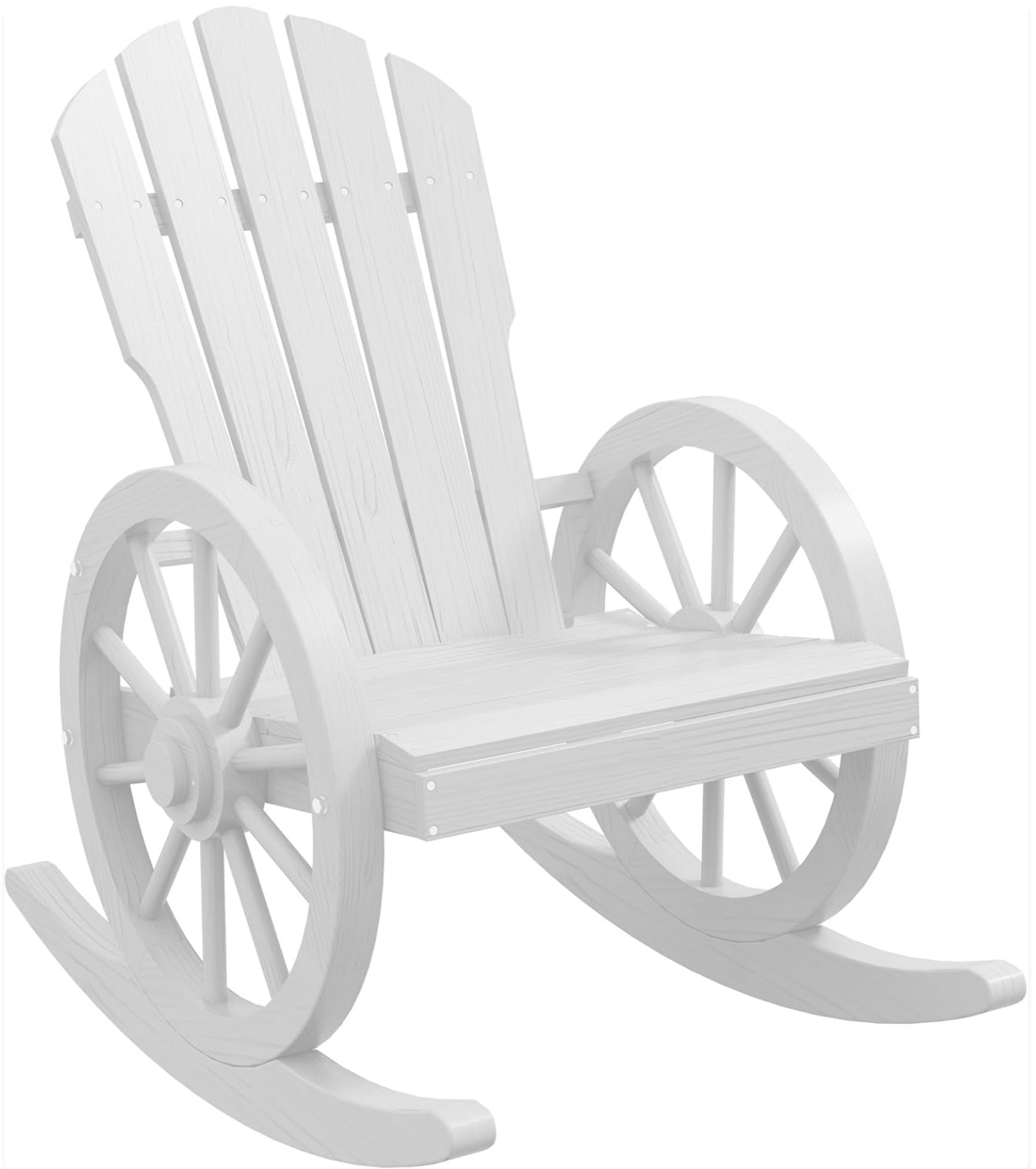
Image: Front view of the Outsunny Wooden Rocking Chair, showcasing its white finish and wagon wheel armrests.