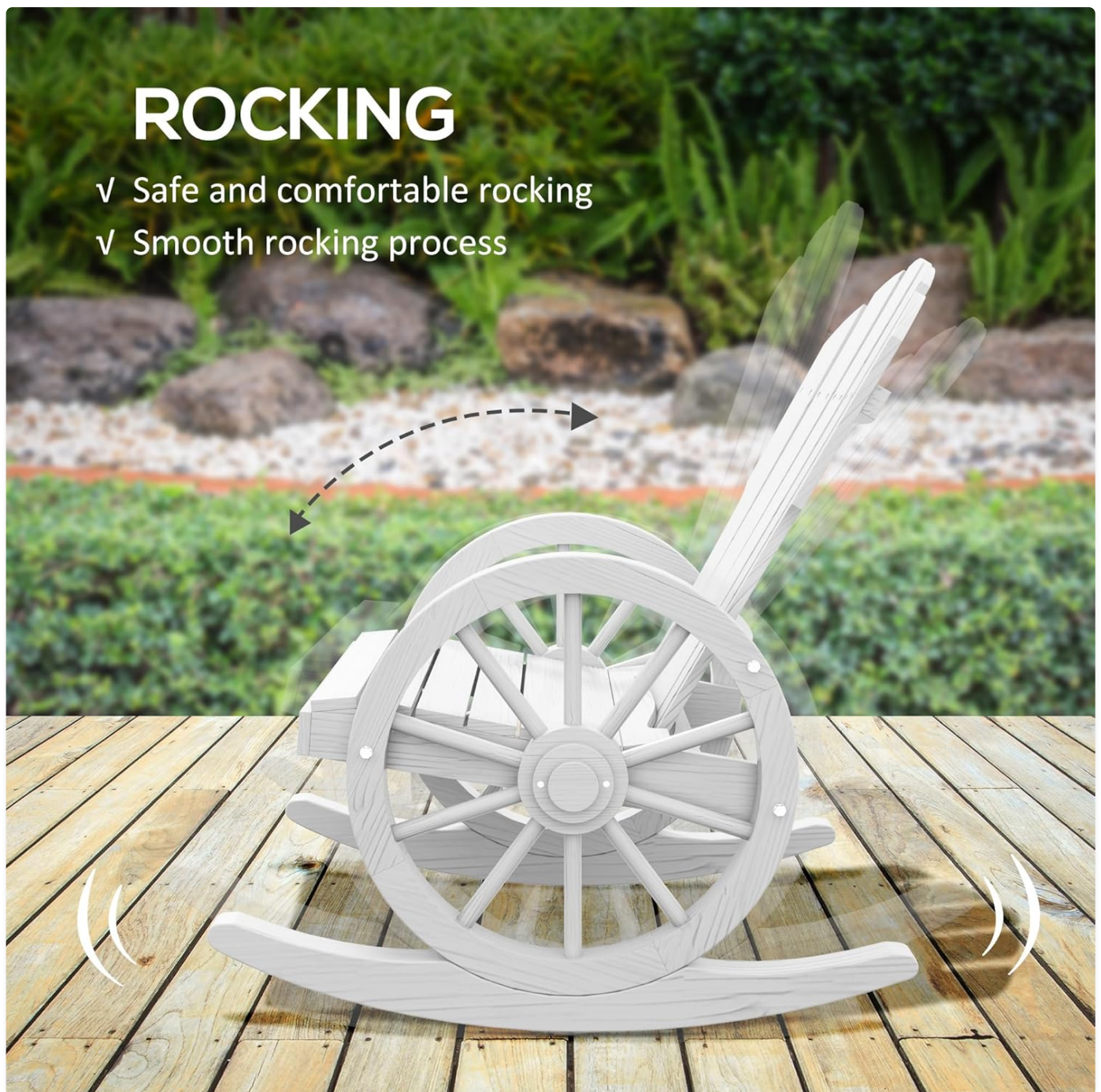
Image: Graphic depicting the gentle and safe rocking capability of the Outsunny chair.