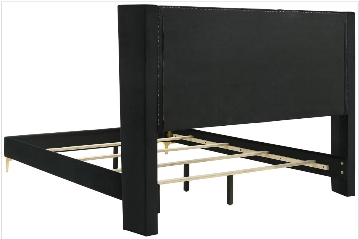
Image: Rear view of the Coaster Kendall bed frame, showing the headboard structure, side rail attachment points, and central support leg system.