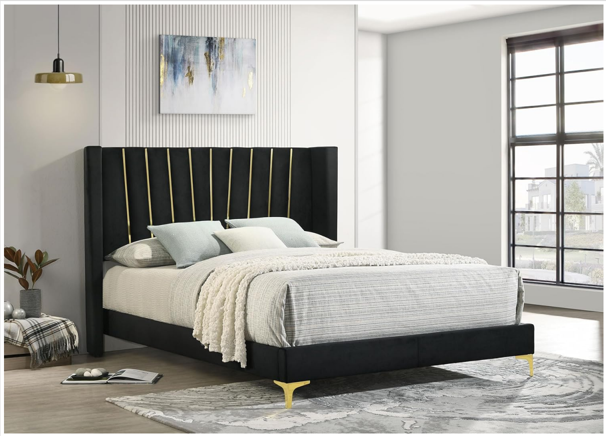
Image: The Coaster Kendall Eastern King Upholstered Bed fully assembled with a mattress and bedding, demonstrating its intended use.