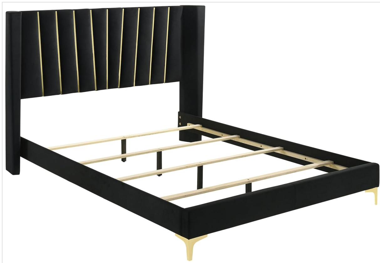
Image: The Coaster Kendall Eastern King Upholstered Bed frame, showcasing the black velvet upholstery, channel tufting, and gold accents on the headboard and feet.

Thank you for purchasing the Coaster Home Furnishings Kendall Upholstered Bed. This manual provides essential information for the safe assembly, operation, maintenance, and troubleshooting of your new bed. Please read these instructions thoroughly before beginning assembly and retain them for future reference.