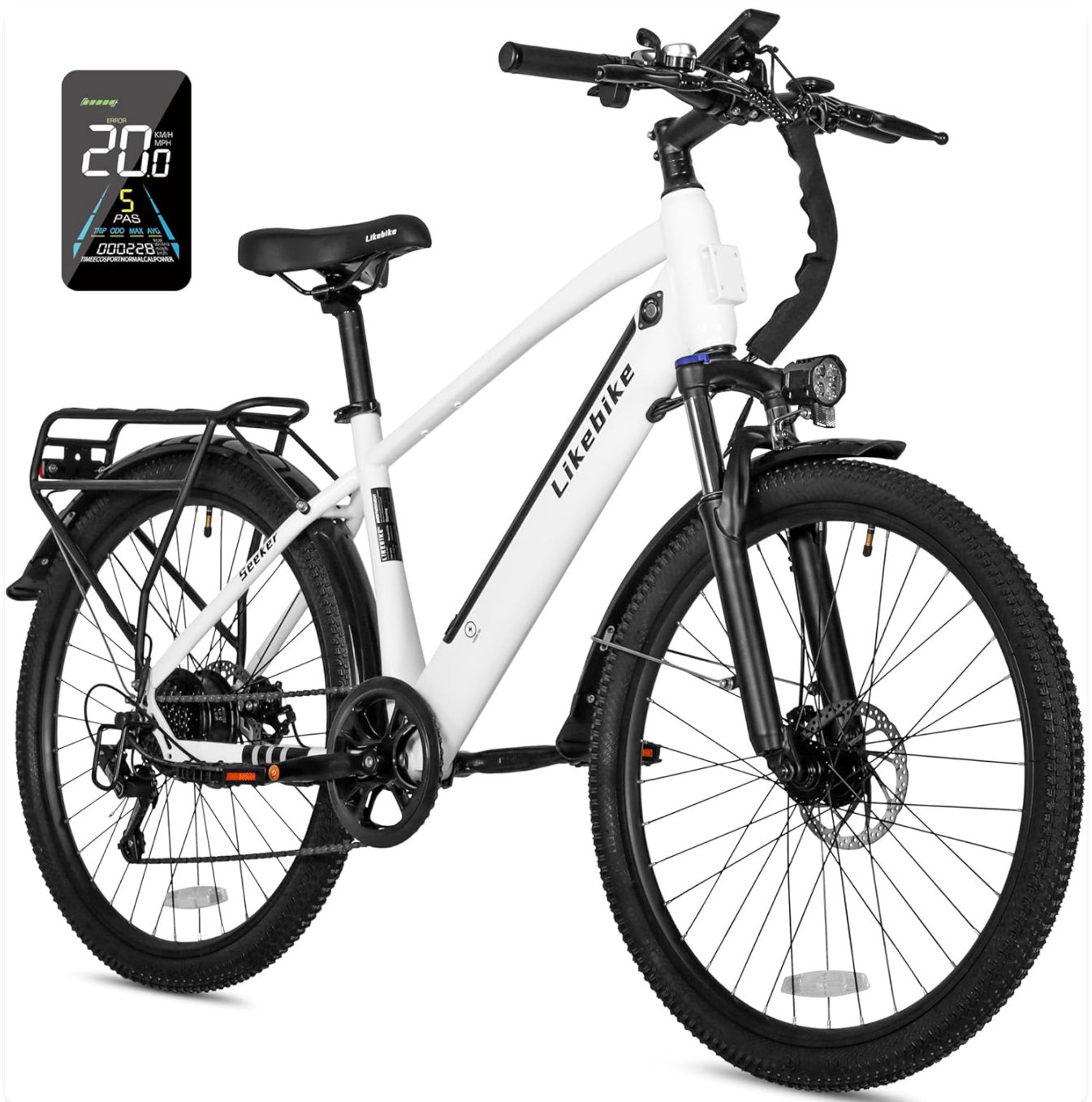
The Likebike Seeker 26" Electric Bike, featuring a powerful motor and removable battery, designed for commuting and recreational use.