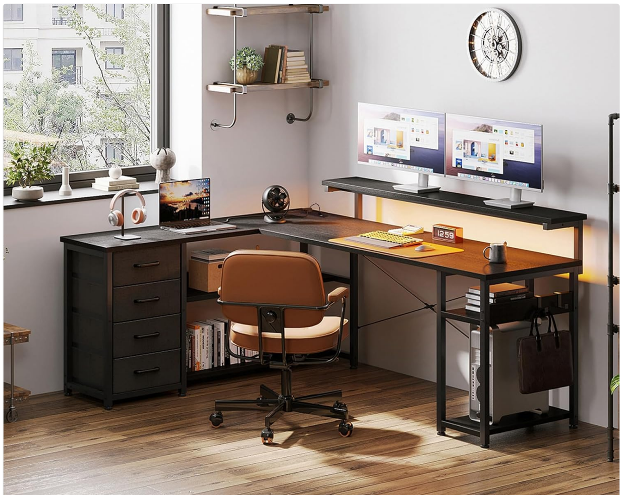
Image: The ODK L-Shaped Corner Desk integrated into a modern home office, demonstrating its versatility and ample workspace. The image implies the reversible nature of the desk's configuration.

The desk's L-shaped configuration can be assembled with the longer section on either the left or right side, allowing it to fit perfectly into various room layouts and corners. This maximizes space utilization in your home office, gaming room, or study area.