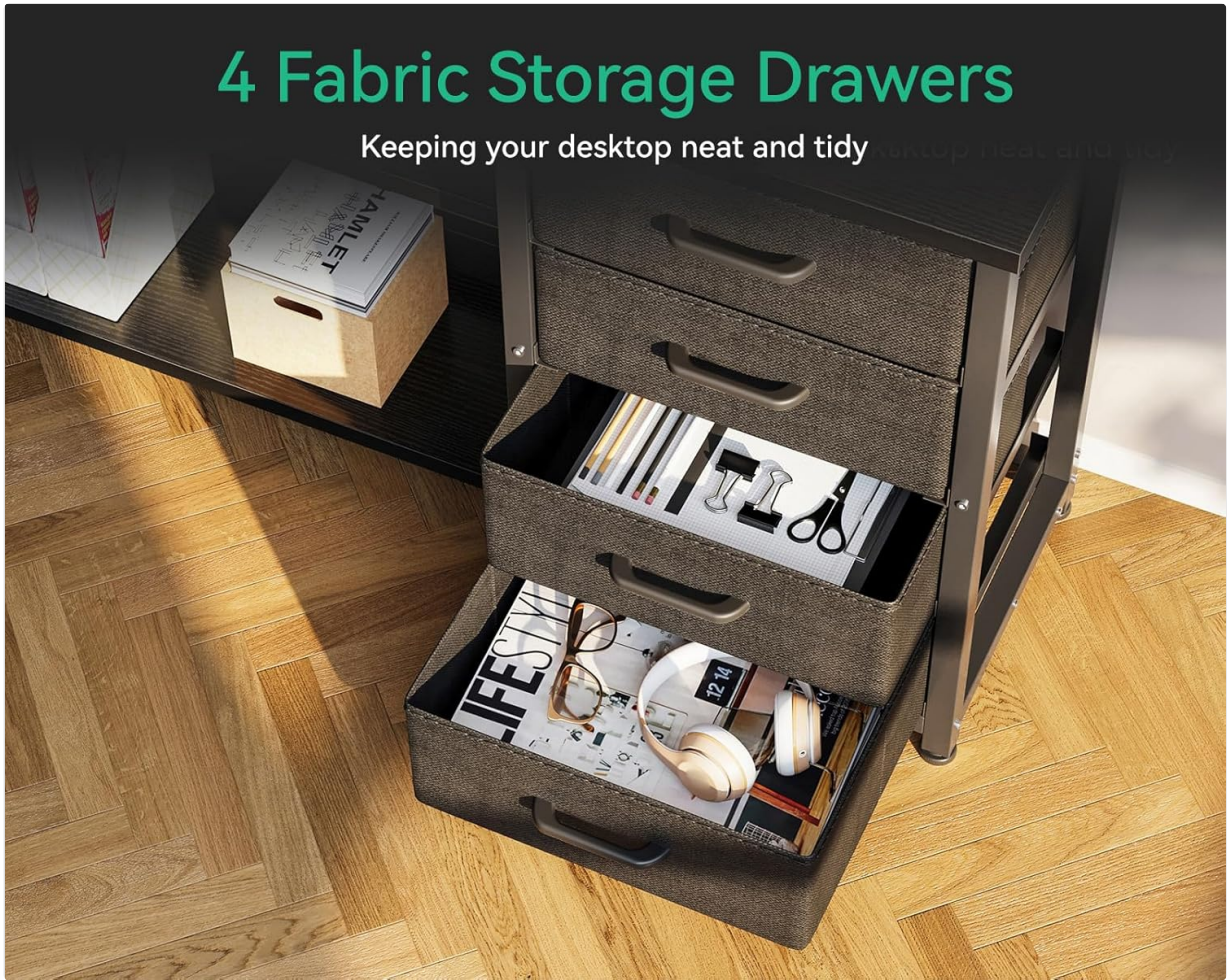
Image: A detailed view of the four fabric storage drawers, demonstrating their capacity for organizing office supplies and personal items.