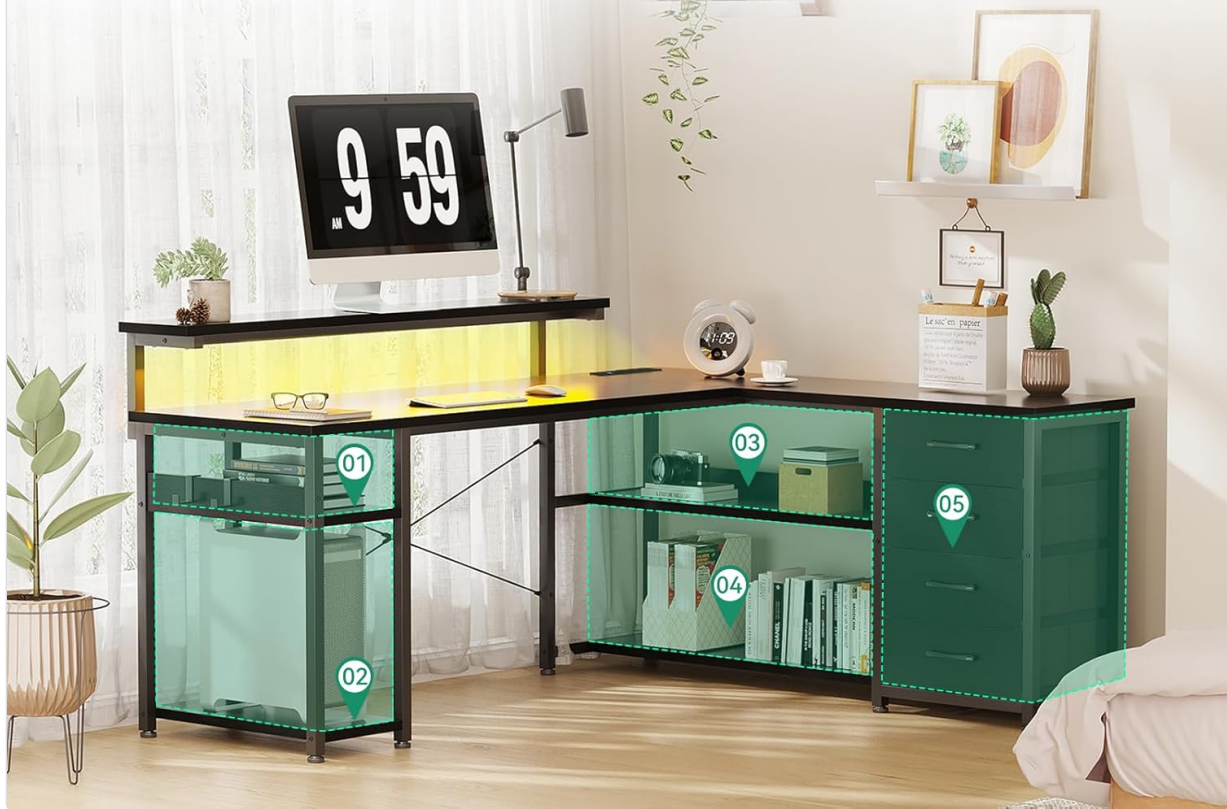
Image: An illustrative diagram highlighting the various storage options of the ODK L-Shaped desk, including designated areas for a CPU, open shelving, and the four fabric drawers.