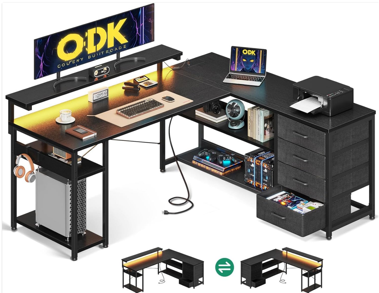
Image: The ODK L-Shaped Corner Desk fully assembled, showcasing its monitor stand, CPU stand, and integrated drawers. The image also illustrates the reversible design option.

Secure the main L-shaped desk panels to the assembled frame. Note that the L-shape is reversible; you can configure the longer side to either the left or right during this step to suit your space. Attach the monitor stand and the open storage shelves as indicated in the assembly guide.