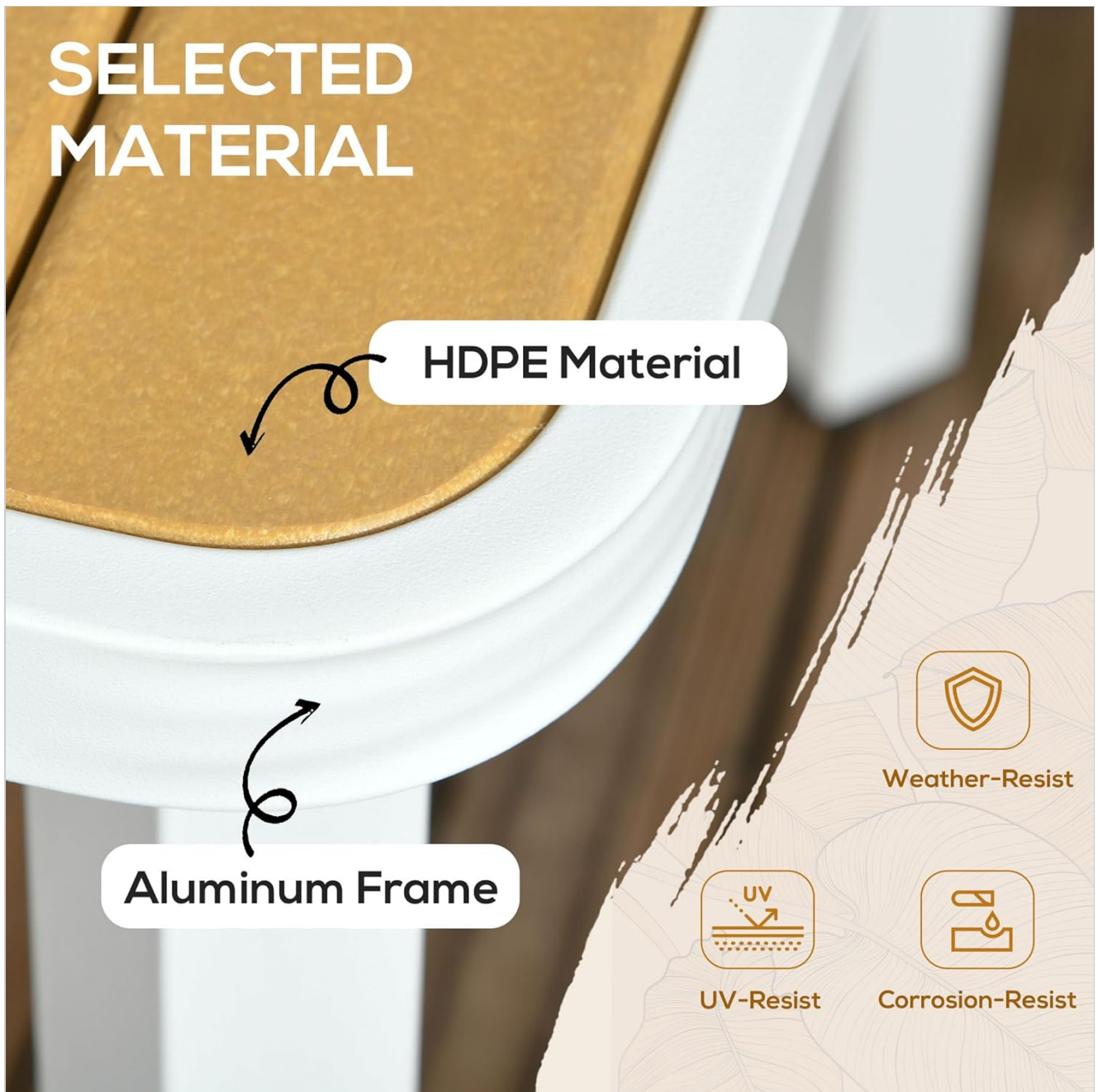
Image 4: This image highlights the materials used in the patio set: durable HDPE for the surfaces and a sturdy aluminum frame, emphasizing their weather-resistant properties.