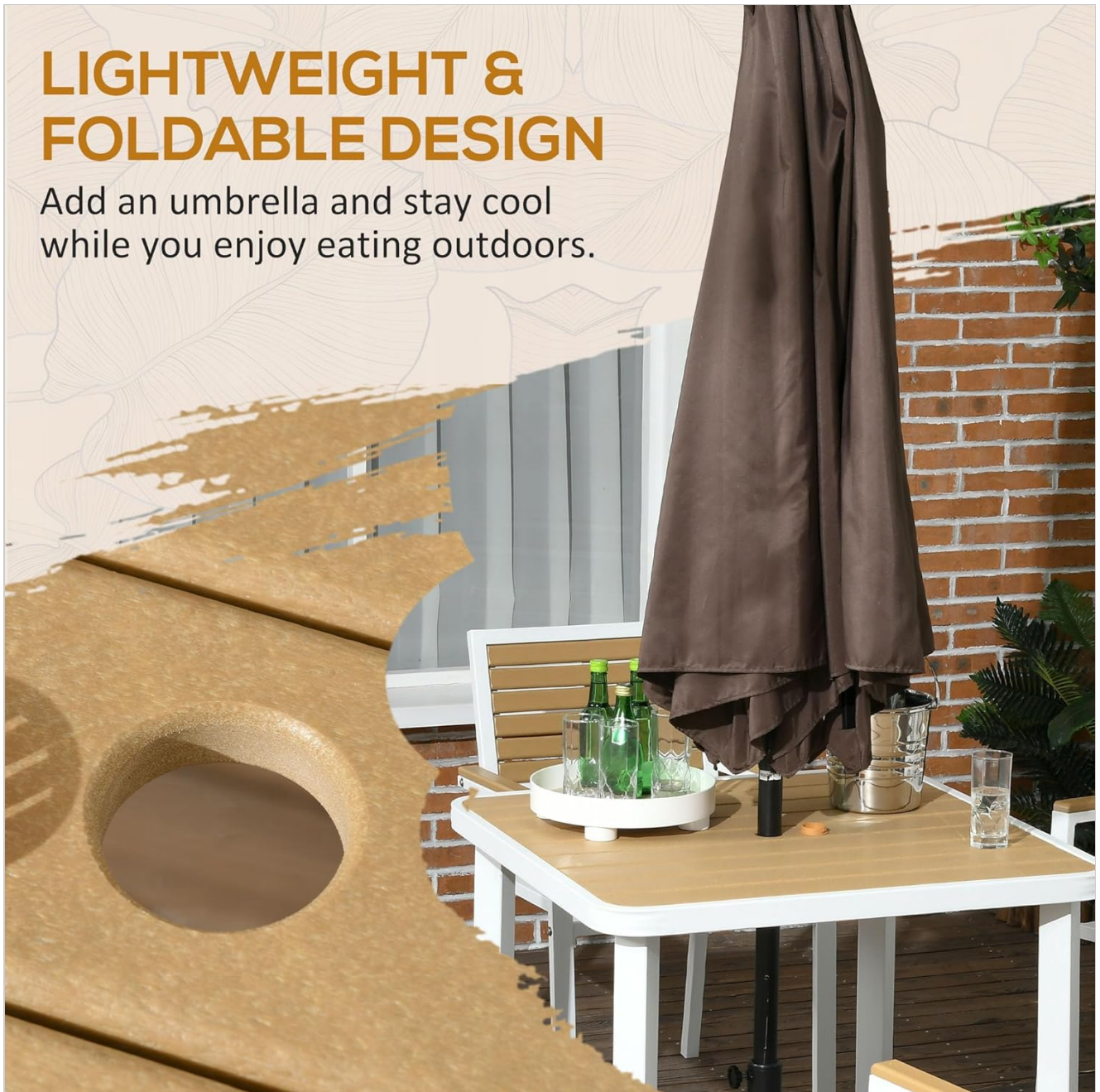
Image 3: A close-up view of the table's umbrella hole, showing the removable cap. This feature allows for the insertion of a patio umbrella.

Add an umbrella and stay cool while you enjoy eating outdoors.