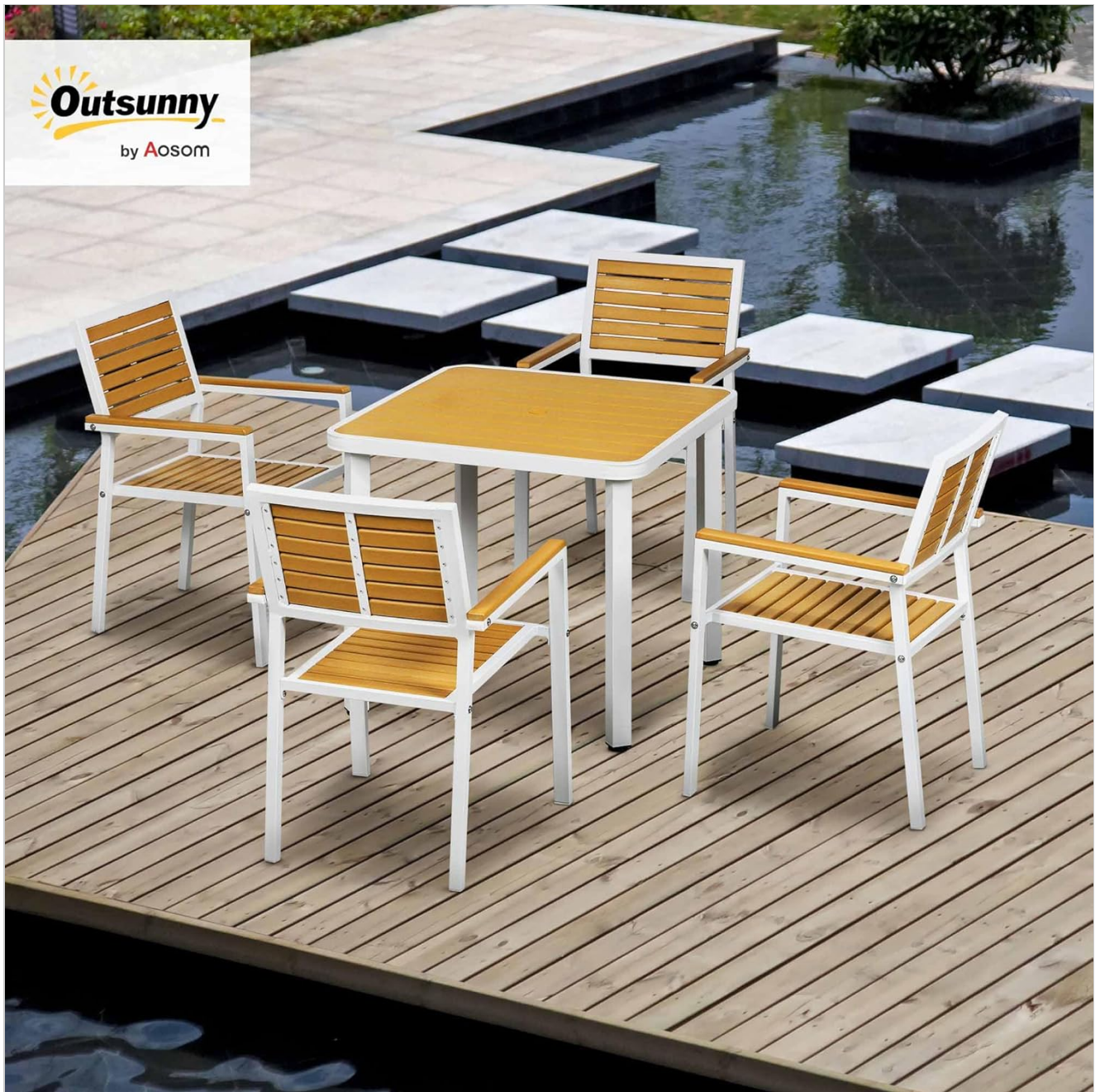
Image 1: The fully assembled Outsunny 5-Piece Patio Dining Set, showcasing the table and four chairs in an outdoor setting.