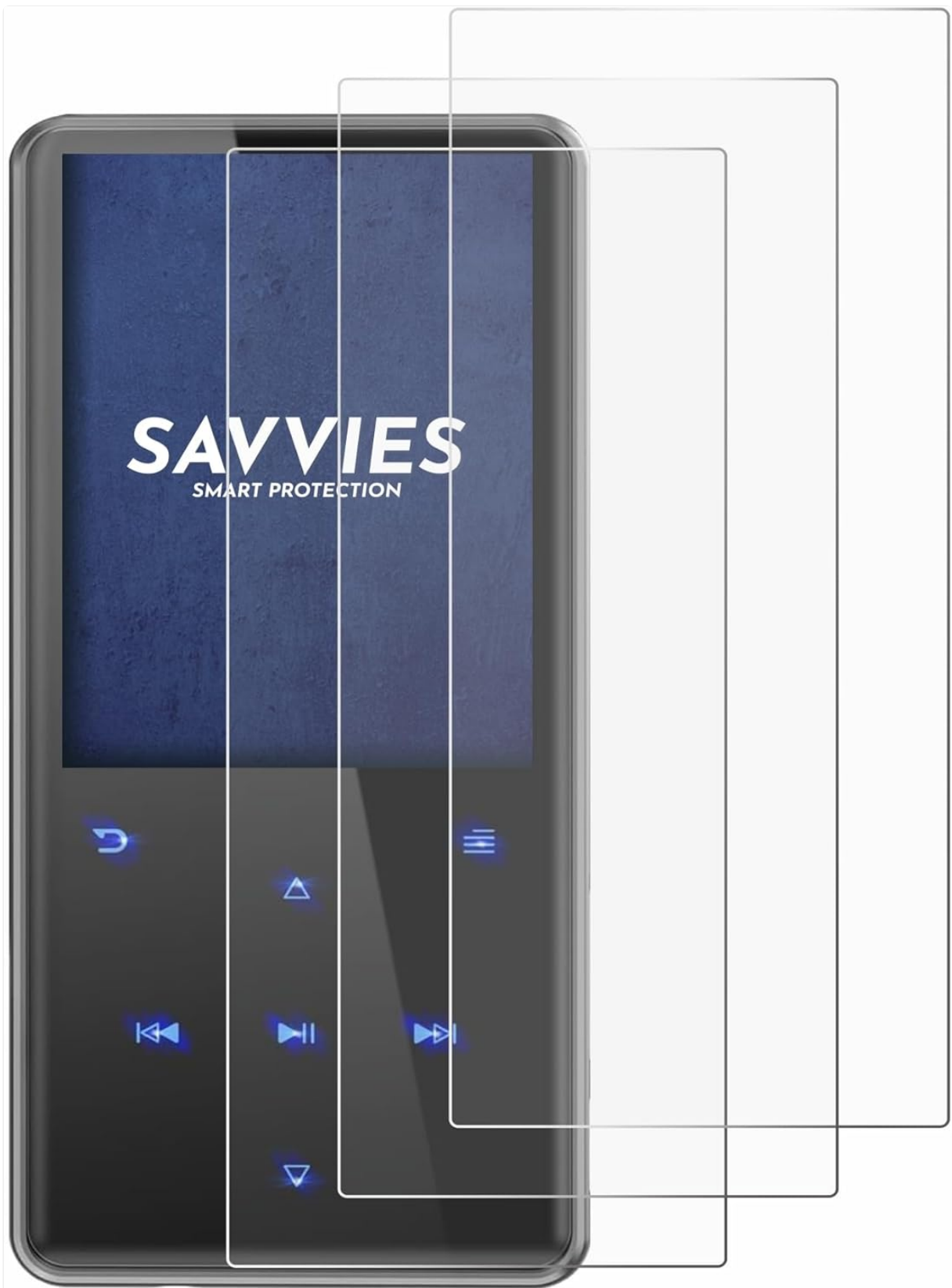
Image: Pinhui D16 device shown with savvies screen protectors, illustrating the product's intended use.