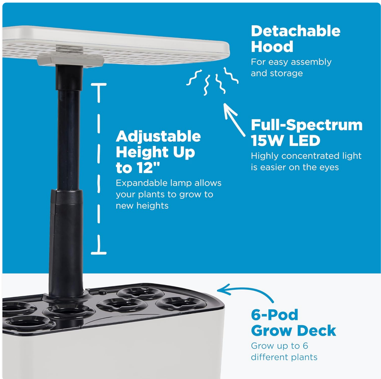
Figure 3.3: A detailed diagram highlighting the detachable hood, adjustable height up to 12 inches, and the full-spectrum 15W LED grow light of the AeroGarden Harvest Lite.