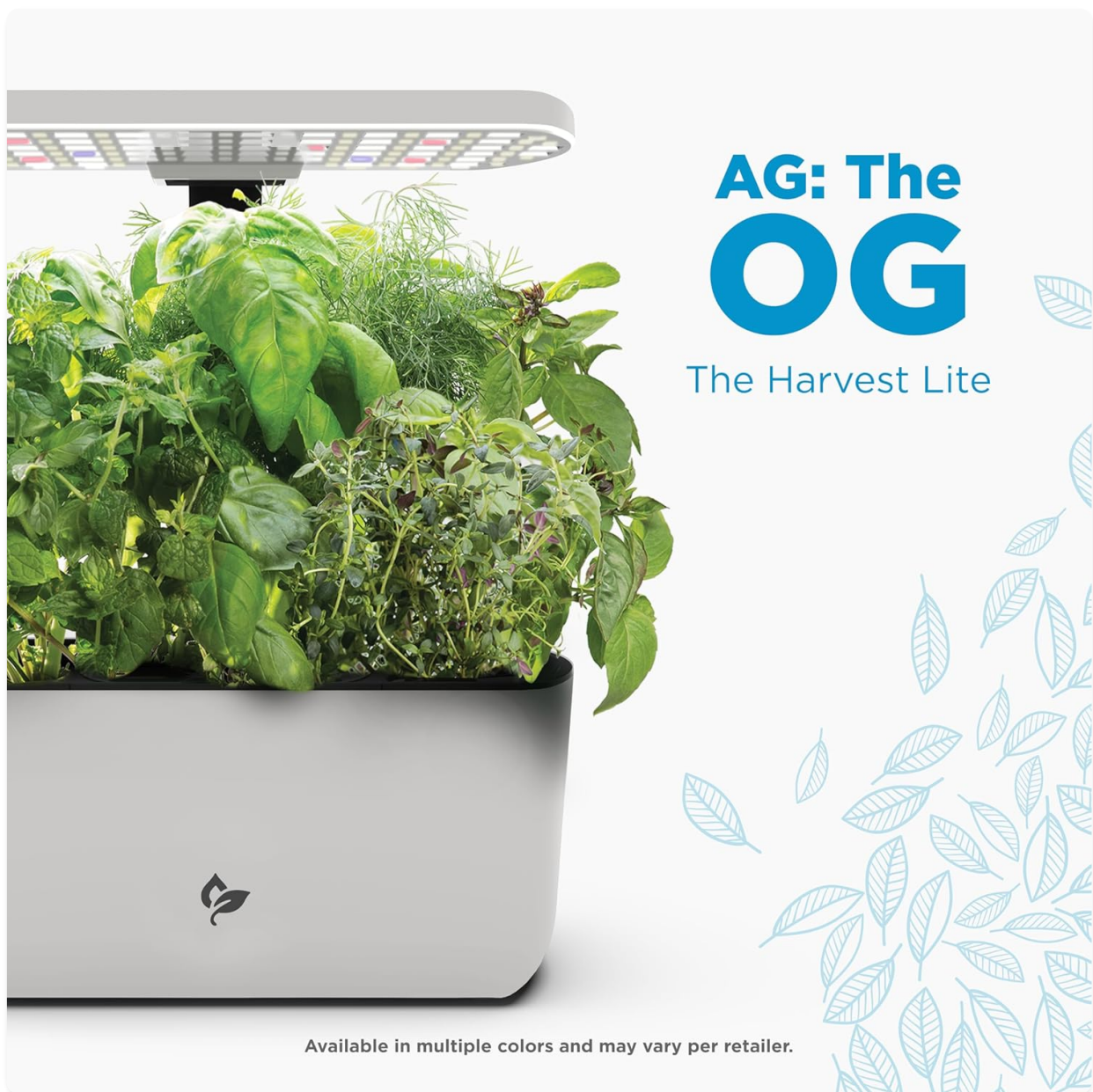
Figure 1.1: The AeroGarden Harvest Lite in Cream, showcasing a variety of fresh herbs thriving under the LED grow light. This image highlights the compact design and the vibrant growth achievable with the system.

This manual provides essential information for setting up, operating, and maintaining your AeroGarden Harvest Lite to ensure optimal plant growth and a successful indoor gardening experience.