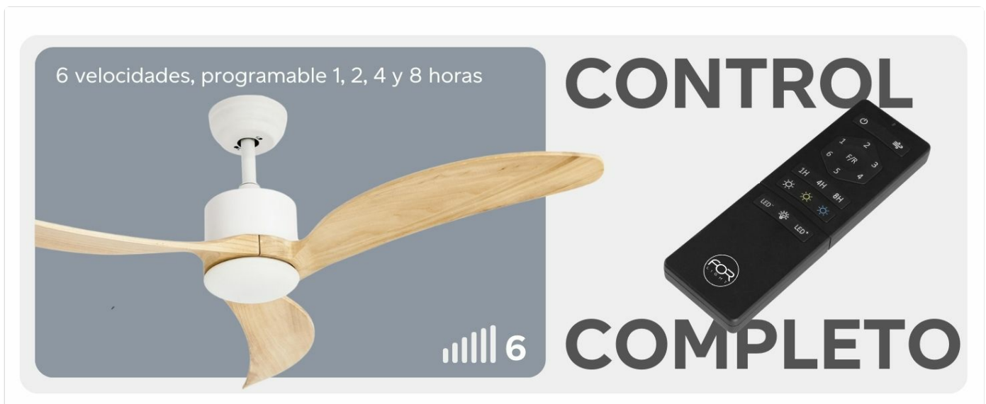
Image 6.2: Remote control showing 6 speed settings and programmable timer options.