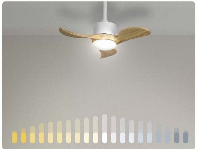
Image 4.3: The integrated LED light offers adjustable intensity and color temperature (3000K, 4200K, 6200K).