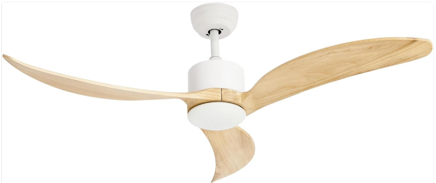
Image 4.1: Front view of the FORLIGHT Nere Ceiling Fan with its three natural wooden blades.

The FORLIGHT Nere Ceiling Fan combines efficient air circulation with integrated LED lighting, designed for modern living spaces. It features a silent DC motor and natural wooden blades.