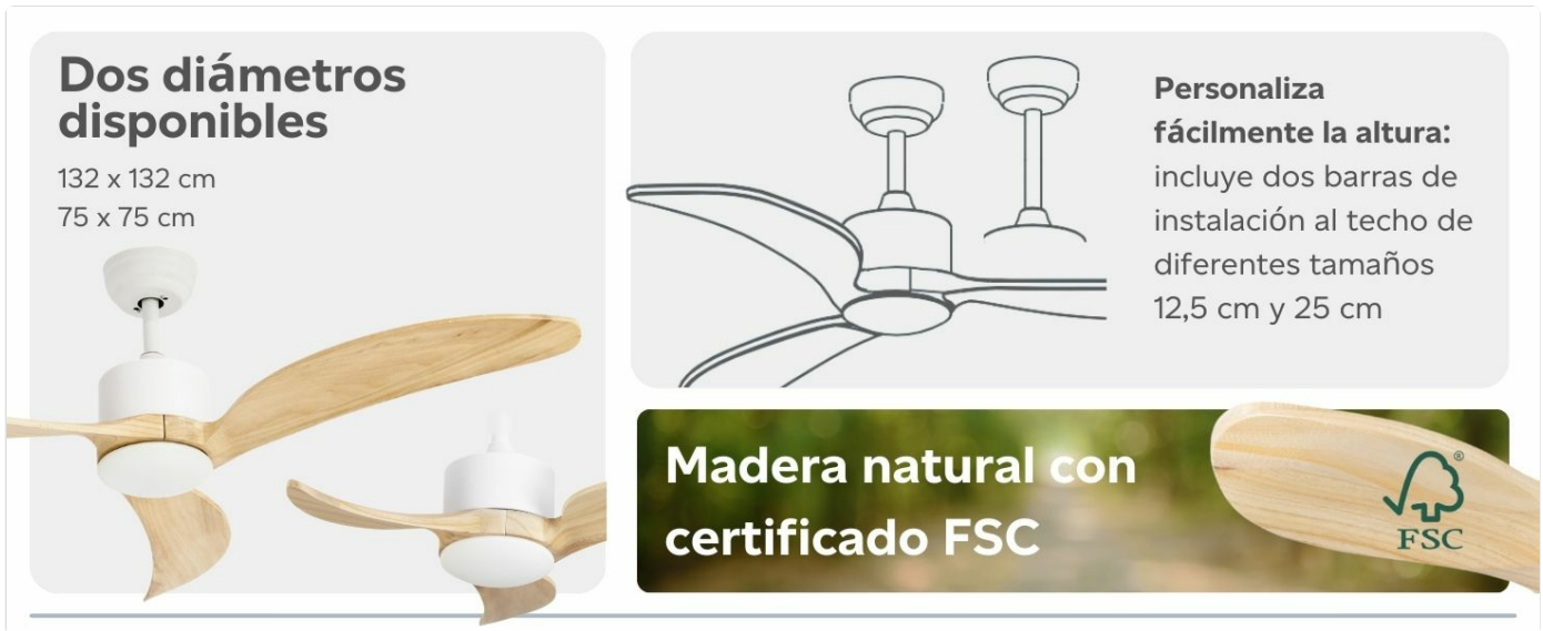
Image 5.1: The fan includes two downrod lengths (12.5 cm and 25 cm) for customizable height. Blades are made from FSC certified natural wood.