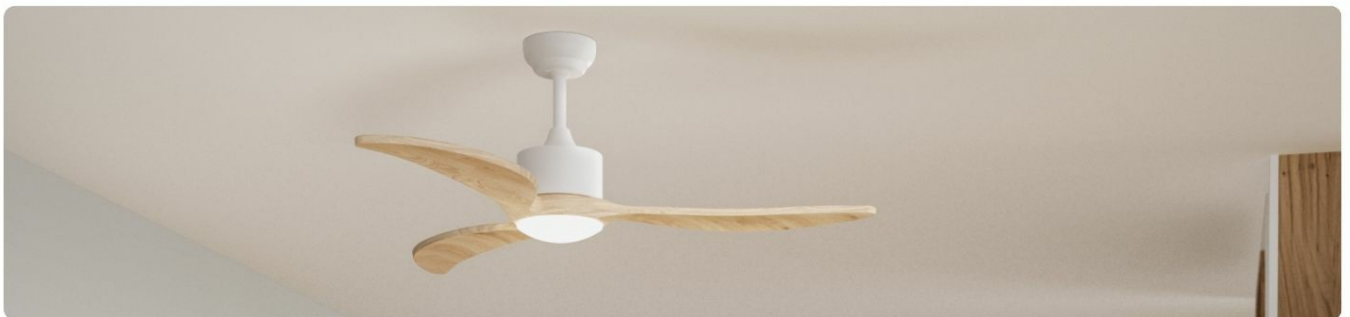
Image 1.1: The FORLIGHT Nere Ceiling Fan, designed for comfort and well-being.