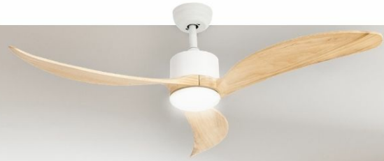
Image 4.2: Key features including the ultra-silent DC motor and integrated LED light.