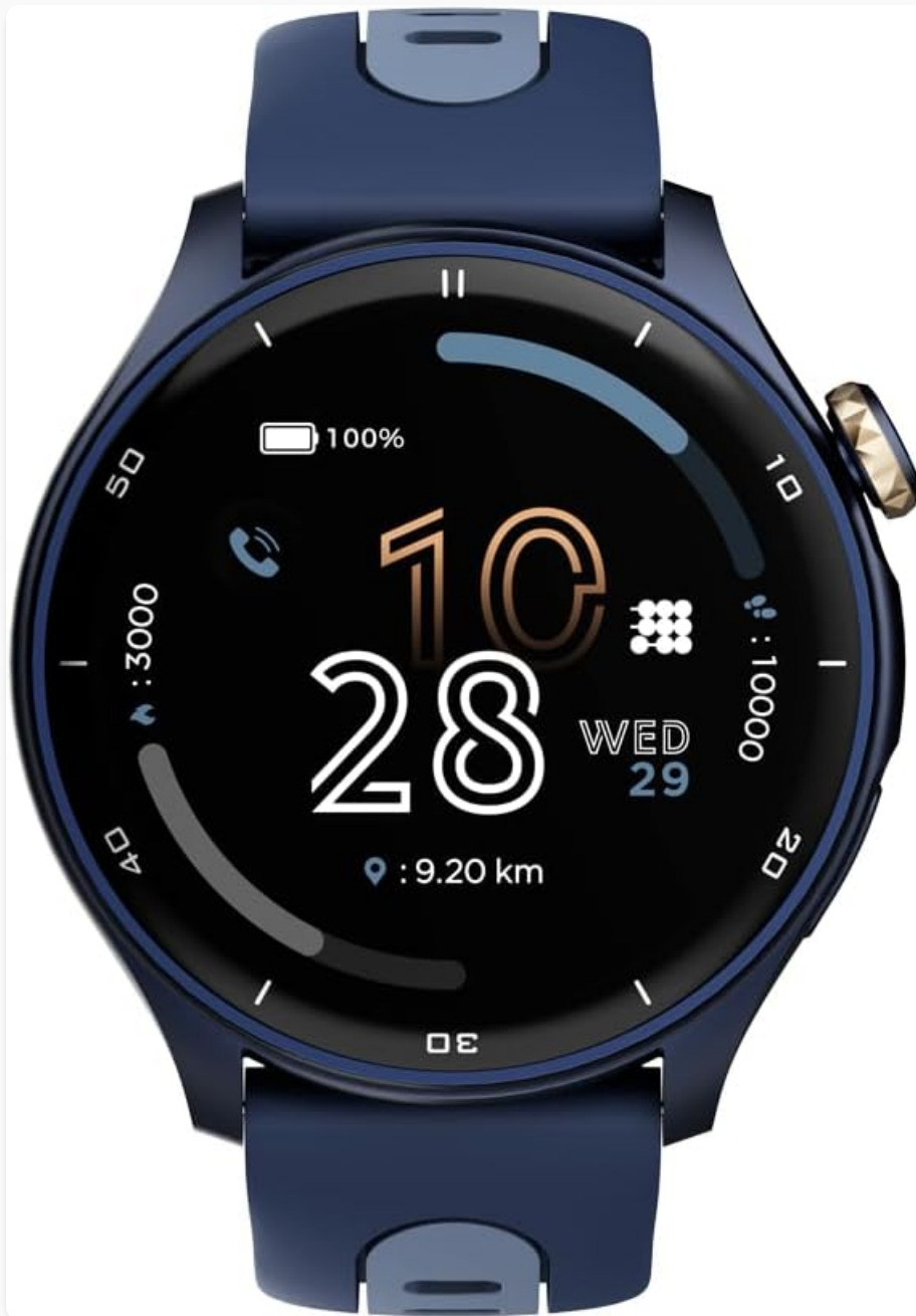
Image: Front view of the Cubitt Aura Pro Smartwatch, displaying time, date, battery, and activity metrics on its AMOLED screen.