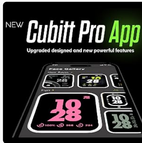
Image: A visual representation of the Cubitt Pro App, showing various watch face options and health data.