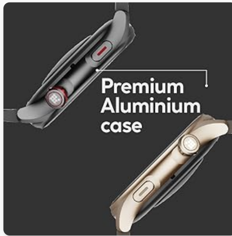
Image: A detailed view of the watch's side profile, highlighting its premium aluminum case and button design.