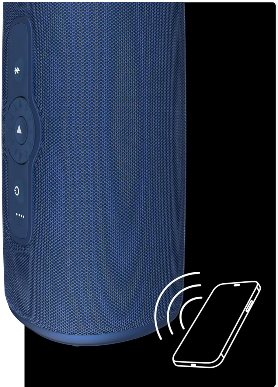
Image: A graphic demonstrating Party Mode, where two mobile devices are simultaneously connected to the speaker, allowing for shared control of music playback.

Schließe zwei Geräte gleichzeitig an den Lautsprecher an