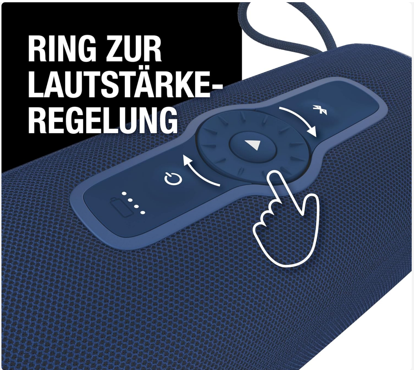
Image: A detailed view of the speaker's top control panel, highlighting the volume control ring for easy adjustment.