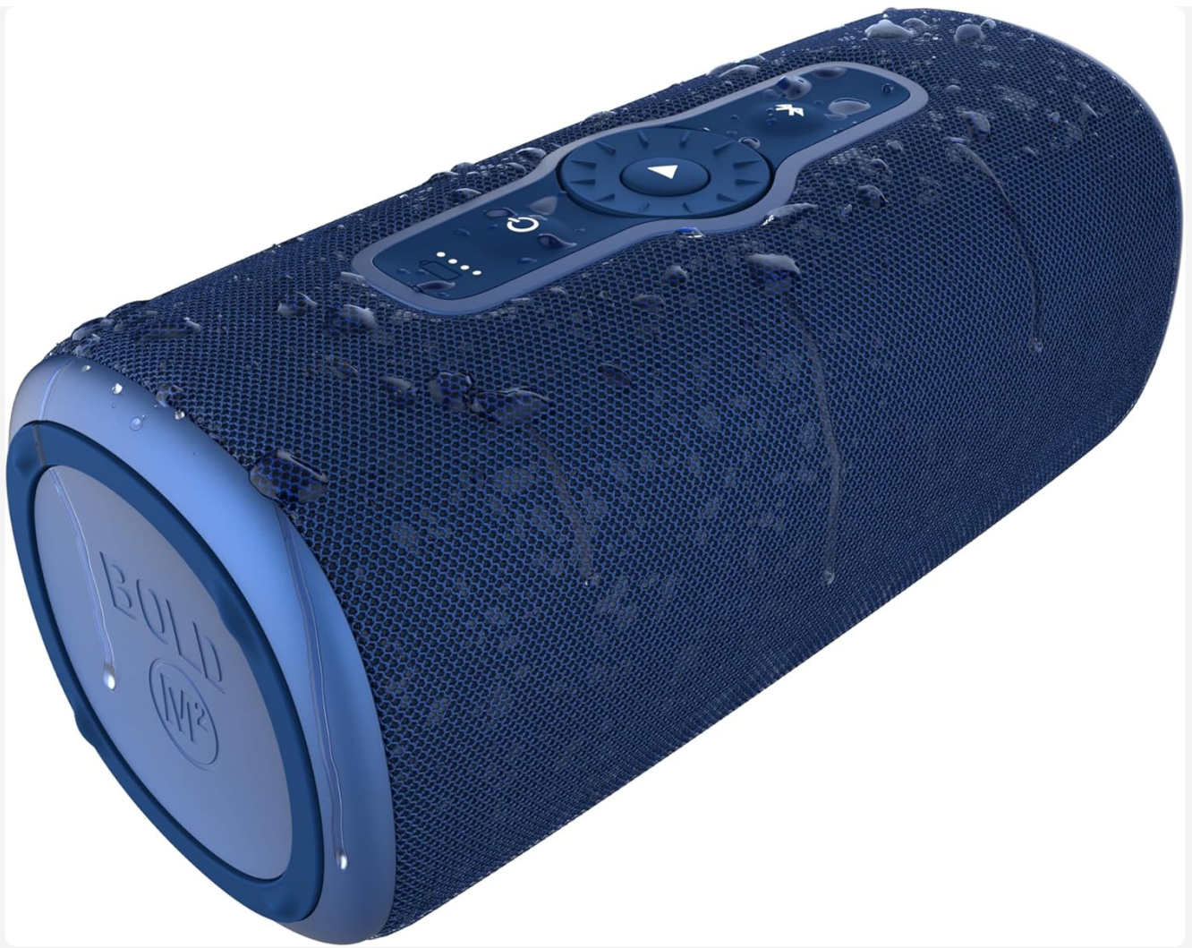
Image: The Bold M2 speaker with water droplets on its surface, visually confirming its waterproof capabilities.