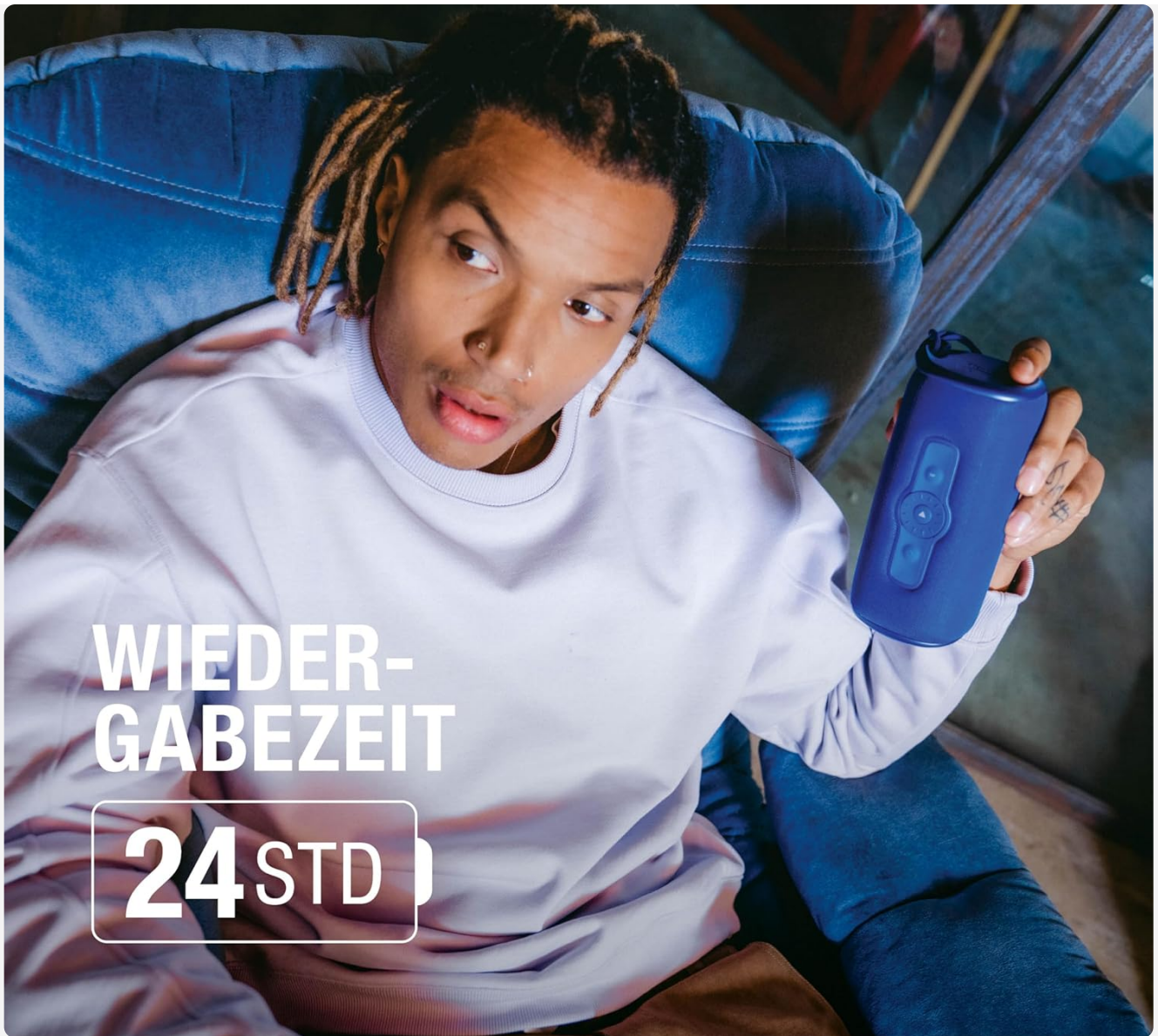
Image: A person holding the Bold M2 speaker, with text overlay highlighting "24 Hours Playtime," demonstrating the speaker's long battery life.