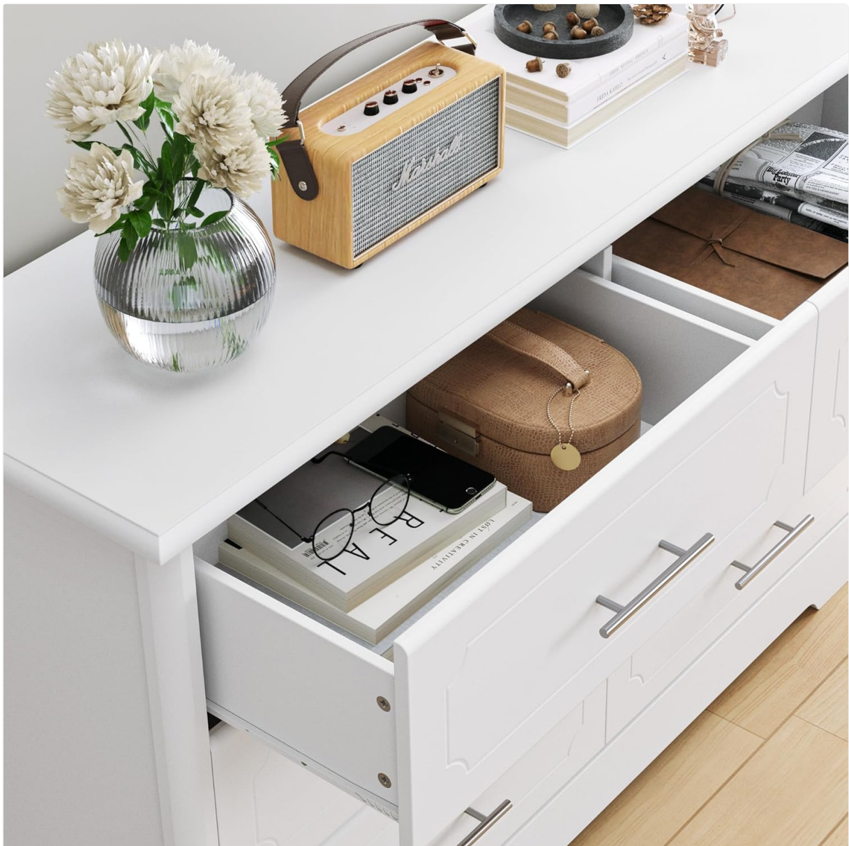
Figure 5.1: Close-up of an open drawer, demonstrating accessibility.

This image shows a drawer partially open, revealing its interior space and the smooth operation of the drawer slides.