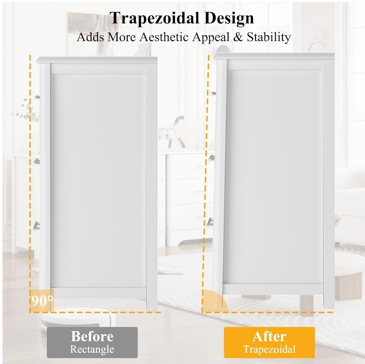
Figure 3.2: Illustration of the trapezoidal design for enhanced stability.

This image highlights the unique trapezoidal structure of the dresser, which contributes to its stability compared to a rectangular design.