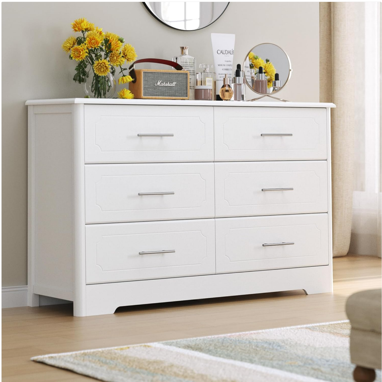
Figure 3.1: Front view of the HOSTACK 6-Drawer Dresser.

This image displays the complete dresser in a room, showcasing its six drawers and modern design.