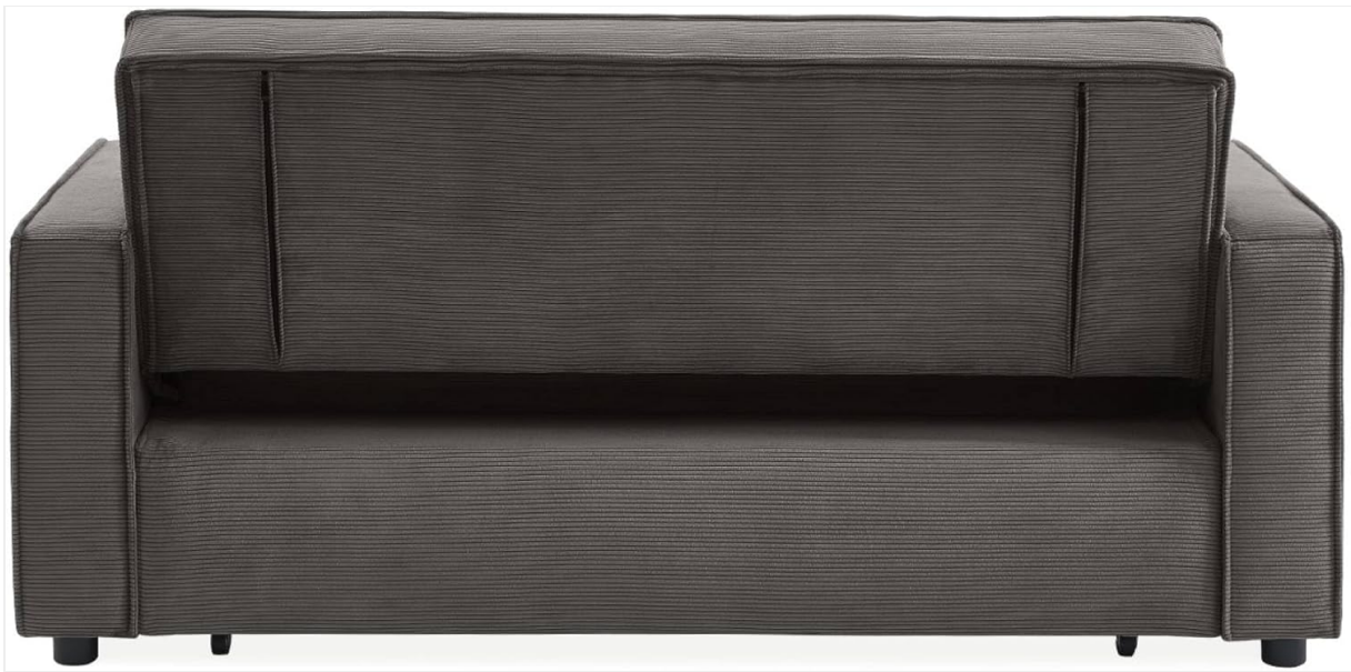
Image: Detail of the retractable mechanism that allows the sofa to convert into a bed.