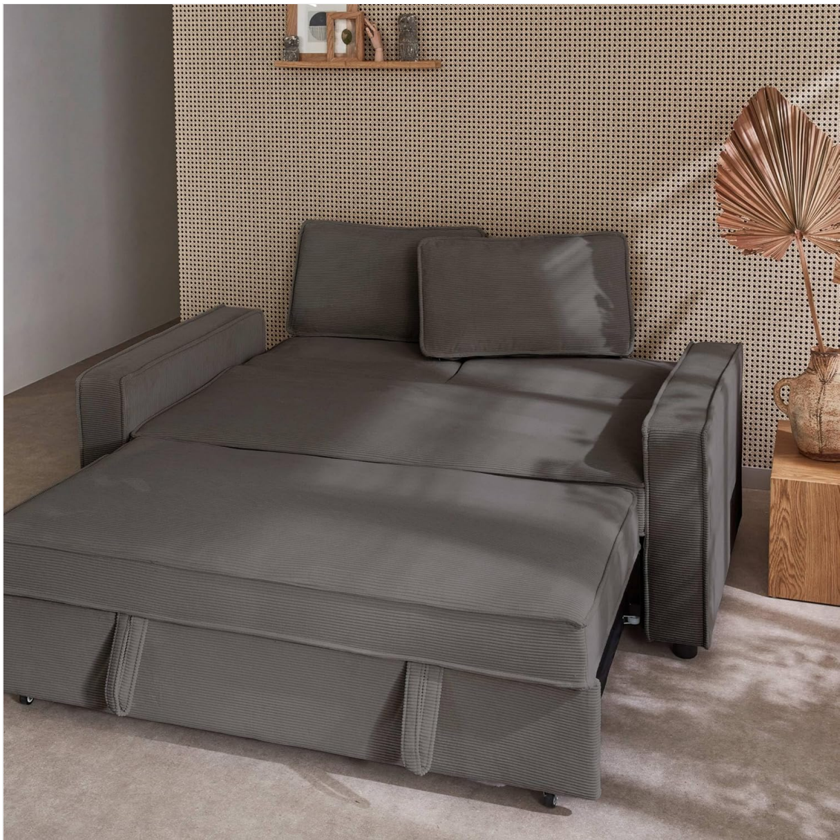
Image: The sweeek sofa fully transformed into a comfortable bed.