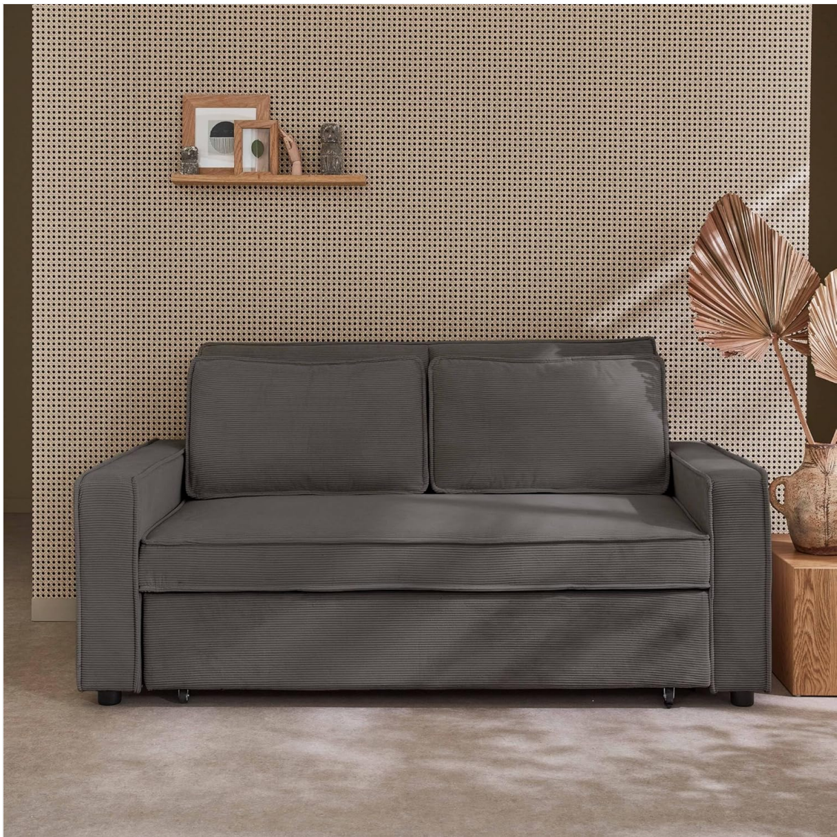
Image: The sweeck 2-Seater Corduroy Convertible Sofa Bed in its standard sofa configuration, showcasing its corduroy fabric and included cushions.