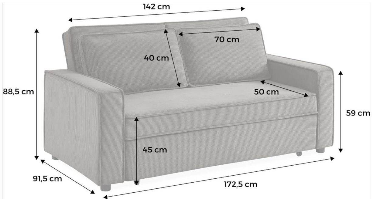
Image: Detailed dimensions of the sofa bed in its sofa configuration.