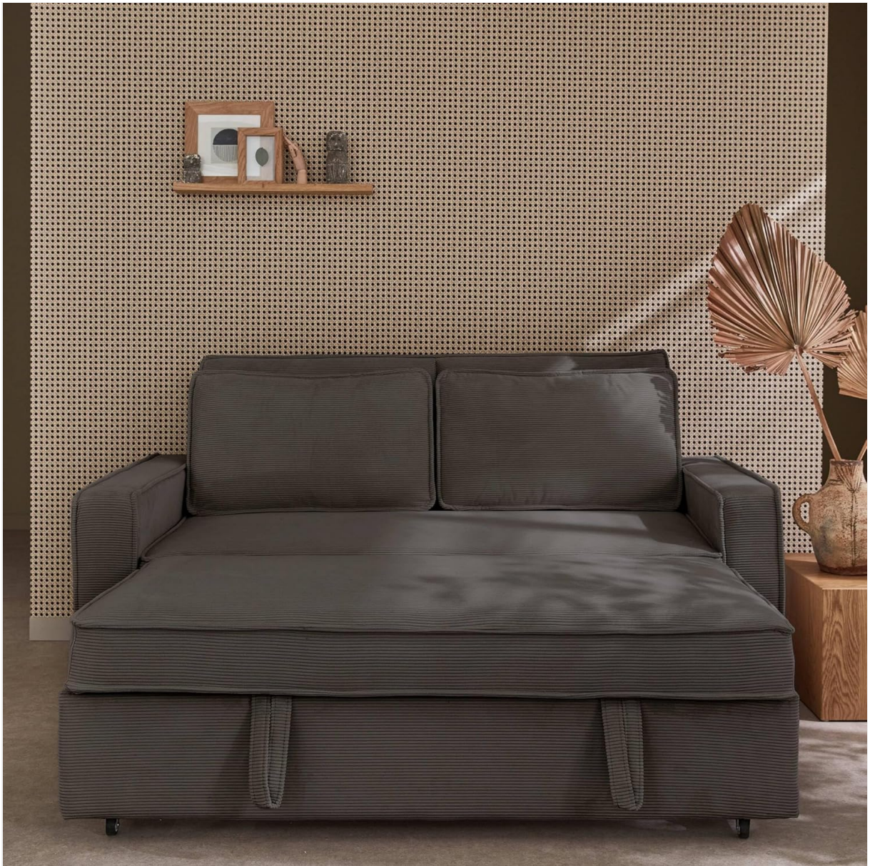
Image: The sofa in a transitional state, with the bed mechanism partially extended.