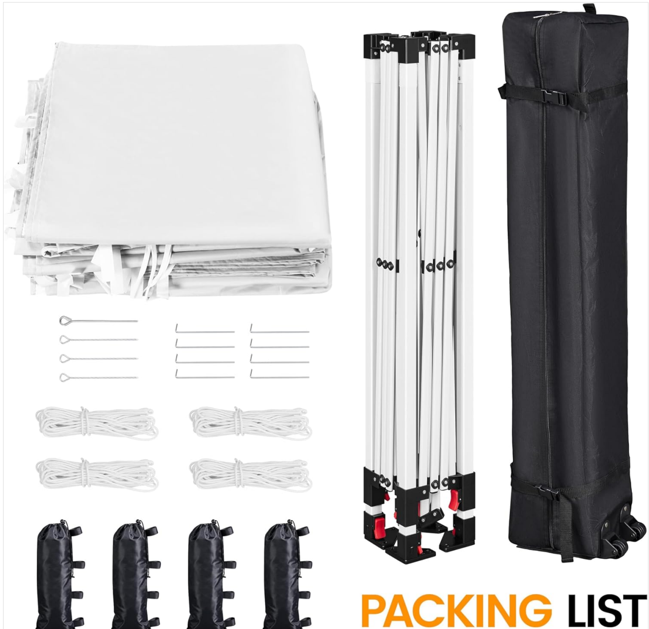
Image: All components included in the Yaheetech 10x10 Pop Up Canopy package, showing the roller bag, folded frame, canopy fabric, sandbags, guy lines, and ground stakes.

Verify that all components are present before beginning assembly: