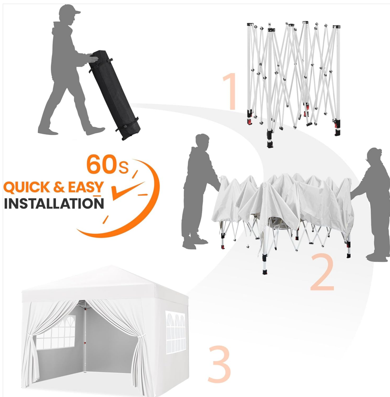
Image: Visual guide illustrating the three main steps for quick and easy installation of the canopy frame and top.