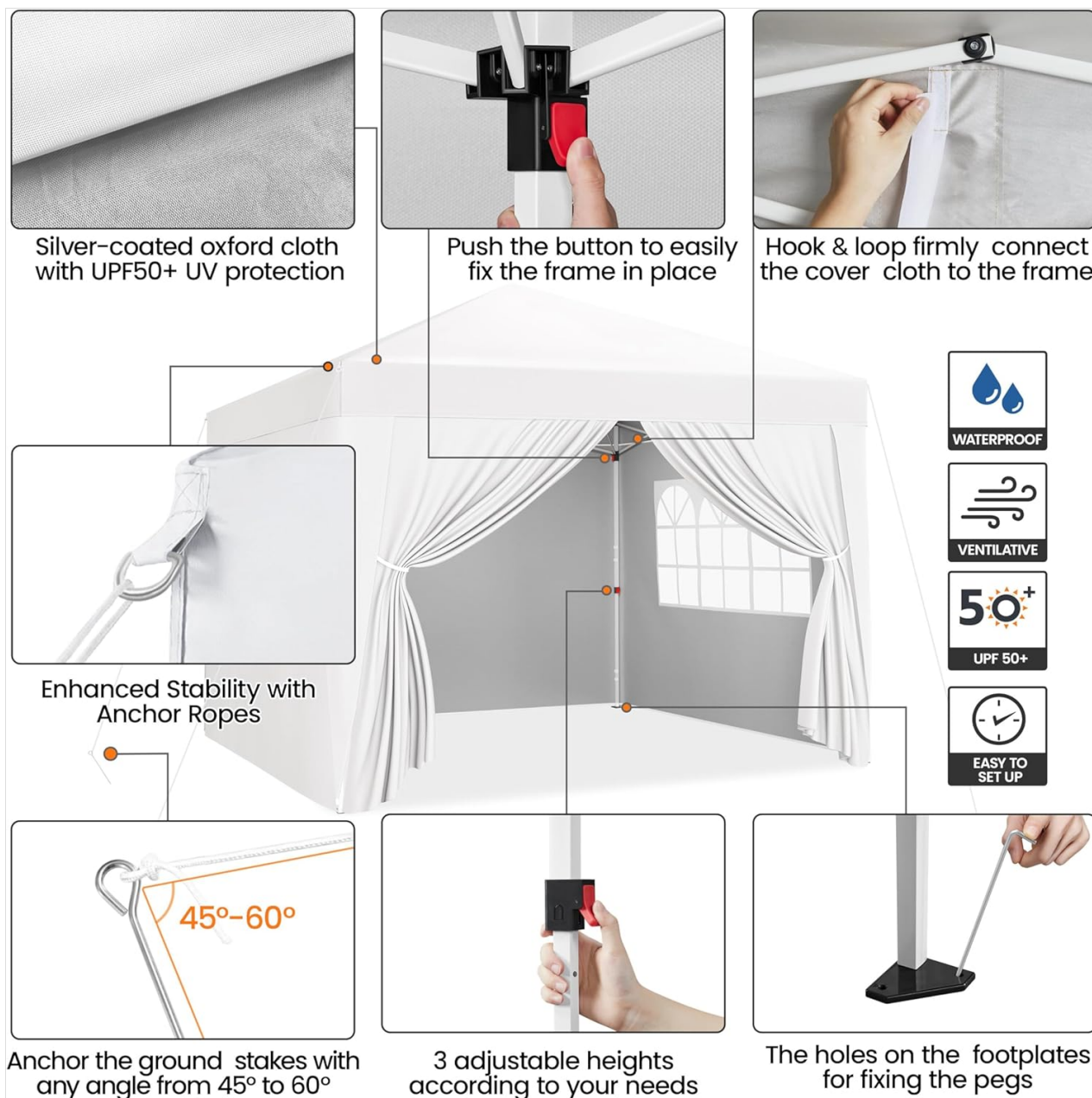
Image: Close-up view of key features such as the silver-coated oxford cloth with UPF50+ UV protection, quick-release buttons for frame adjustment, hook & loop fasteners for securing the cover, and enhanced stability with anchor ropes.