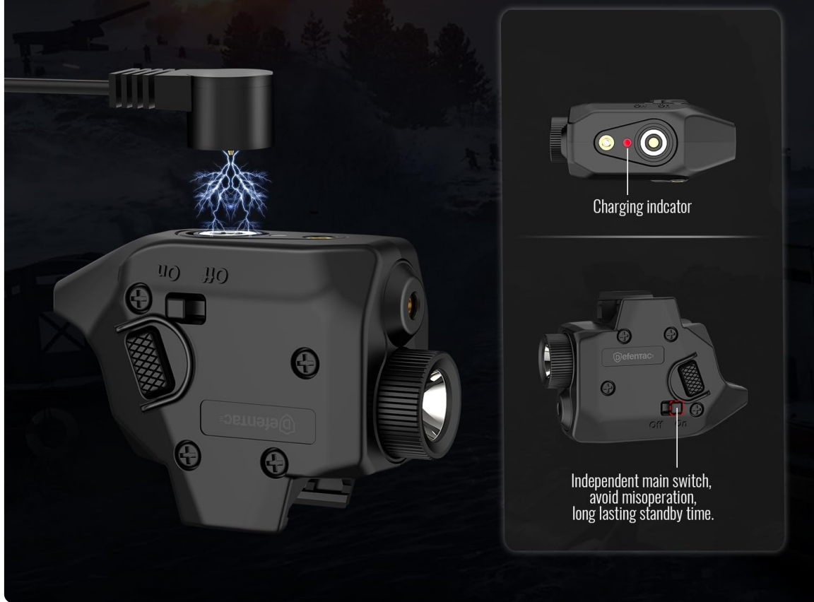
Image: The magnetic charging feature of the DEFENTAC DF51, showing the charging cable connected.

No need disassemble or take off from pistol