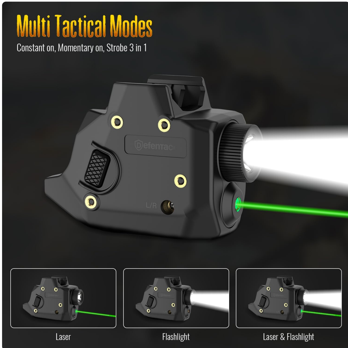
Image: Illustration of the three tactical modes: Laser, Flashlight, and Laser & Flashlight combined.