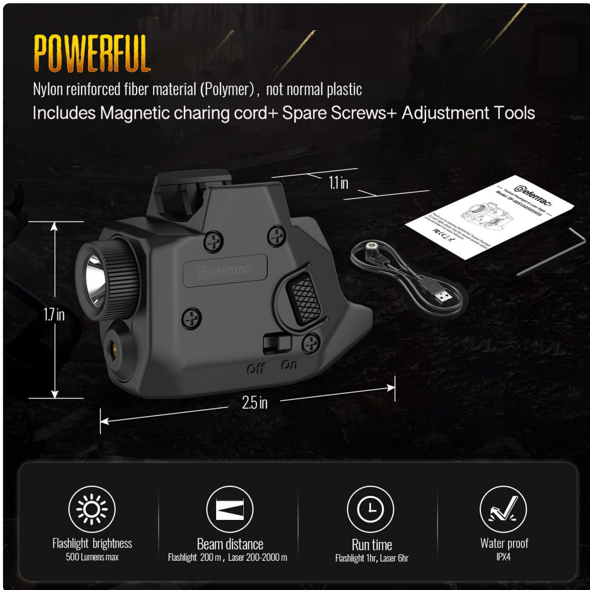
Image: Key specifications and features of the DEFENTAC DF51, including dimensions and performance metrics.