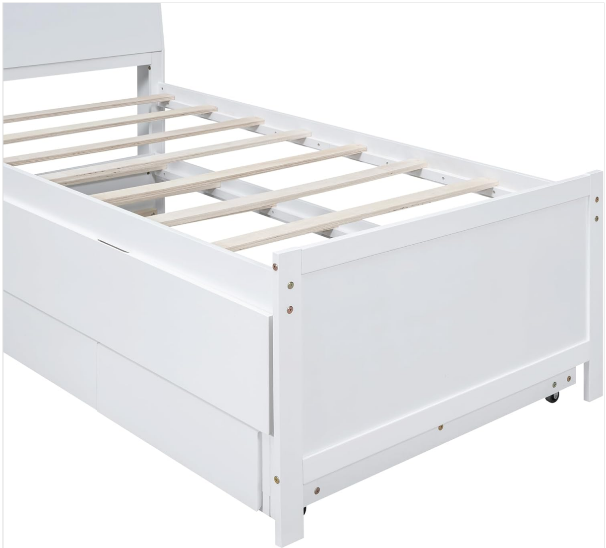
Image: Detailed view of the pull-out trundle bed and the three storage drawers located beneath the main bed frame.