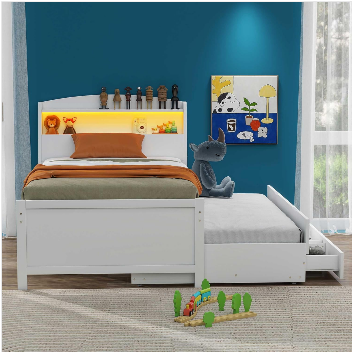
Image: Fully assembled Flieks Twin Platform Bed, showcasing the LED headboard, trundle, and storage drawers.