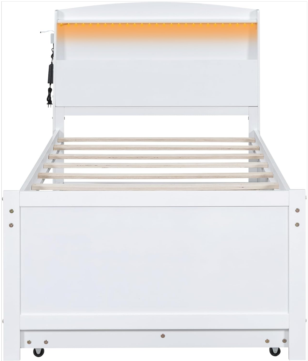
Image: Close-up view of the bed's headboard, showing the integrated LED lighting and the wooden slats for mattress support.