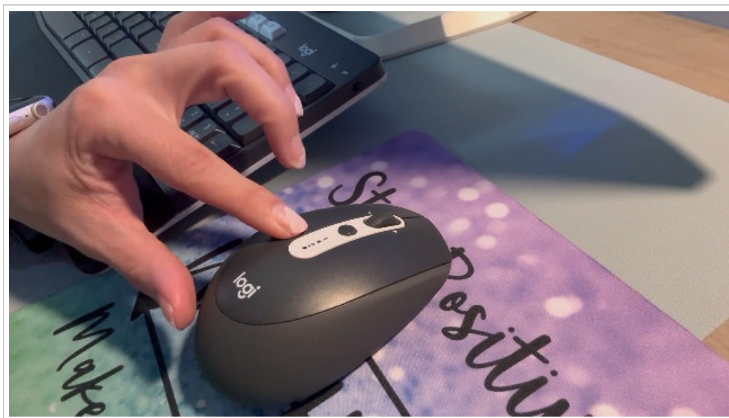
Image: A hand demonstrating the multi-device switching function on the Logitech MK950 keyboard, with numbered keys indicating different device connections.

Both the keyboard and mouse are equipped with Easy-Switch buttons, allowing you to seamlessly switch between up to three connected devices (e.g., laptop, tablet, smartphone) with a single tap.