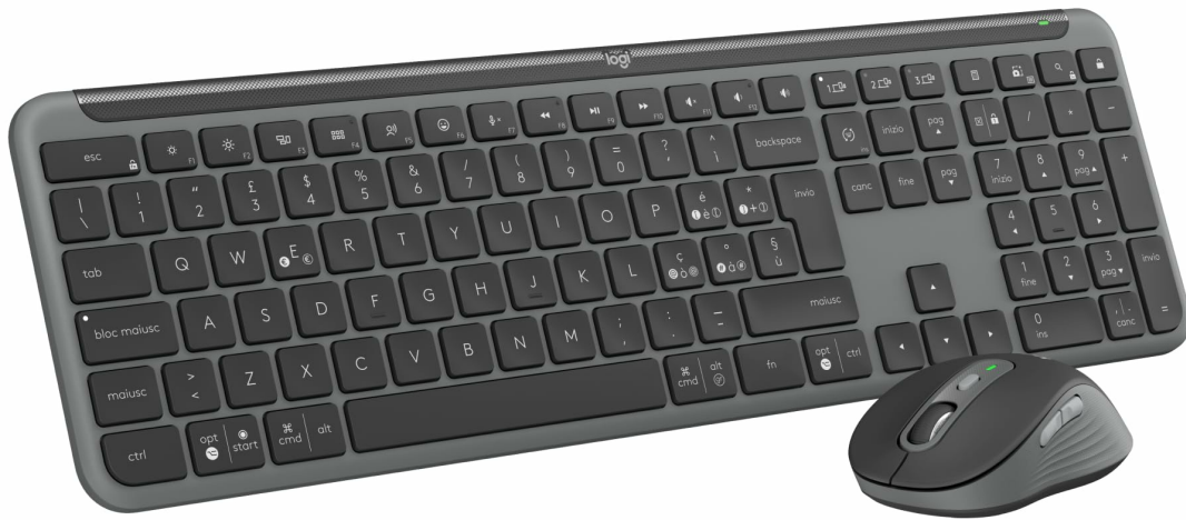
Image: The Logitech MK950 Signature Slim Wireless Keyboard and Mouse Combo, showcasing both the keyboard and mouse in Graphite Grey.