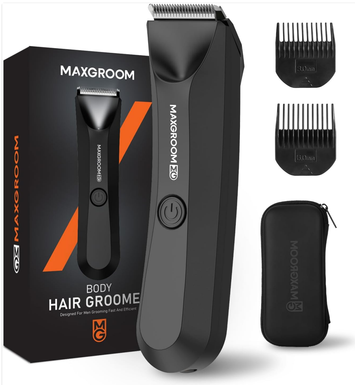
Figure 1: MAXGROOM Body Hair Trimmer and included accessories, including the travel case and guide combs.