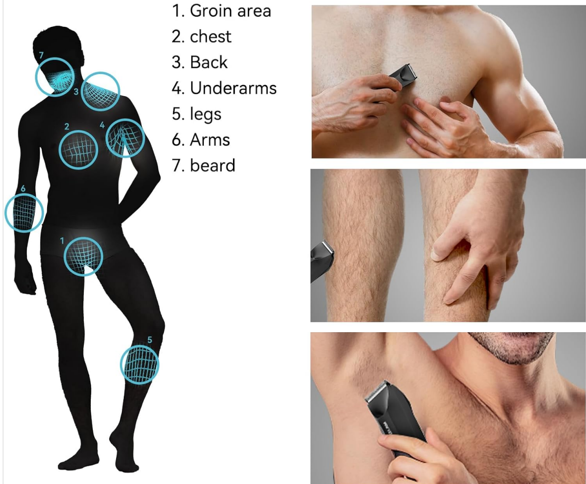
Figure 7: Visual guide to the various body areas suitable for grooming with the MAXGROOM trimmer.