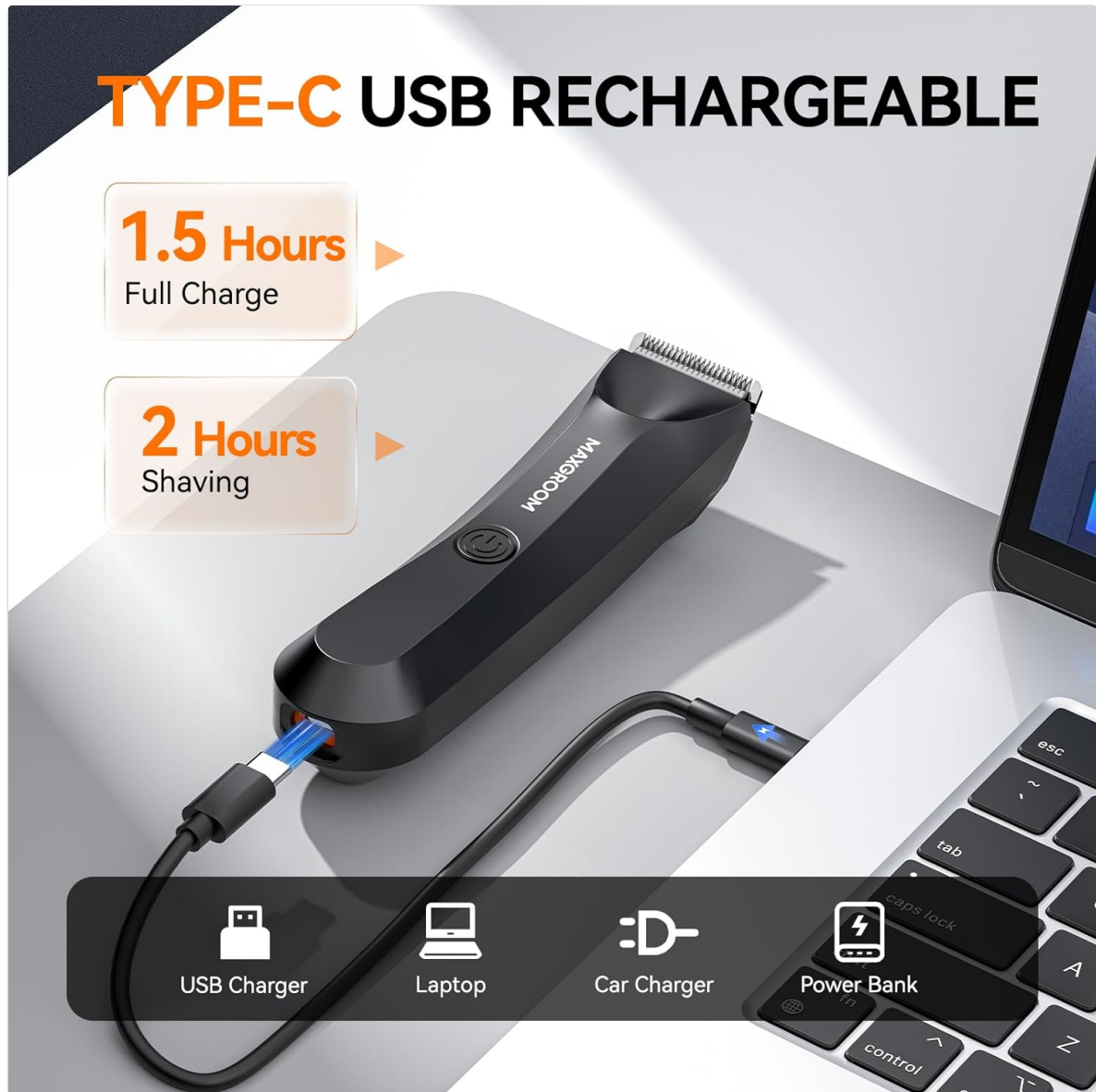
Figure 2: The trimmer being charged using the USB-C cable, compatible with various USB power sources.