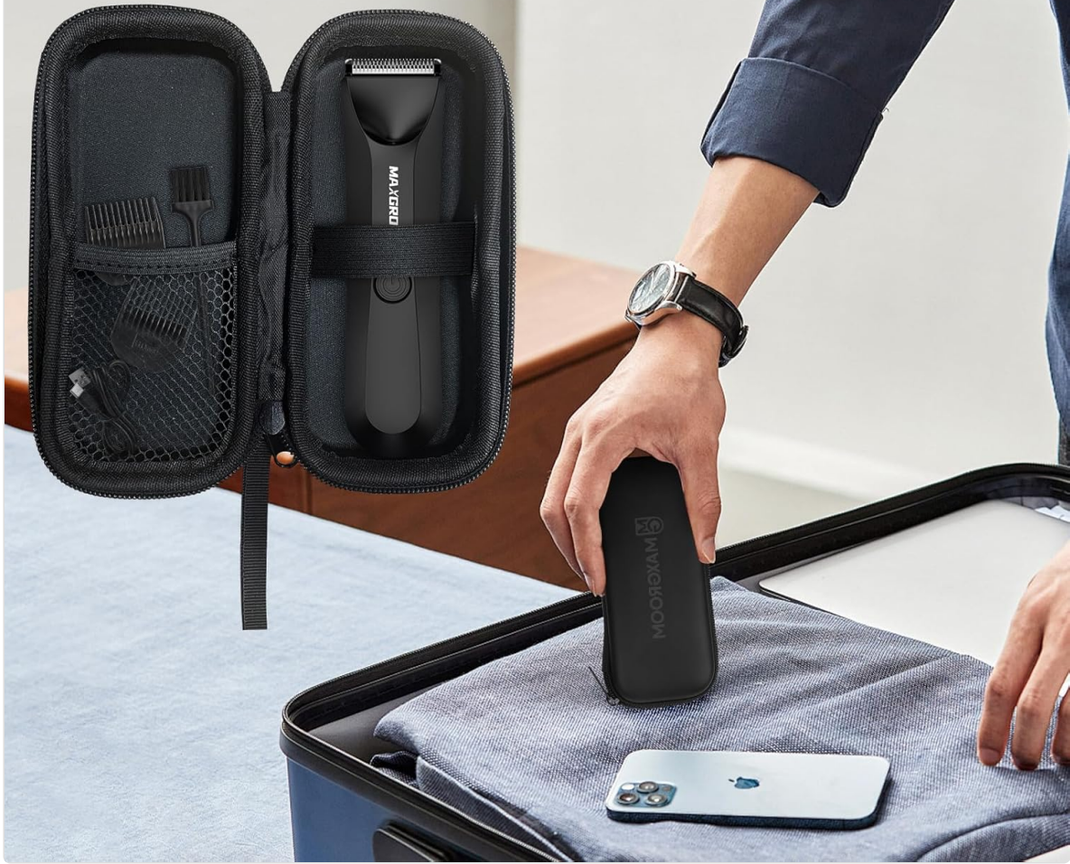
Figure 3: The travel pouch neatly stores the trimmer, charging cable, cleaning brush, and guide combs.