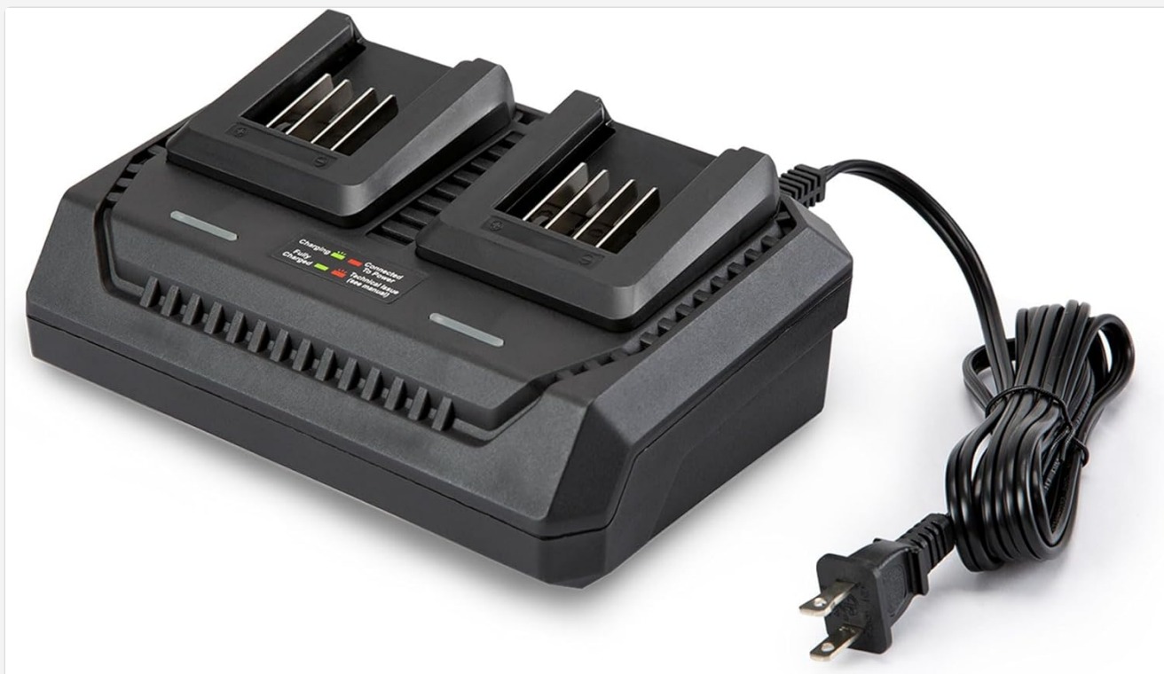
Figure 1: LawnMaster MX24V Dual-Battery Charger with power cord.

The LawnMaster MX24V Dual-Battery Charger (Model 24LFC15-ETL) is designed to efficiently charge two LawnMaster 24V and 48V rechargeable batteries simultaneously. This charger features LED indicators to provide real-time charging status, ensuring your batteries are ready when you need them. It is an essential accessory for maintaining the power of your LawnMaster cordless tools.