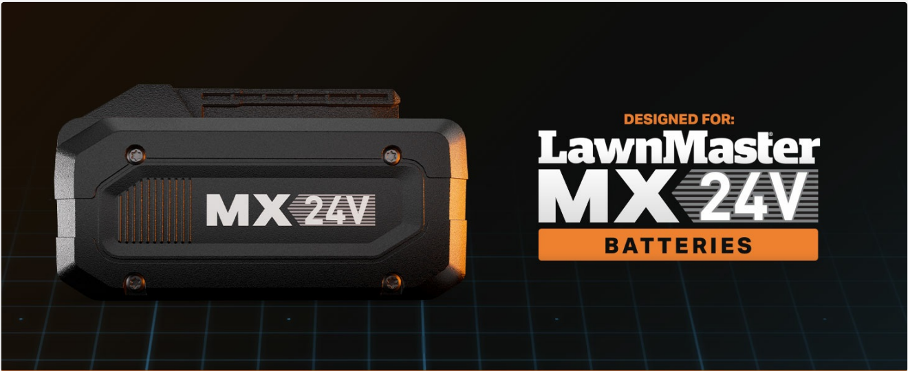
Figure 6: The LawnMaster MX24V battery, compatible with this charger.