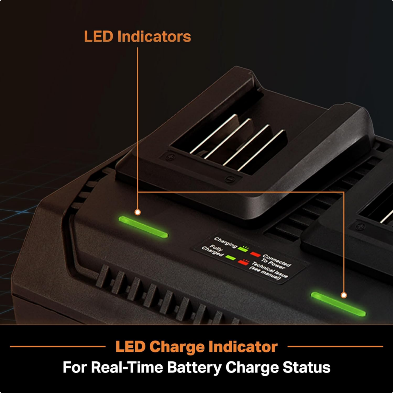
Figure 4: Close-up of the LED charge indicators on the charger.