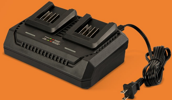
Figure 2: Overview of the LawnMaster MX24V Dual-Battery Charger.