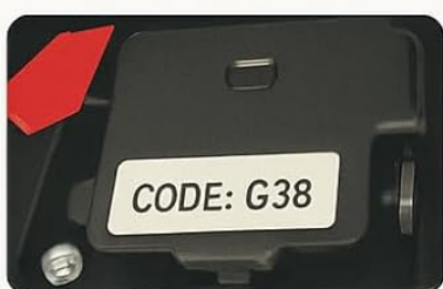
On a Label Inside/ Behind the Lock