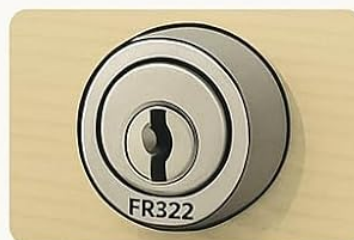
On the Lock Face