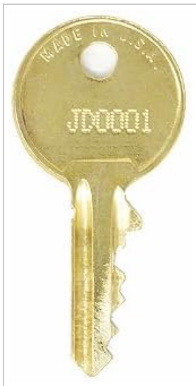
Image 1: Example of an EasyKeys replacement key from the JD series. This key is custom-cut to match your specific lock code.

This document provides essential instructions for the EasyKeys replacement key, specifically designed for Yale Lock systems with the code JD0323. This key is compatible with various applications, including file cabinets, desks, and cubicles that utilize Yale Lock mechanisms within the JD0001 - JD1600 series.