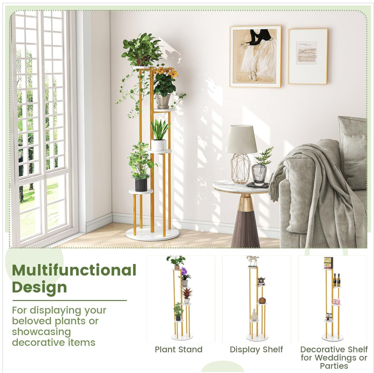
Figure 4: The stand's capacity to hold various items, highlighting its versatility as a display unit.