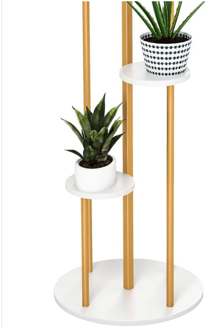
Figure 1: The Giantex 4-Tier Metal Plant Stand, showcasing its tiered design and capacity for multiple plants.