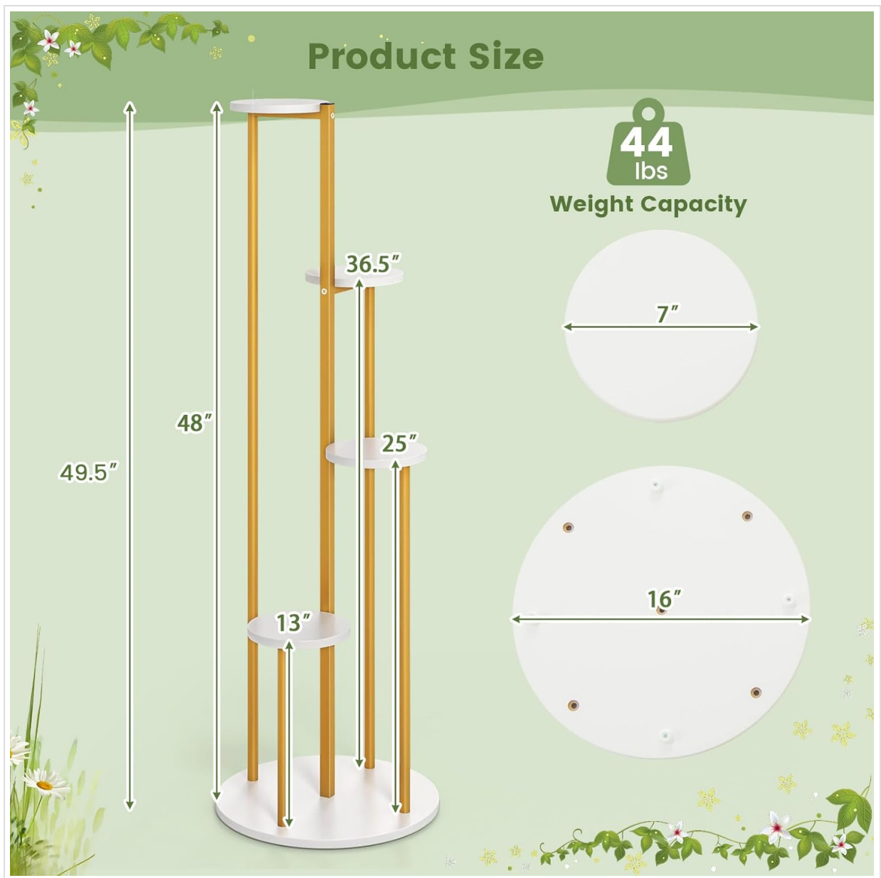
Figure 5: Detailed product dimensions for the 4-Tier Metal Plant Stand.