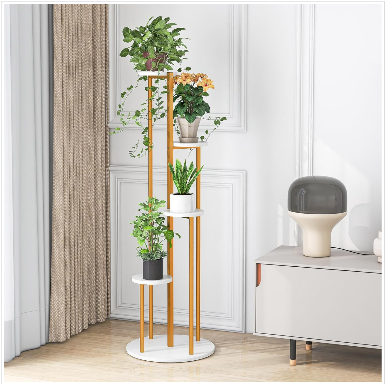
Figure 3: The plant stand effectively displaying a variety of potted plants in a home setting.