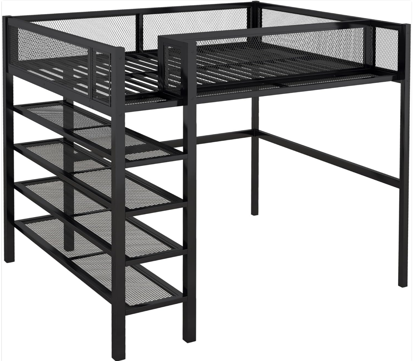
Image: An angled view of the partially assembled metal frame, showing the robust structure and connection points for the main supports.

Begin by connecting the main horizontal and vertical support beams using the provided bolts and Allen wrench. Do not fully tighten bolts until the entire frame is assembled.