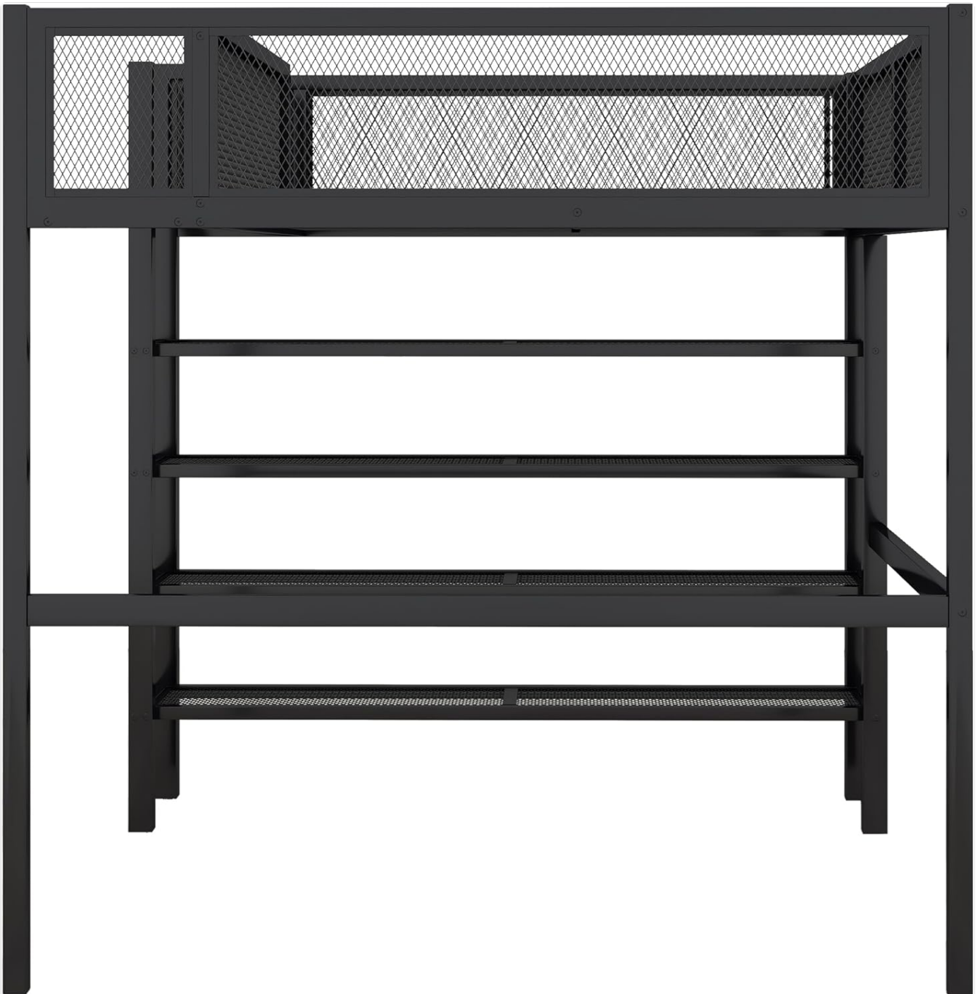
Image: A front view of the loft bed, highlighting the upper bedside storage shelf and the spacious area underneath the bed.