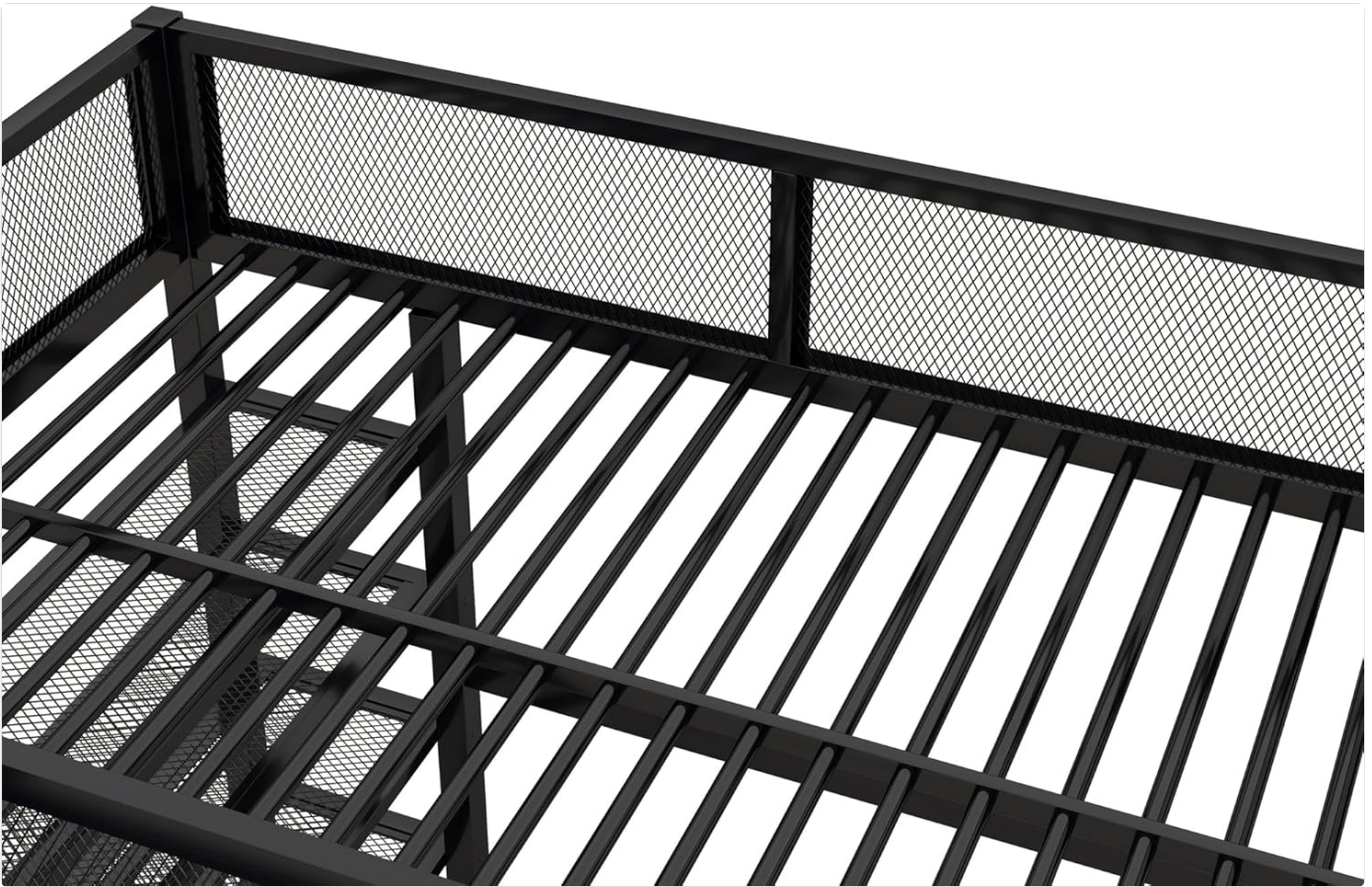
Image: A close-up view of the metal slats that form the bed base, demonstrating the sturdy support for the mattress.