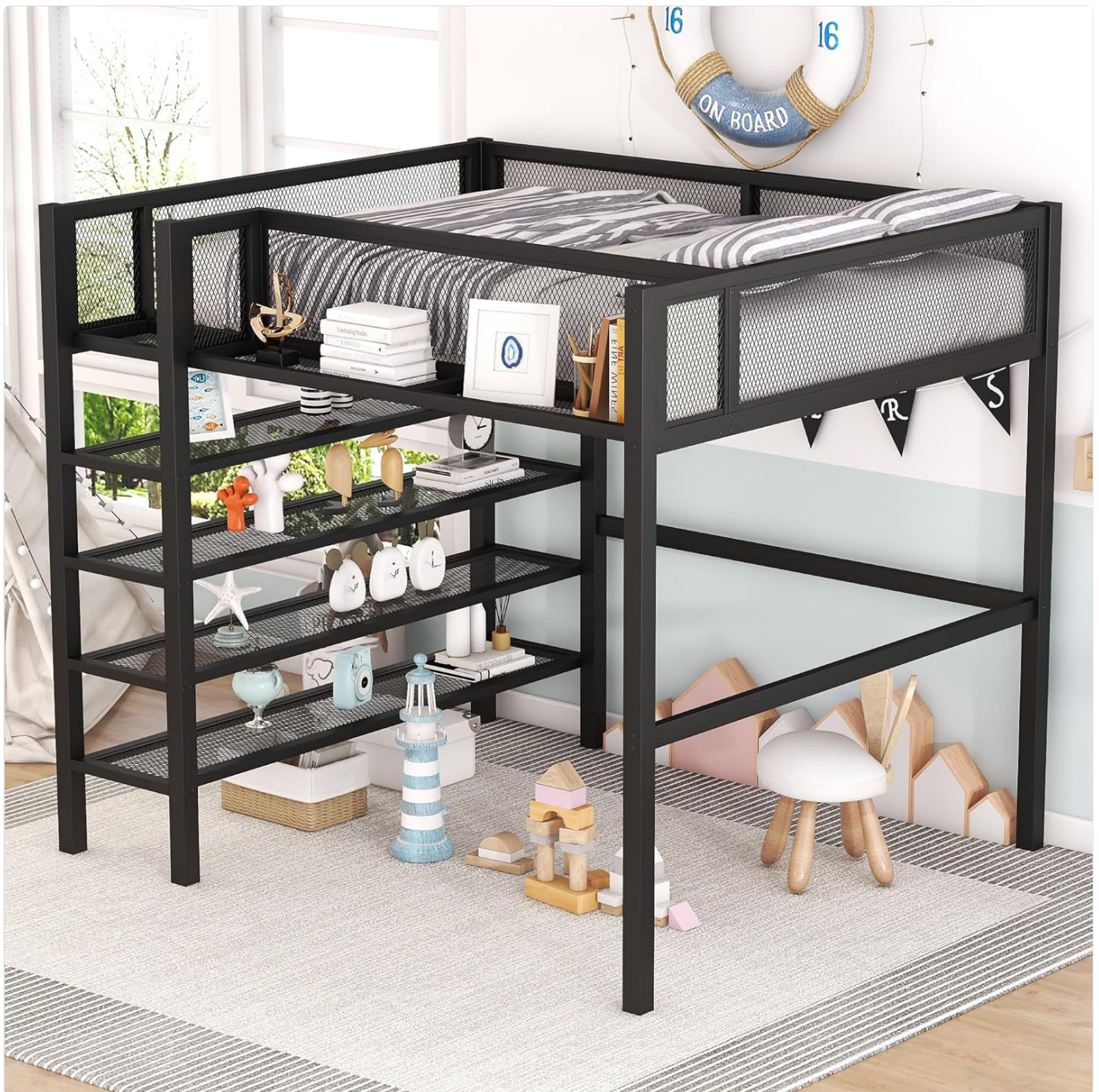
Image: The Harper & Bright Designs Full Size Metal Loft Bed, showcasing its integrated shelving and the open space beneath the bed, suitable for various uses.