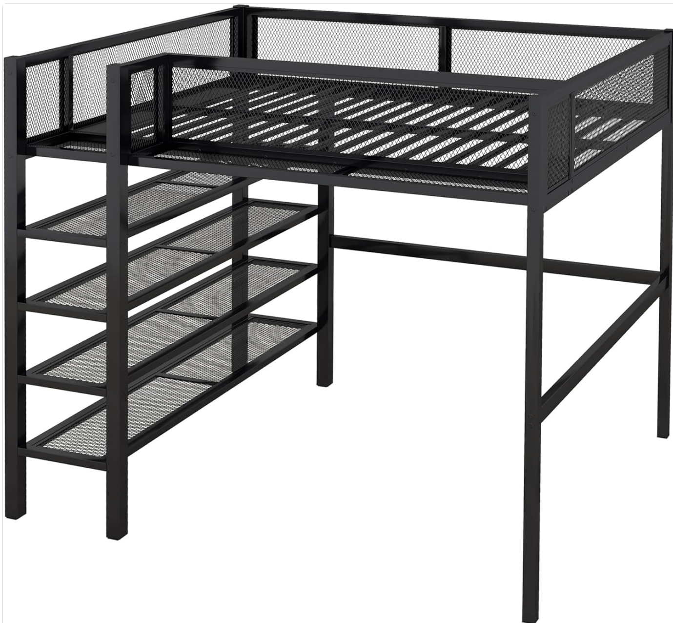
Image: The loft bed viewed from the side, clearly showing the integrated 4-tier shelving unit that doubles as a ladder.