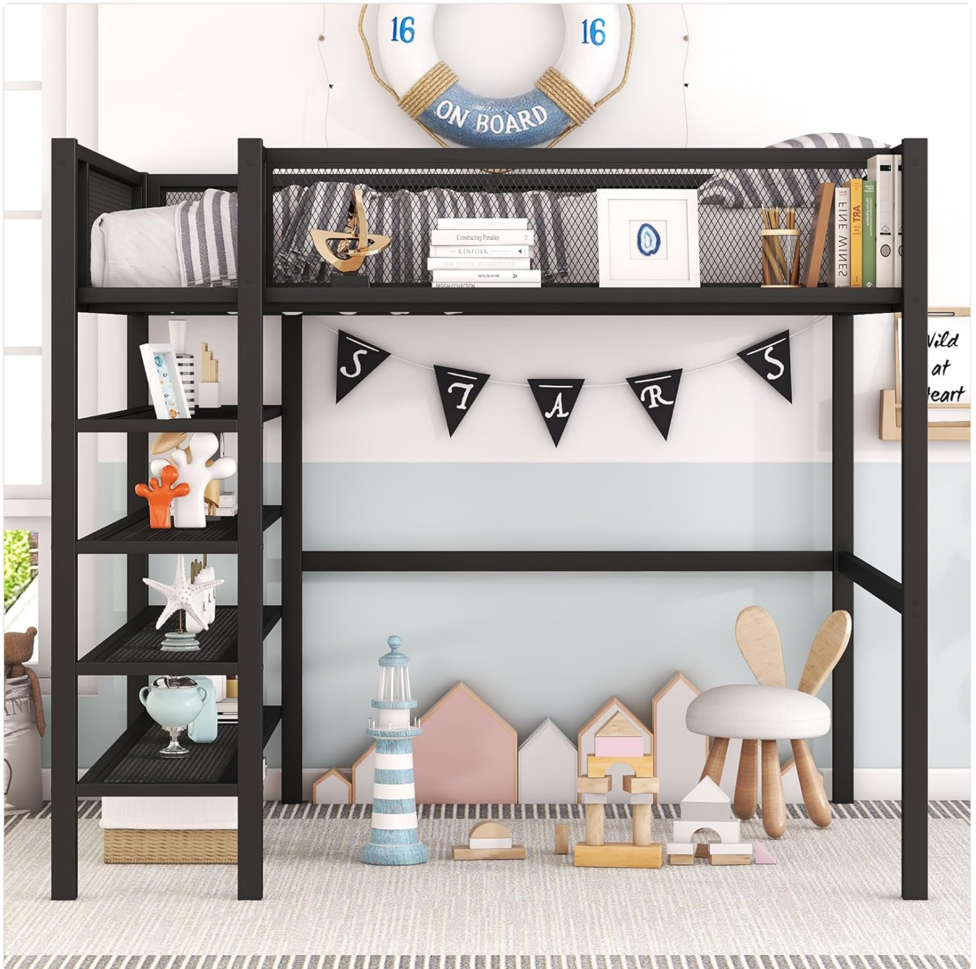
Image: The loft bed integrated into a room, demonstrating how the space underneath can be utilized for various activities, such as a play area or study space.