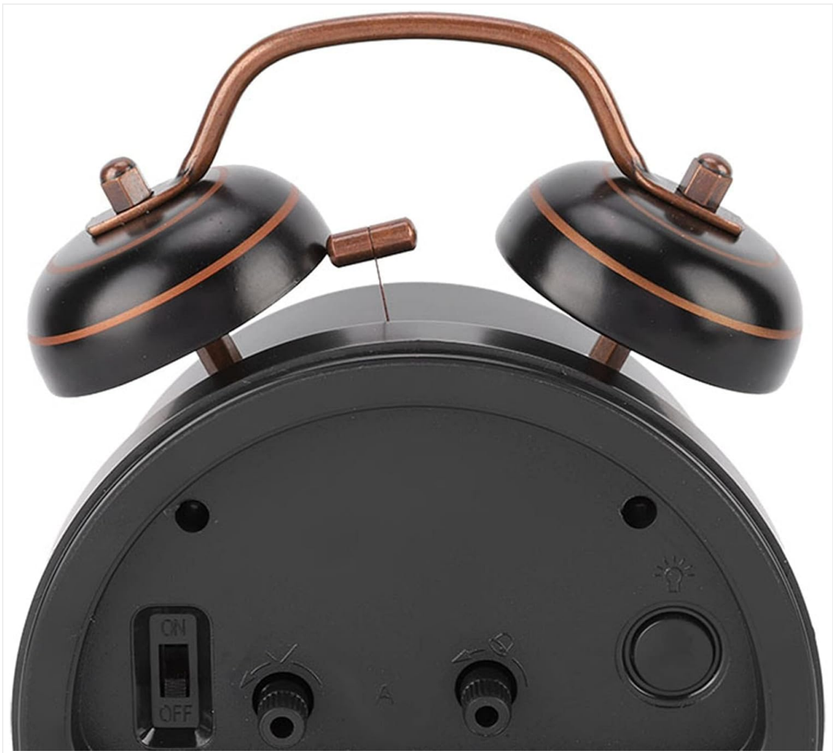
Figure 2: Rear view of the alarm clock, highlighting the battery compartment and adjustment knobs.