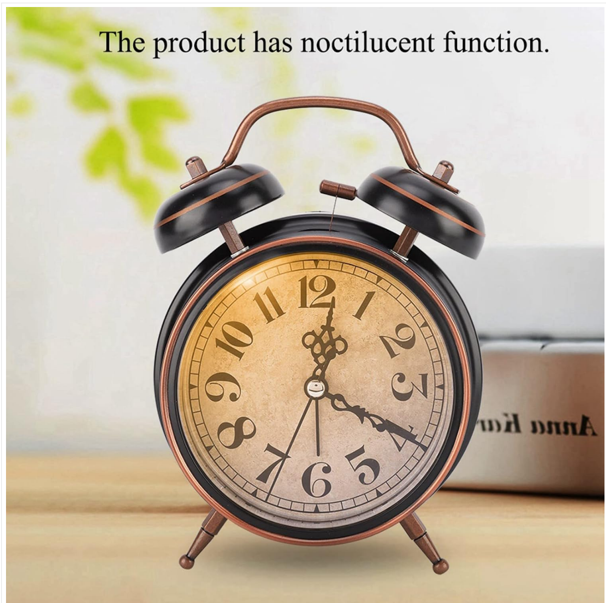
Figure 3: The alarm clock demonstrating its night light function, providing soft illumination for visibility in low light conditions.