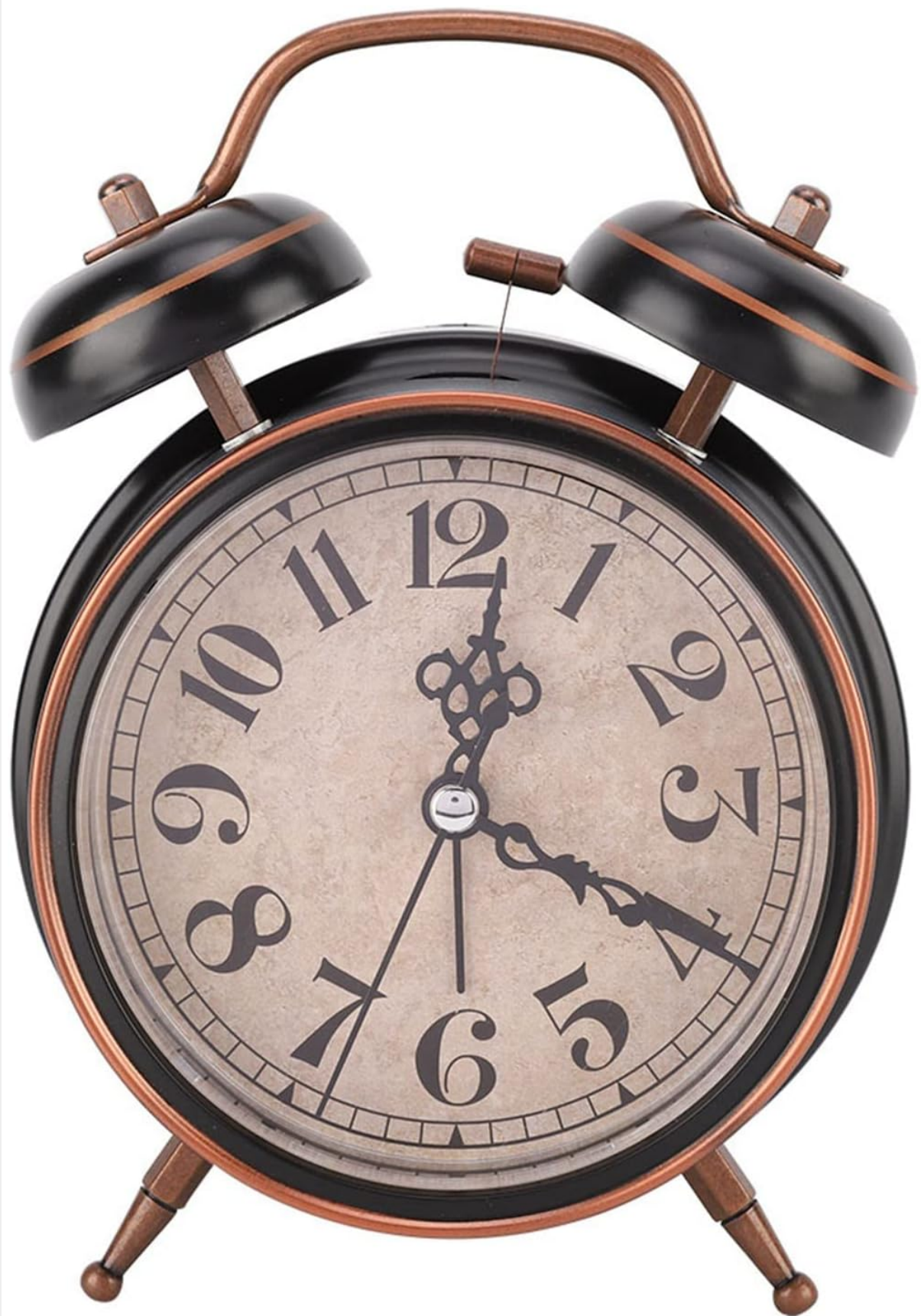
Figure 1: Front view of the Estink Retro Alarm Clock. This image shows the classic round design with large, easy-to-read numbers and the twin bells at the top.