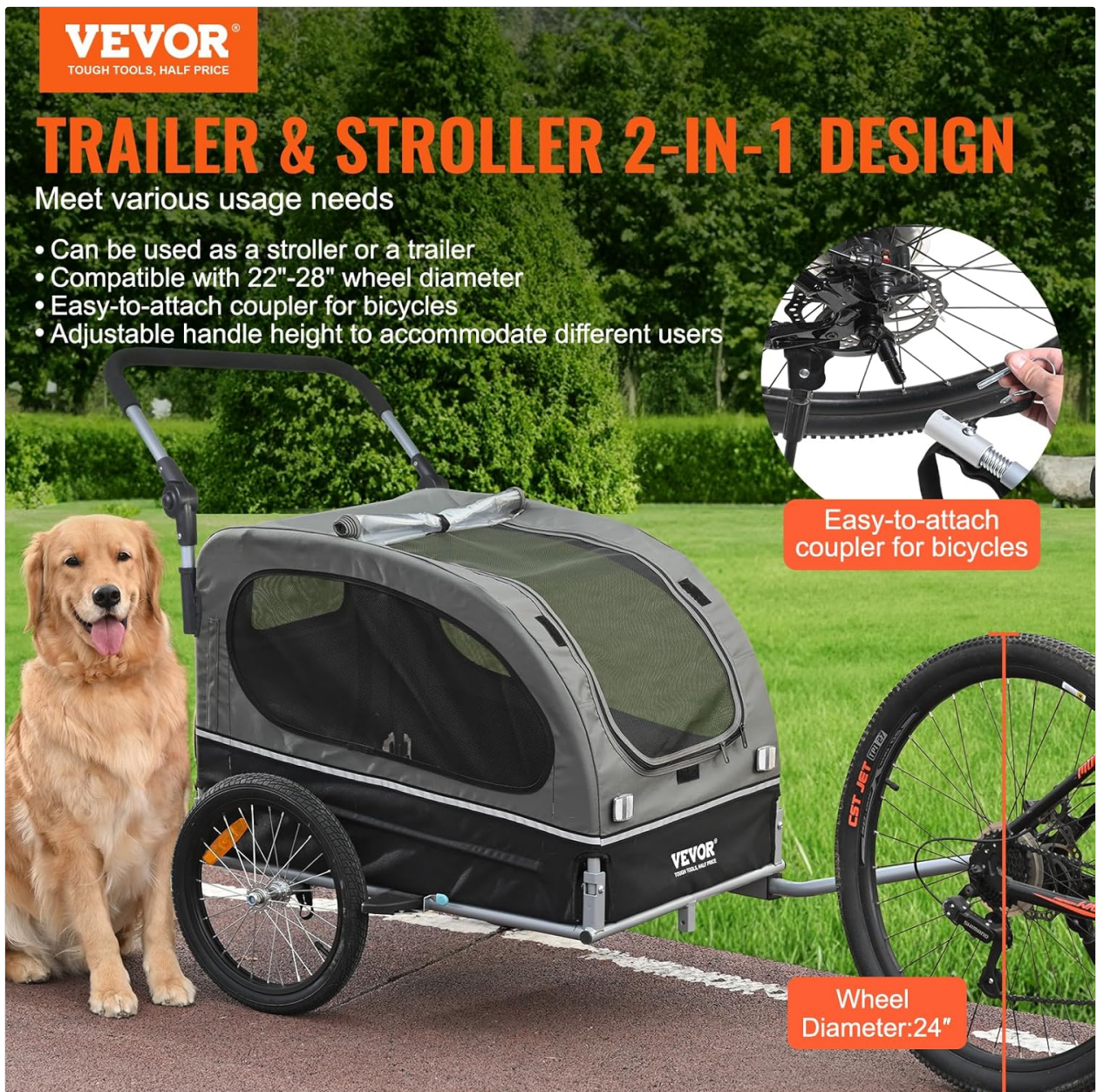
The trailer with rear wheels attached, ready for use.

Insert the inflatable rear wheels into the axle receivers on both sides of the trailer frame. Press the quick-release button on the wheel hub and slide the wheel into position until it locks securely. Repeat for the second wheel.