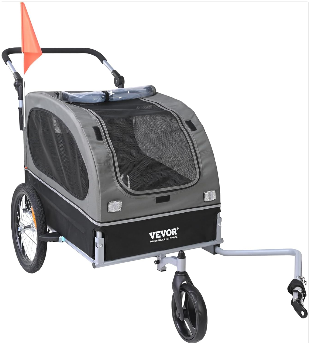
The pet carrier configured as a bike trailer, showing the towing bar and safety flag.