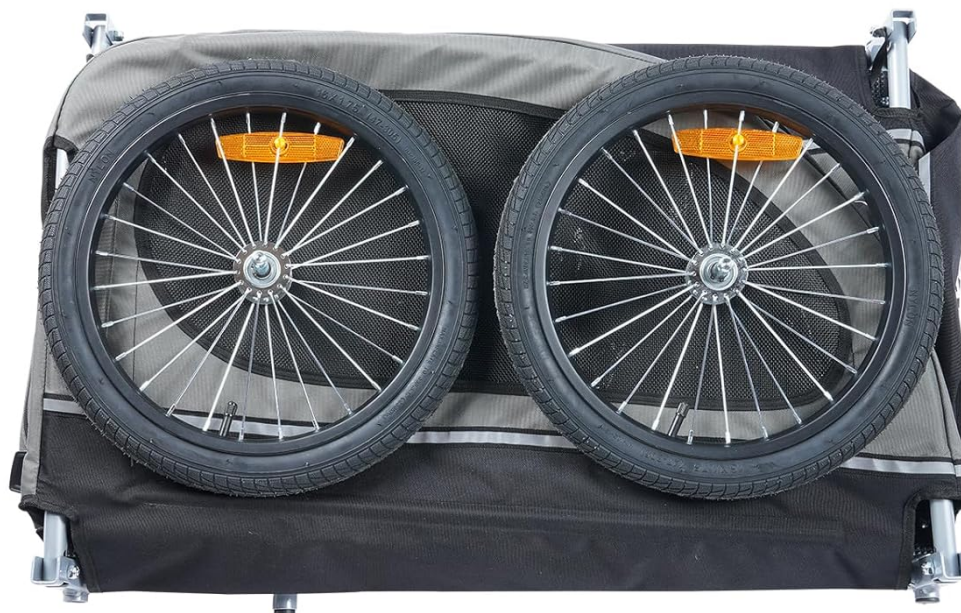
The pet carrier folded for compact storage and transport.