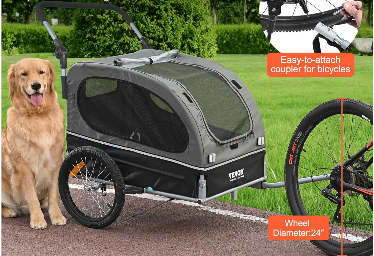
Close-up of the easy-to-attach coupler for bicycles.